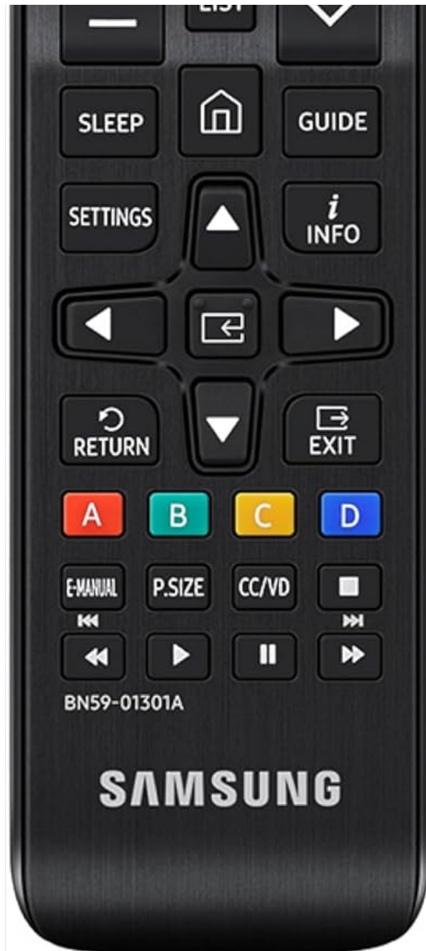
Image: Front view of the Samsung Universal IR Remote Control, showing all buttons and the Samsung logo at the bottom.