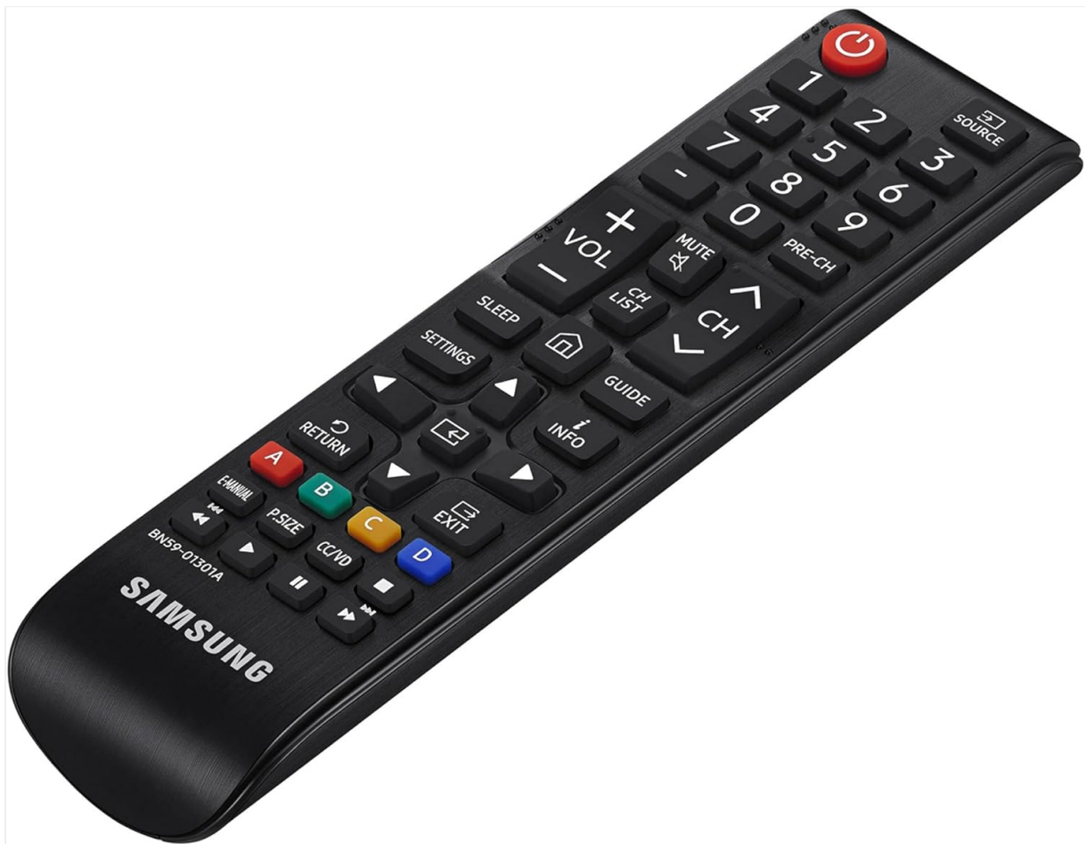
Image: Close-up front view of the remote control, clearly displaying all buttons and their labels.