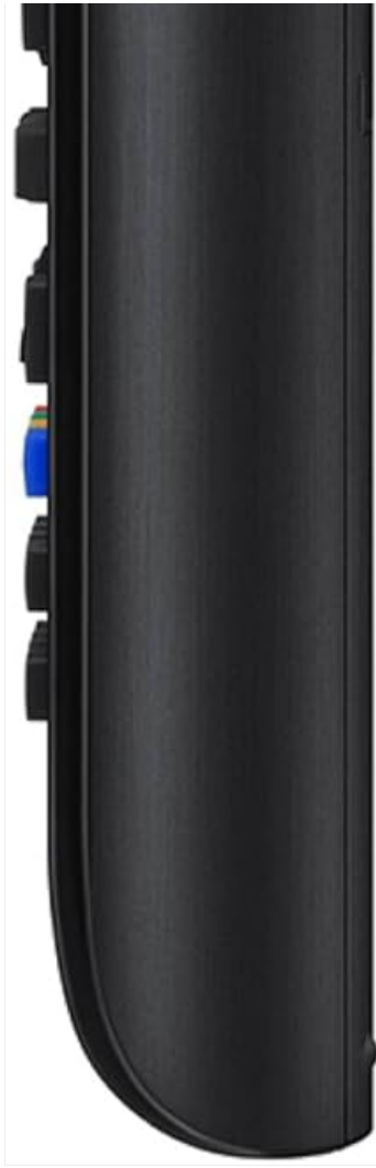
Image: Back view of the remote control, highlighting the battery compartment cover.