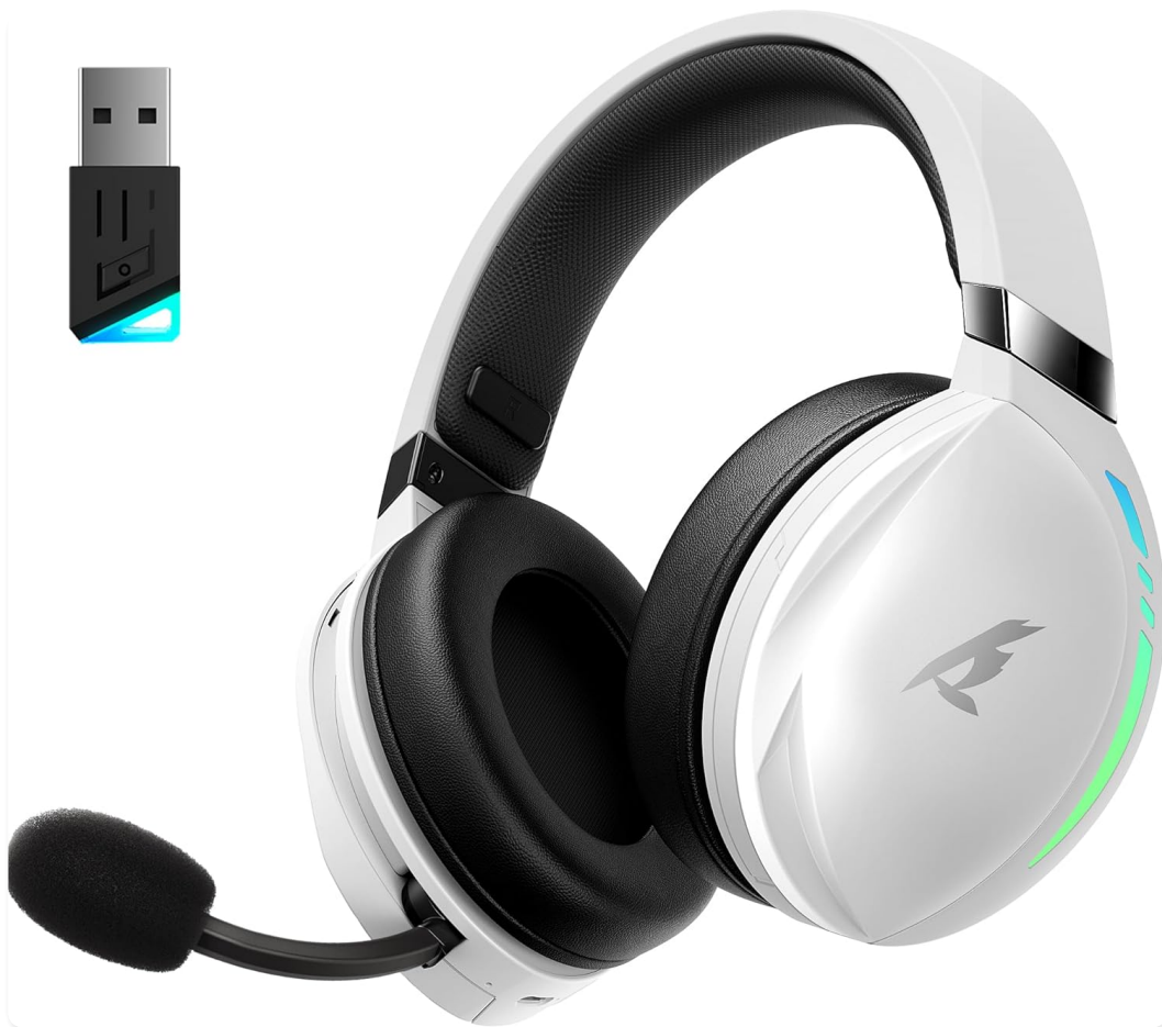
The KOFIRE UG-06 Wireless Gaming Headset in white and black, shown with its USB dongle.