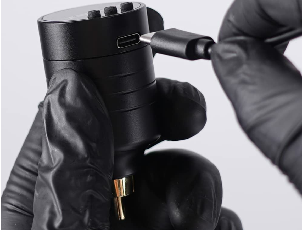
Image: The Type-C USB charging port on the B2 battery pack, with a charging cable being inserted. The battery should be fully charged before use.

Connect the provided Type-C USB cable to the charging port on the B2 battery and plug it into a suitable power source. The battery indicator will show charging status. A full charge takes approximately 2 hours.