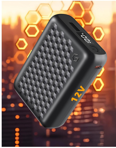
Figure 1: Front view of the Wulcea Power Bank showing the digital display and power button.