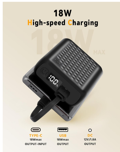
Figure 3: Power bank connected to a smartphone, illustrating 18W high-speed charging capability via Type-C.

Once connected, the power bank should automatically begin charging your device. If not, press the power button once to initiate charging. The digital display will show the real-time current and voltage during charging.