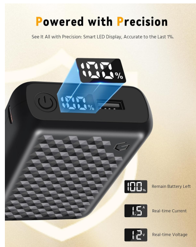
Figure 2: Detailed view of the LED digital display indicating battery percentage, real-time current, and real-time voltage.

The power bank features a textured surface for grip, a power button, and a clear digital display on the top surface. The various ports are located on the sides for easy access.