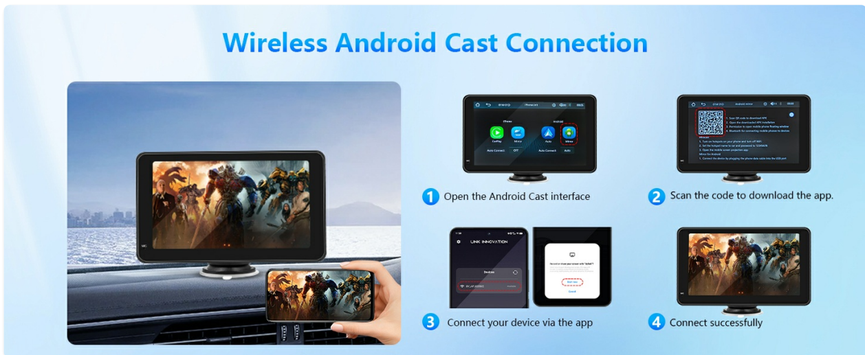
Figure 5.4: Wireless Android Cast connection steps.