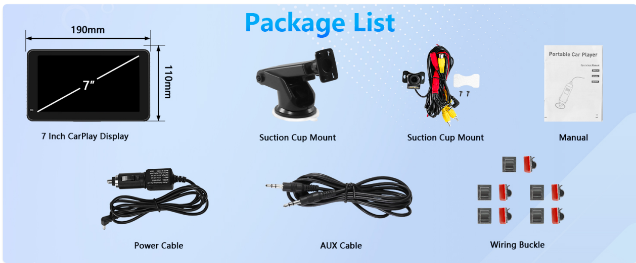
Figure 2.1: Package contents including the 7-inch CarPlay display, suction cup mounts, rear camera, cables, and manual.