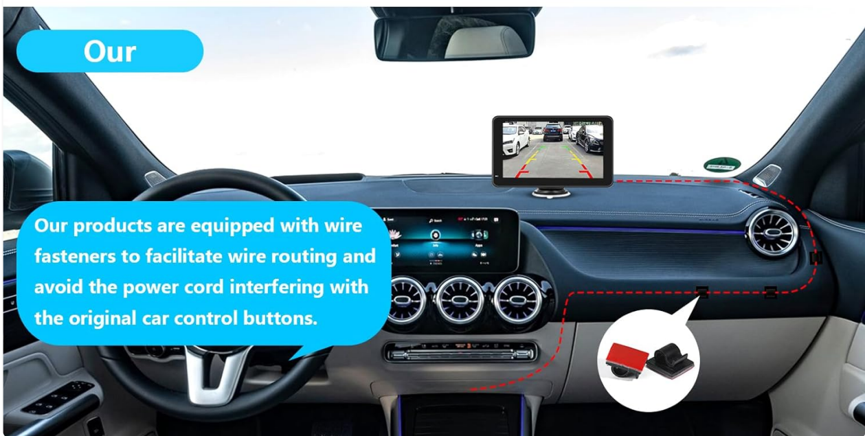
Figure 4.1: Display mounted on the dashboard with cable management.