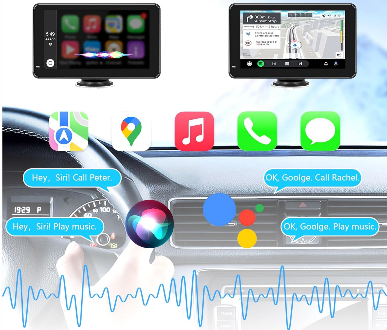
Figure 5.6: Voice control features.