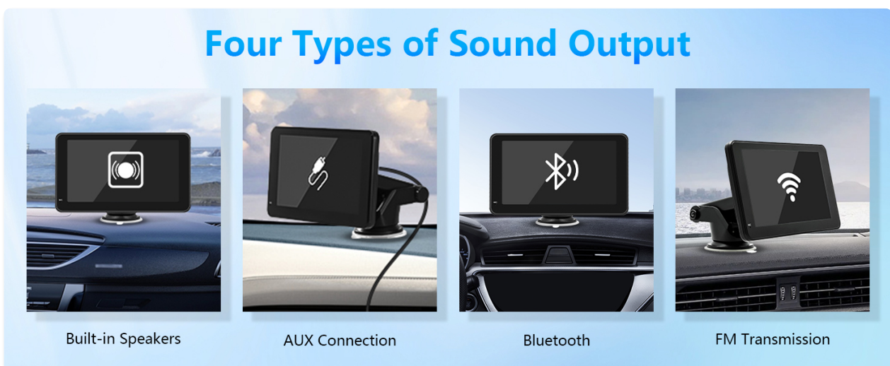
Figure 5.5: Available audio output methods.