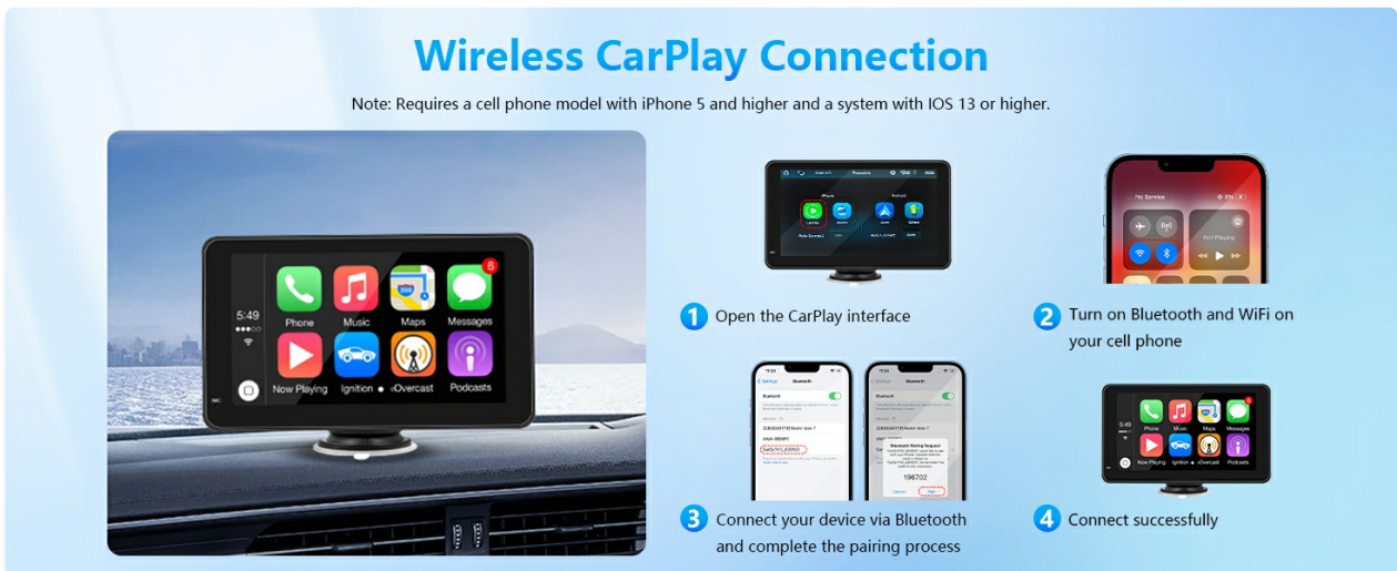
Figure 5.1: Wireless CarPlay connection steps.