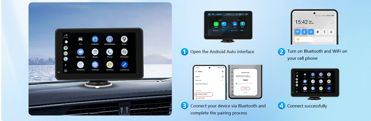
Figure 5.2: Wireless Android Auto connection steps.

Note: Requires a cell phone with 5G WiFi support and Android 11 or higher.