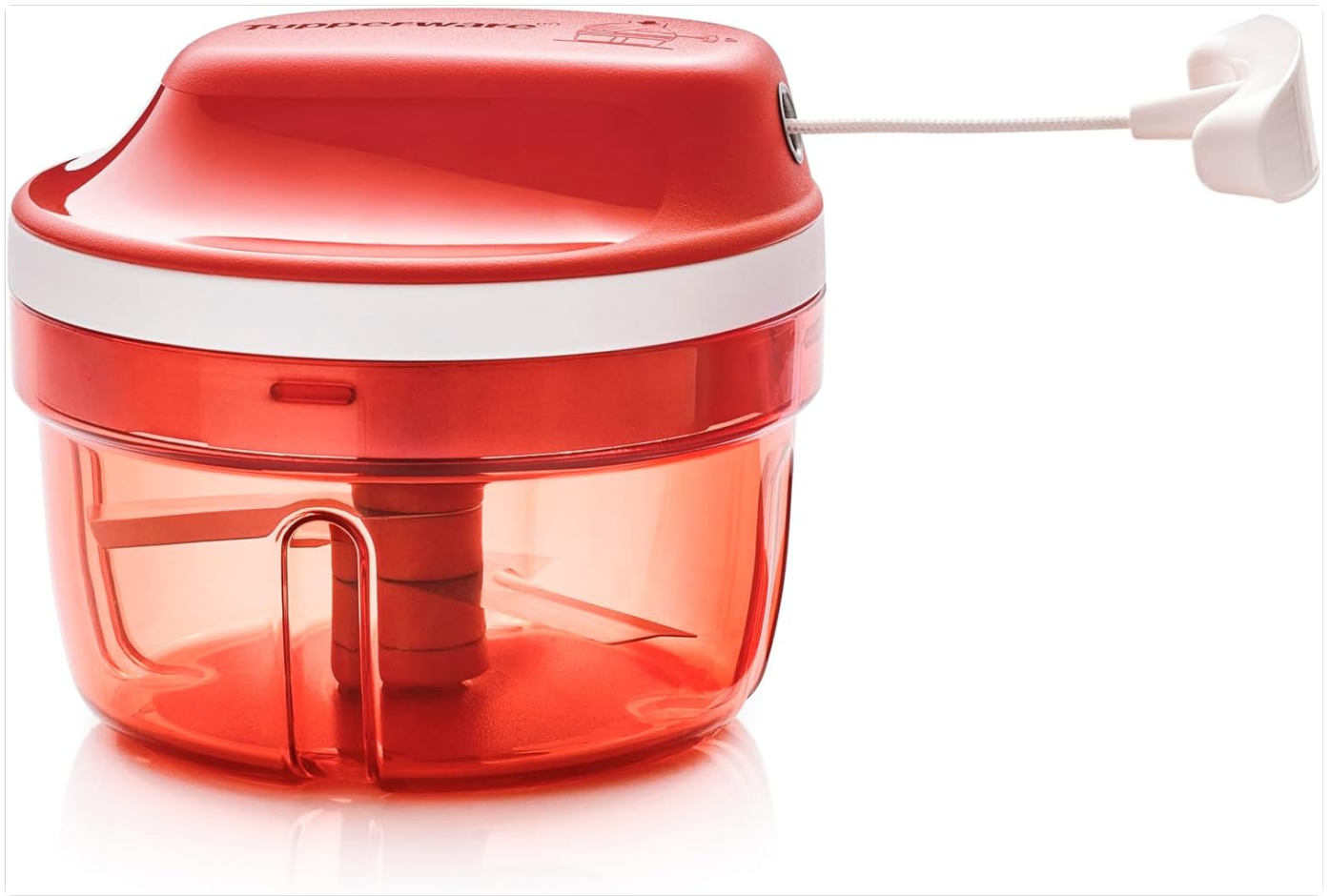
Image: The Tupperware SuperSonic Chopper Compact, showing its main components: the red transparent container, the blade assembly inside, and the red lid with the white pull handle.