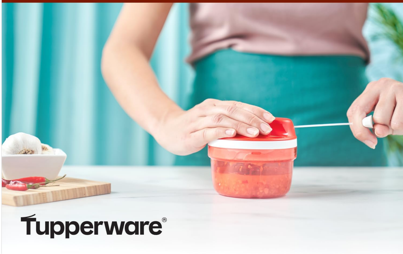
Image: A person is shown operating the Tupperware SuperSonic Chopper Compact, pulling the white handle to activate the chopping mechanism. The text overlay indicates "SuperSonic™ Chopper Compact" and "Cut your chopping time in half just by pulling the handle."

Cut your chopping time in half just by pulling the handle.