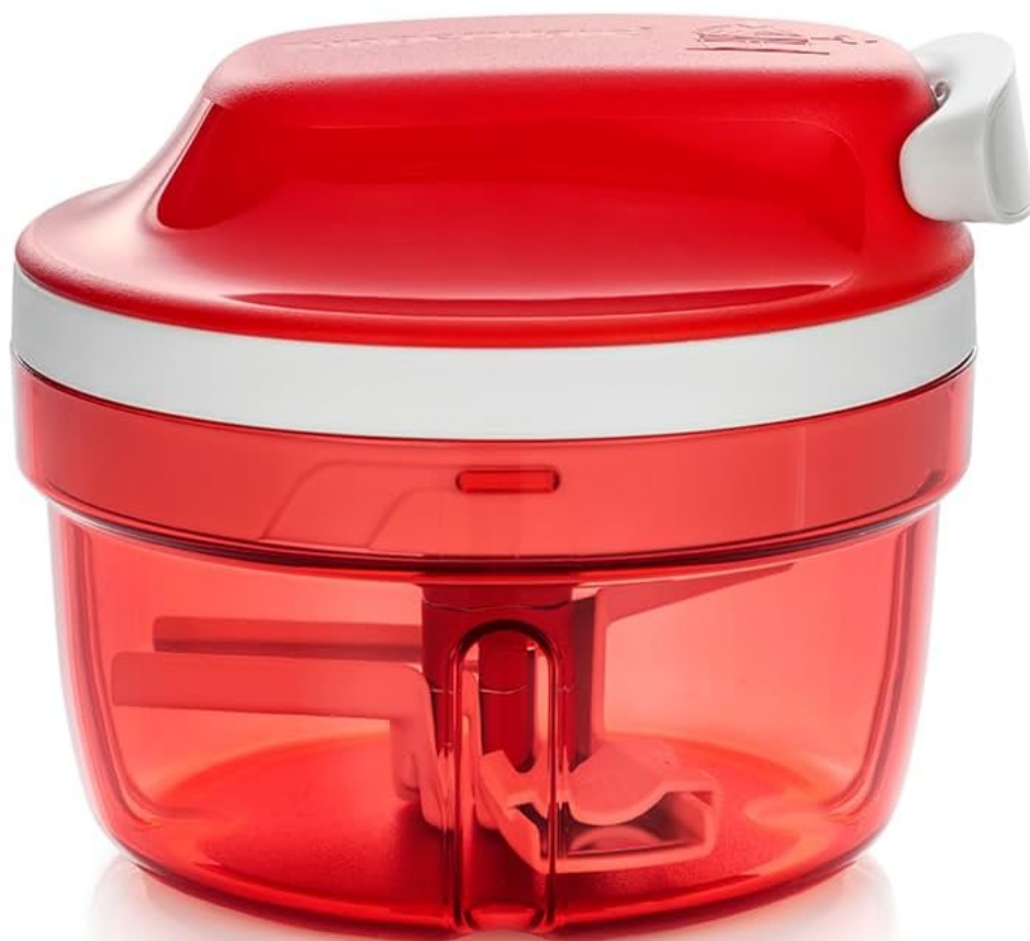
Image: A diagram showing the dimensions of the Tupperware SuperSonic Chopper Compact, indicating a height of 3.7 inches (9.3 cm) and a width of 4.5 inches (11.3 cm), with a capacity of 11.15 oz / 329.74 mL.