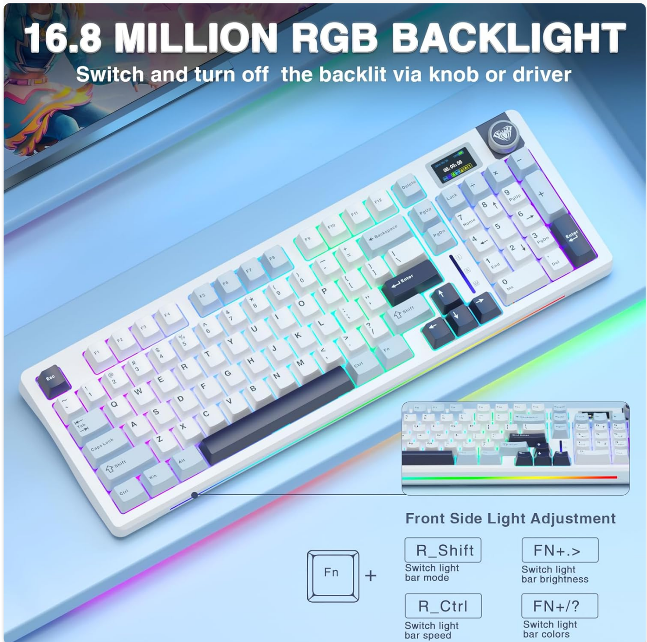
Figure 6: RGB Backlight Customization

The keyboard features 19 RGB lighting effects and over 16.8 million colors, including a front side light. You can switch and adjust the backlight via the multi-function knob or the programmable software.