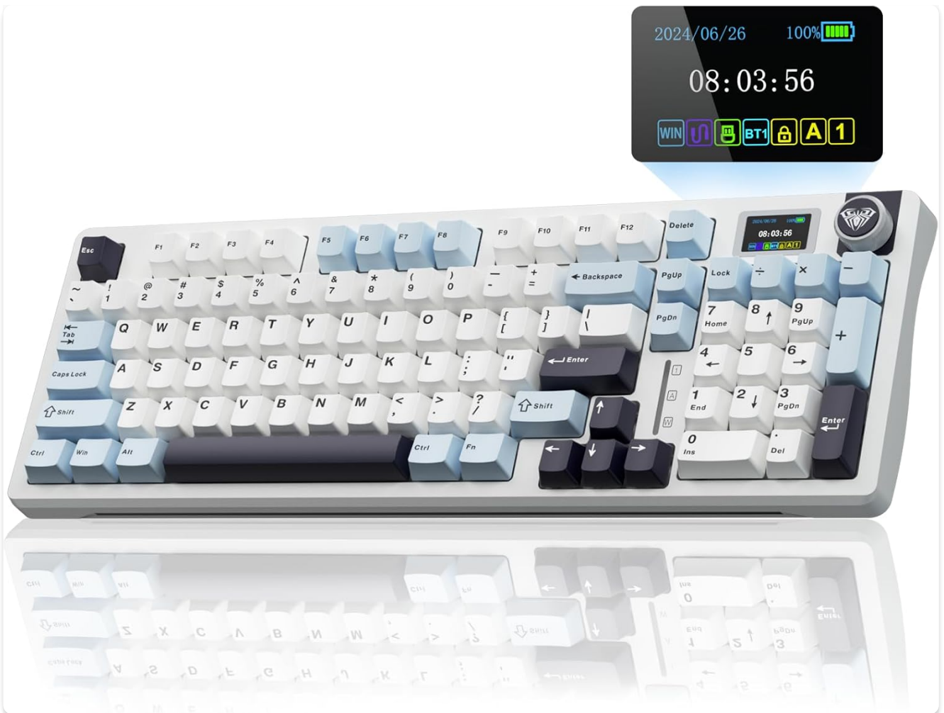
Figure 1: AULA S98 Pro Wireless Mechanical Keyboard Overview