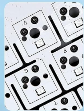
South Facing LEDs