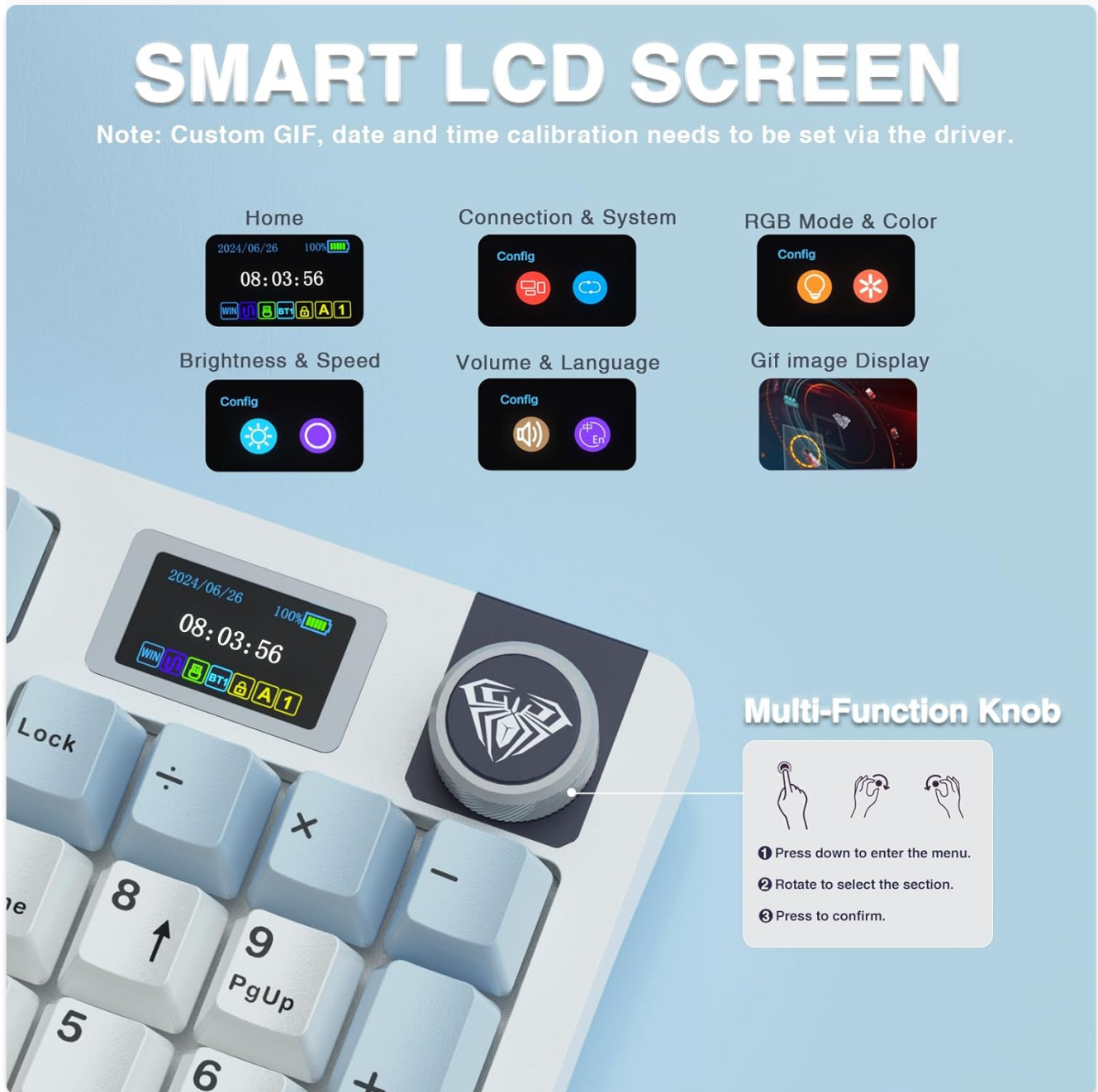
Figure 5: Smart LCD Screen and Knob Functions

The LCD screen displays essential information such as date, time, battery level, system, and connection mode. The multi-function knob allows for quick adjustments.