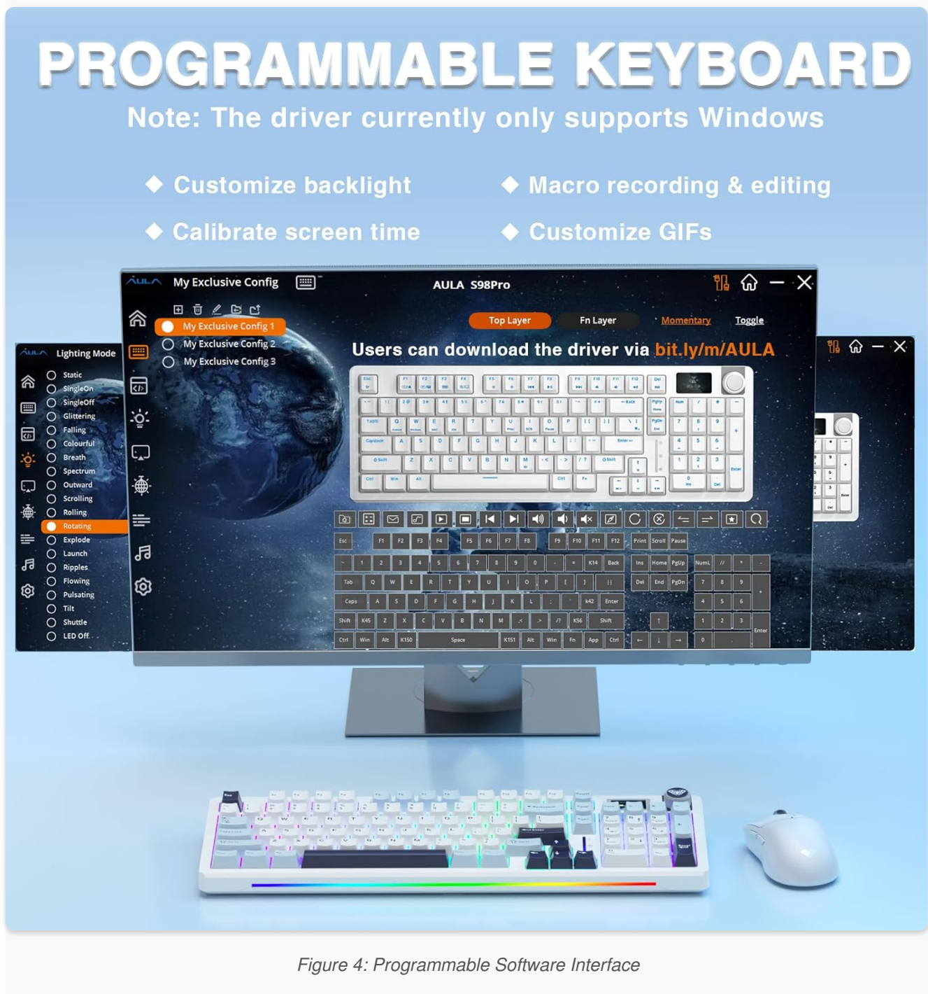
Figure 4: Programmable Software Interface