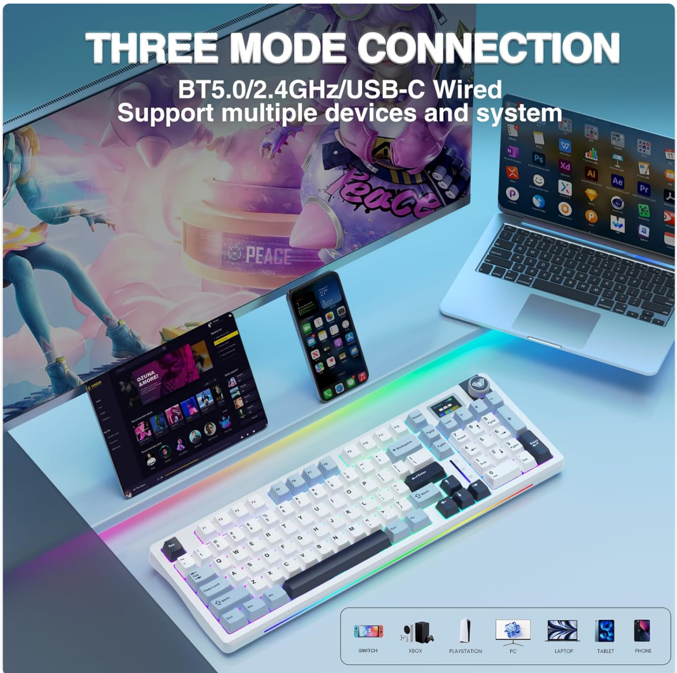
Figure 3: Tri-Mode Connection Capabilities