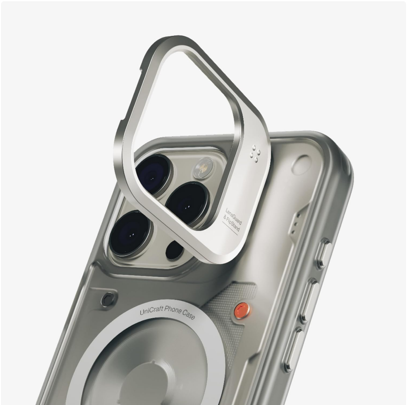
Image 4.1: Close-up view of the LensGuard extended to function as a multi-angle stand.