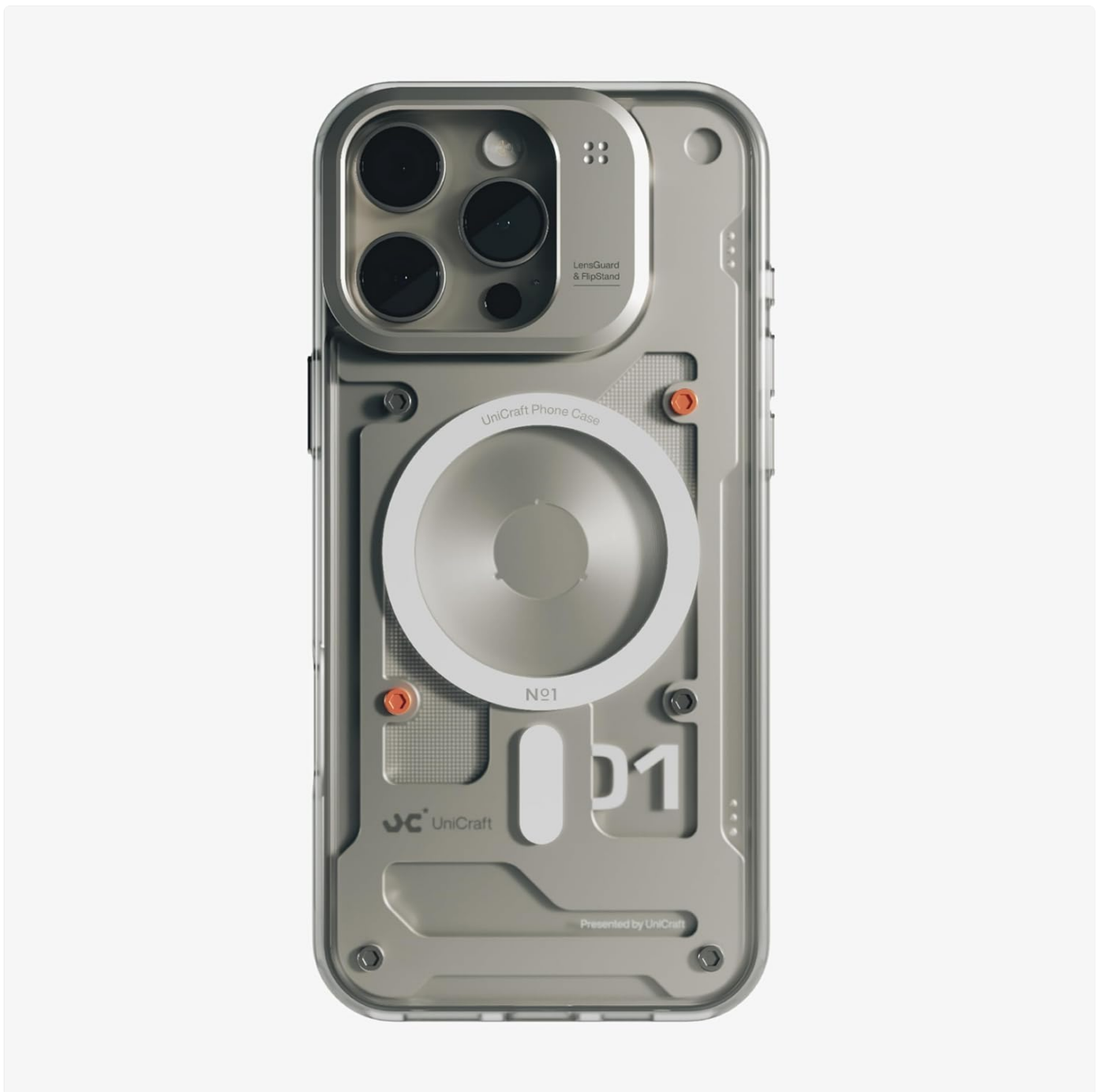
Image 3.1: The UniCraft No.01 Case securely installed on an iPhone 15 Pro Max, showing the seamless integration.