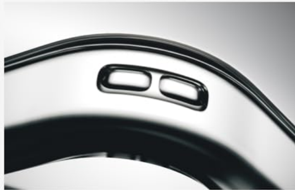
Image 4.2: The UniCraft No.01 Case showcasing its strong MagSafe compatibility for secure accessory attachment and wireless charging.

Ti Alloy Reinforced Shell Air Guard Corners Al Alloy LensGuard