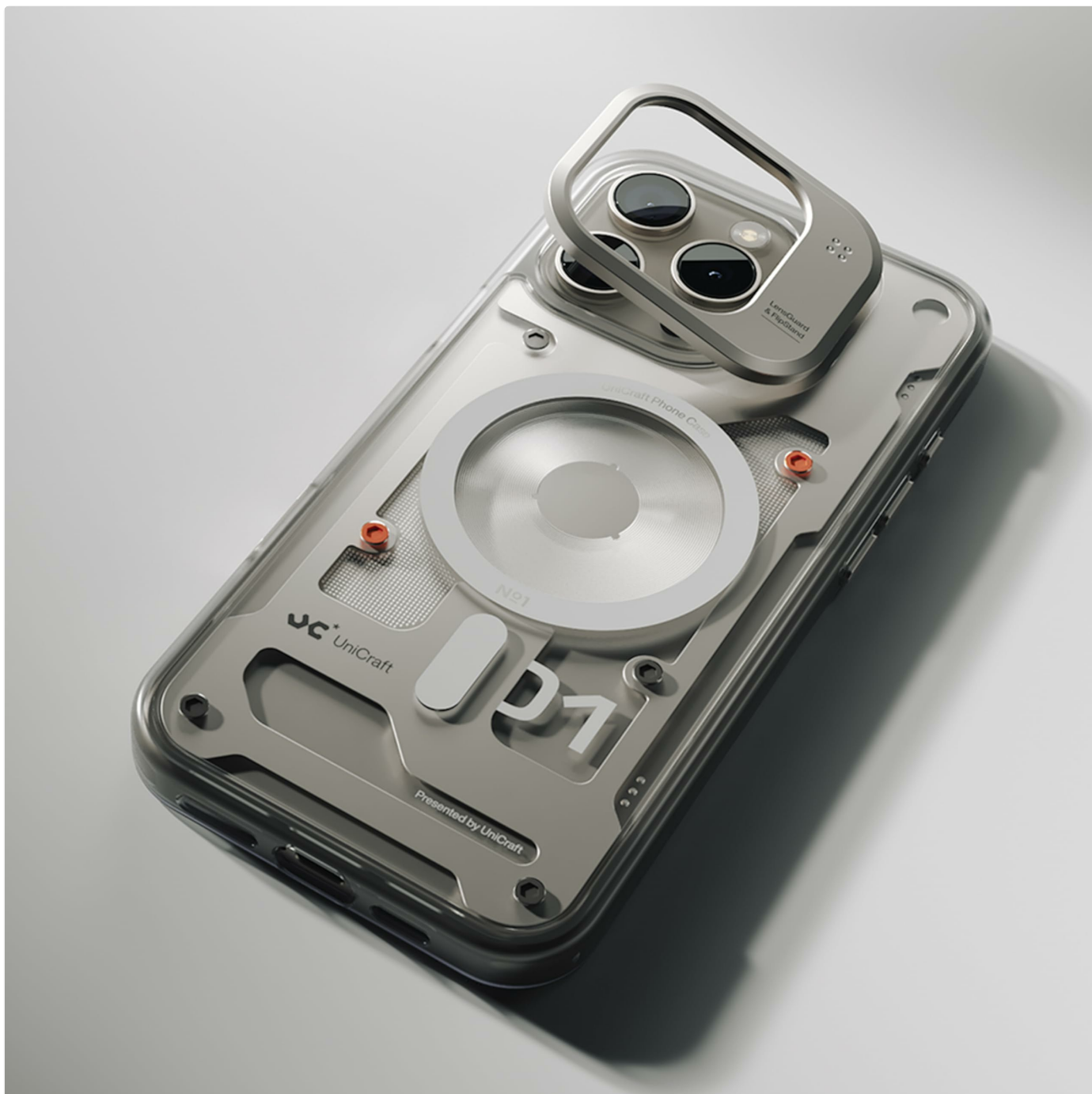
Image 1.1: Rear view of the UniCraft No.01 Case for iPhone 15 Pro Max, showcasing the integrated MagSafe ring and camera lens guard.