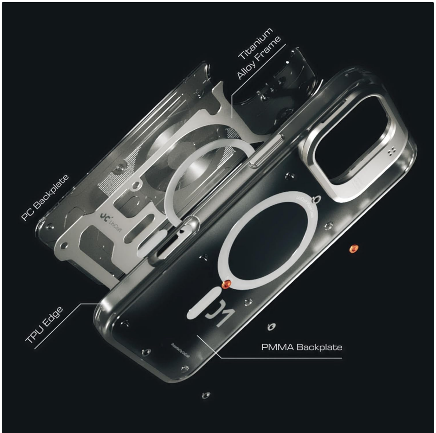
Image 2.1: Exploded view illustrating the multi-material construction of the UniCraft No.01 Case, including Titanium Alloy, PC, TPU, and PMMA layers.