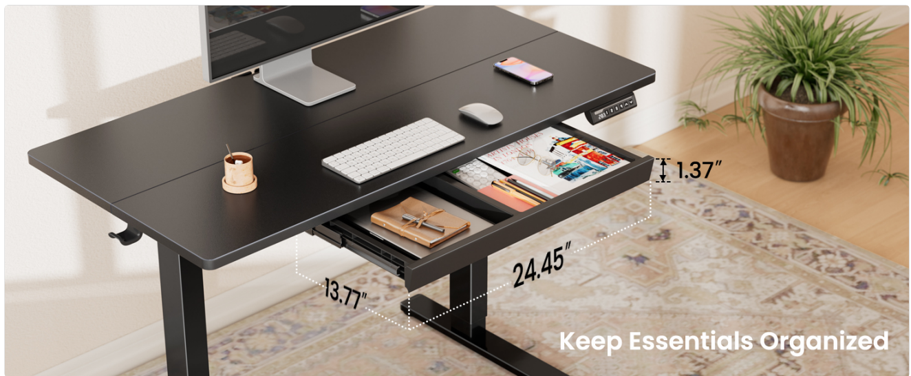
Figure 5: The integrated drawer helps keep your workspace tidy.