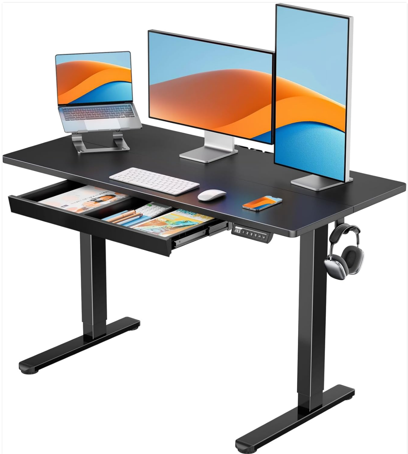
Figure 1: ErGear Electric Standing Desk in a modern office setup.