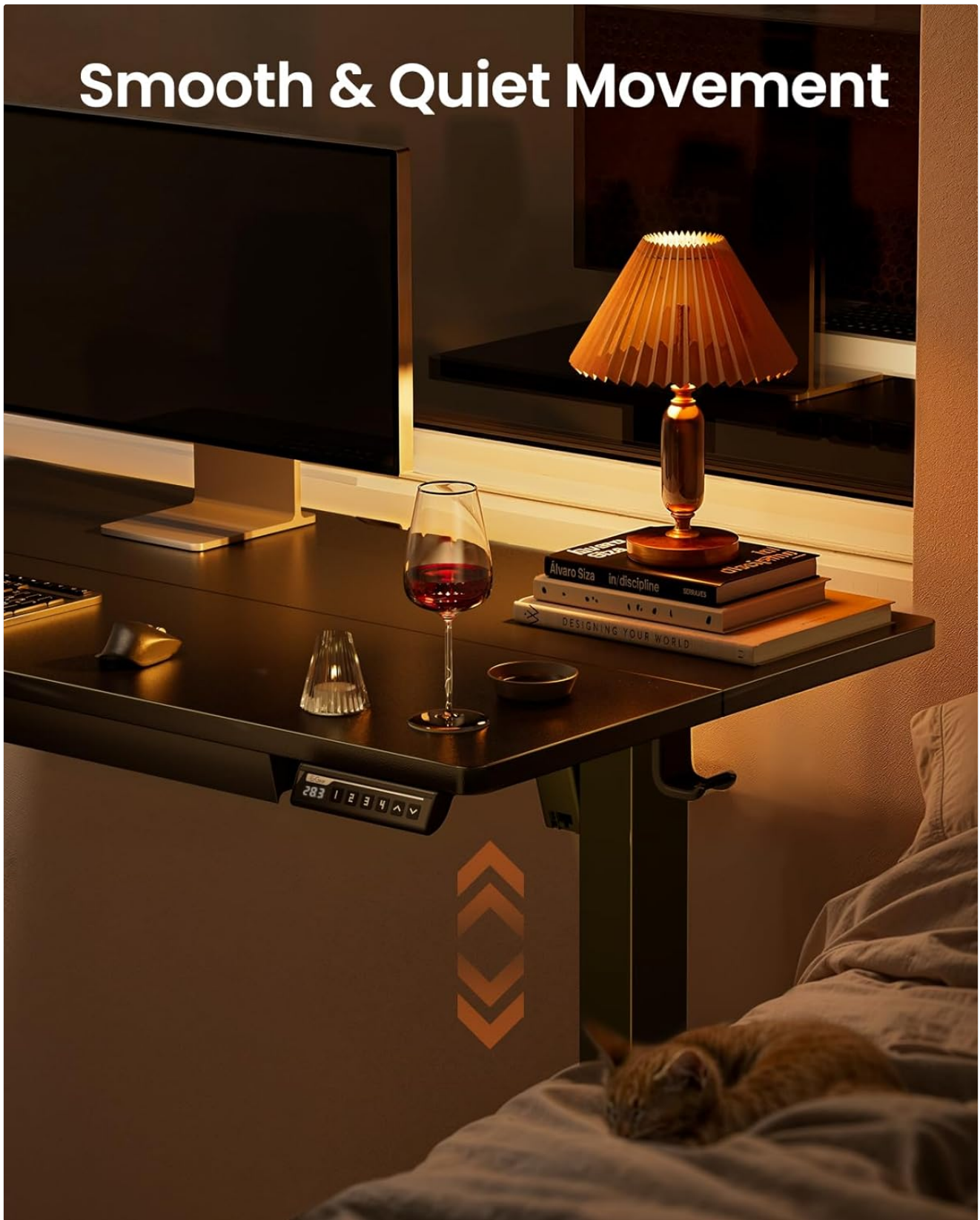
Figure 4: Effortless transition between sitting and standing positions.