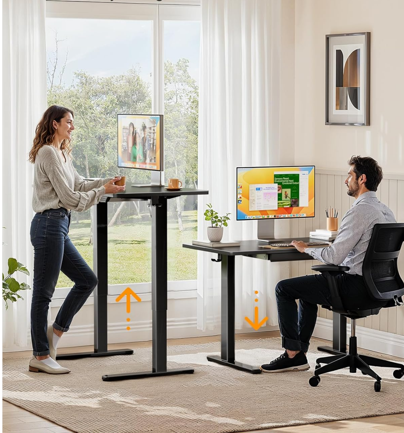
Figure 6: The desk's robust design supports up to 176 lbs.