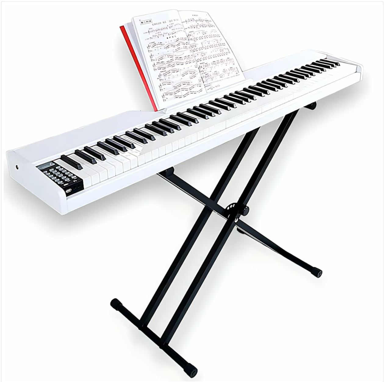
Figure 4.1: Waver WP-140 Digital Piano (stand not included).

The Waver WP-140 is an 88-key digital piano crafted from wood, offering a realistic playing experience with its sensitive, graded hammer-action keys. It features a comprehensive sound library, automatic rhythms, and various connectivity options for enhanced musical versatility.