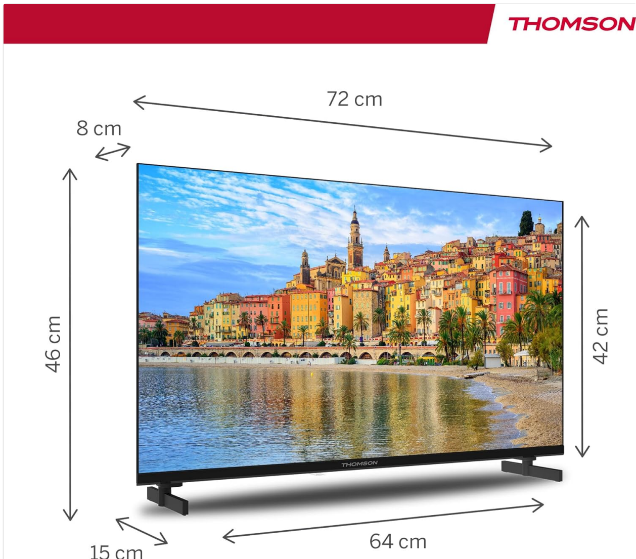
Figure 3.1: Front view of the Thomson 32-inch Full HD Google Smart TV.