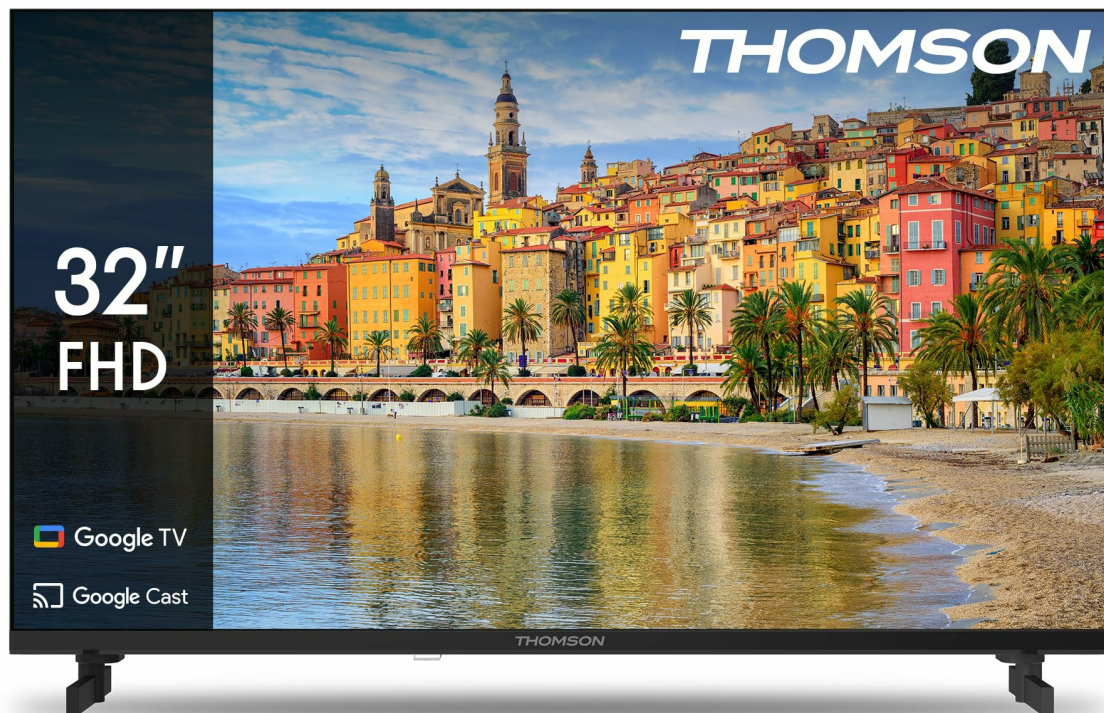
Figure 4.1: TV dimensions and stand placement for the 32-inch model.