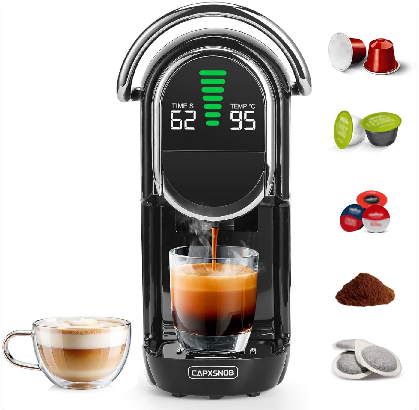
Figure 1: Front view of the Magician1 Mini Coffee Machine with various coffee types it supports.