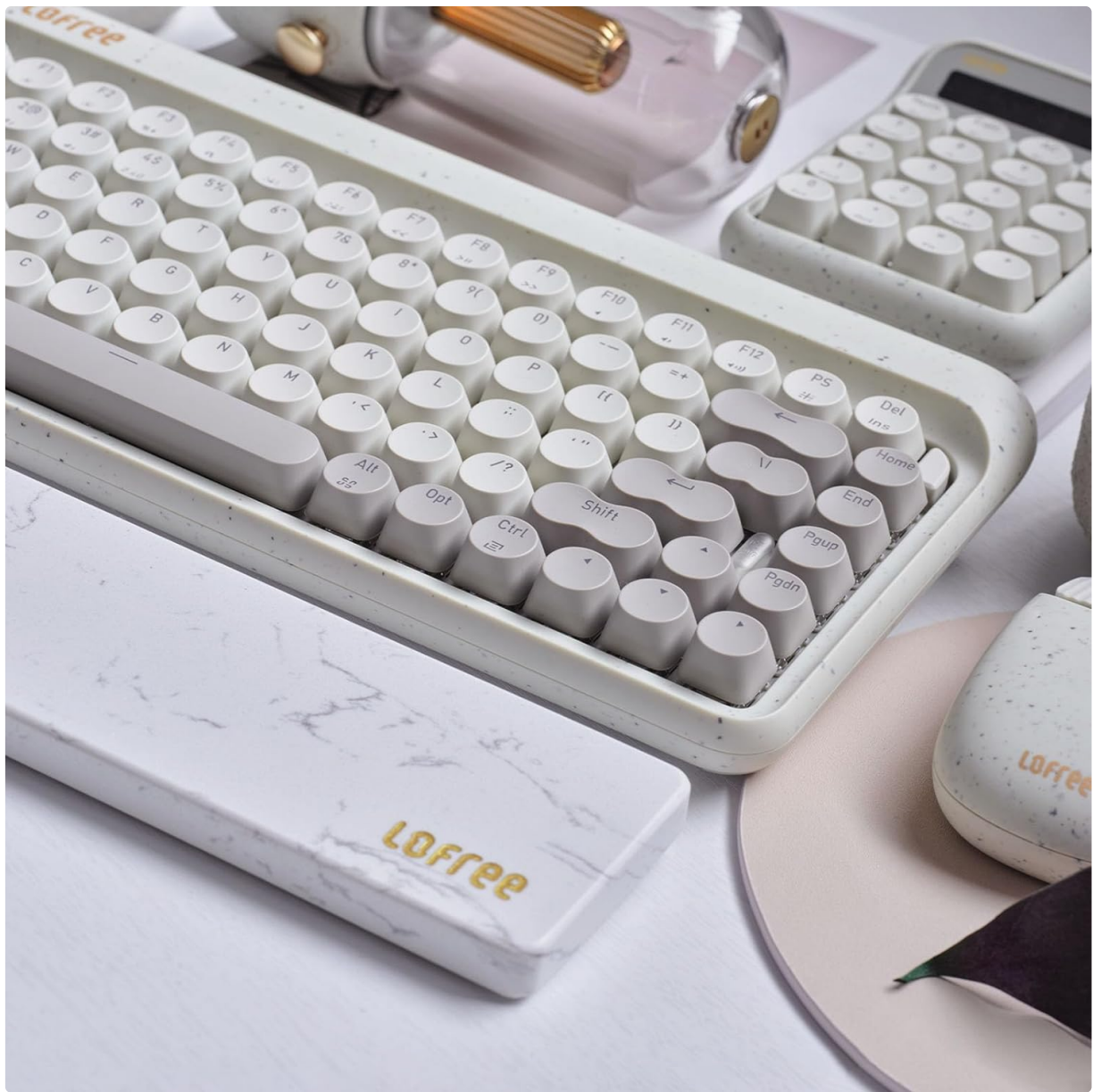
Image: Close-up of the marble palm rest highlighting its natural texture.