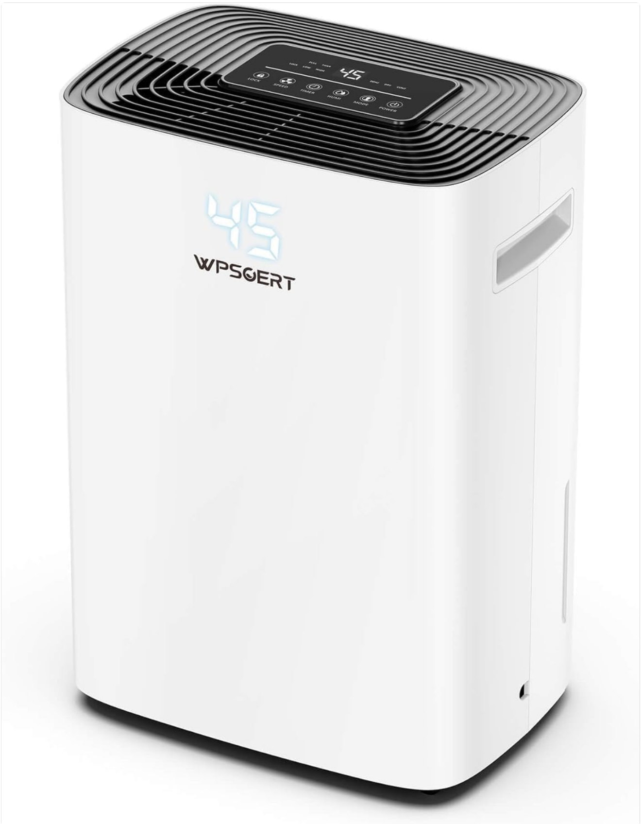
Figure 2.1: Front view of the WPSOERT 80 Pints Dehumidifier (Model WP06).