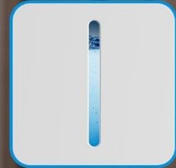
Visual Water Tank