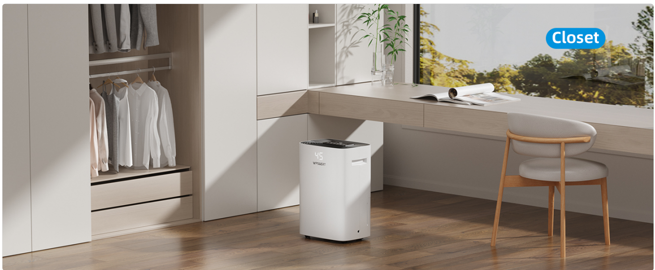
Figure 3.2: Close doors and windows for maximum dehumidification efficiency.