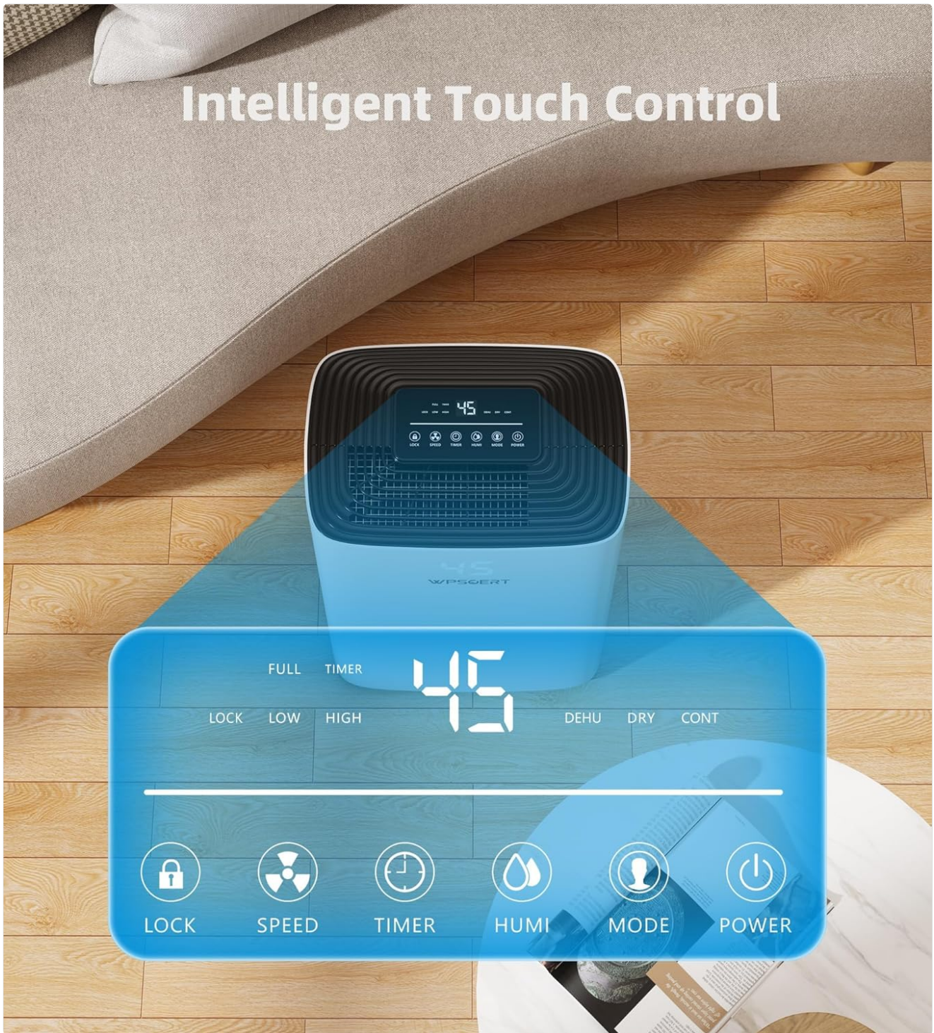
Figure 4.1: Intelligent Touch Control Panel.