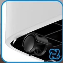
360° Universal Wheels

Stay in tune with humidity and health while embracing a user-friendly design.