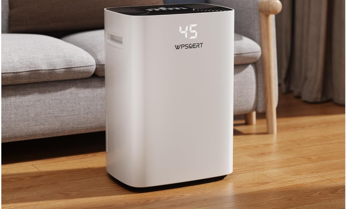
Figure 5.1: Washable Filter (part of Humanized Design features).