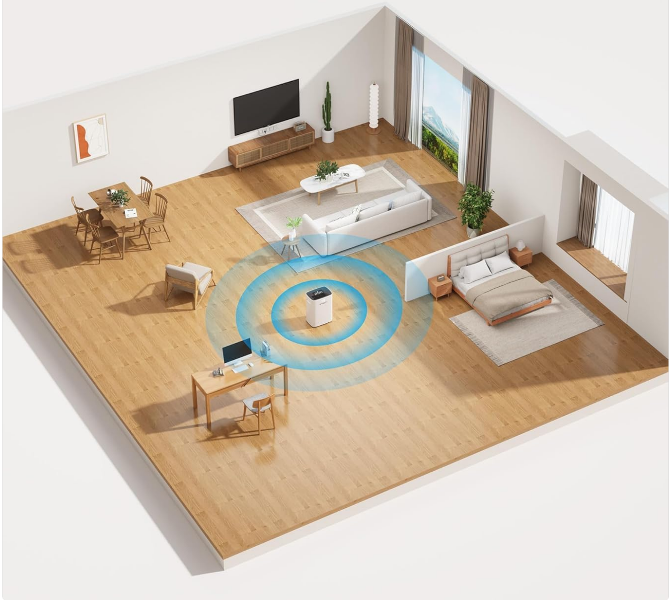
Figure 4.2: Three Working Modes.

80 Pints daily dehumidification capacity in 90°F, 90% RH.