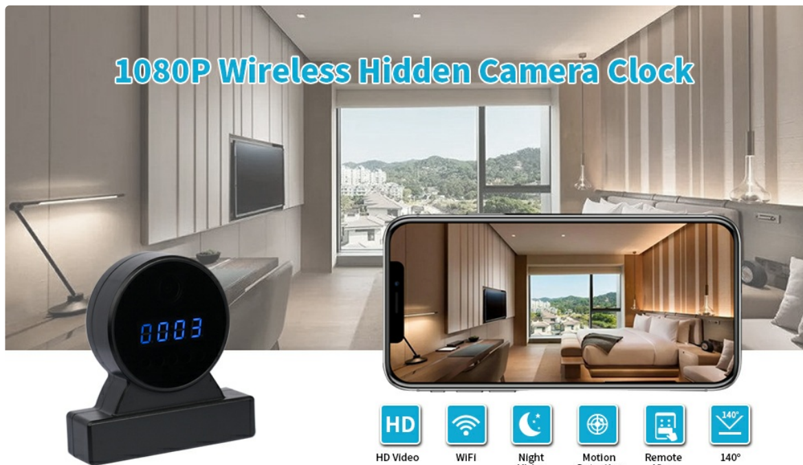
Image: LIBREFLY S36 Full HD 1080P WiFi Camera Clock, showcasing its discreet design and surveillance capabilities.

The LIBREFLY S36 is a discreet Full HD 1080P WiFi Camera Clock designed for wireless security surveillance. It functions as a regular digital clock while secretly capturing high-quality video. Key features include remote access via a dedicated app, smart motion detection alerts, expandable storage, and enhanced night vision.