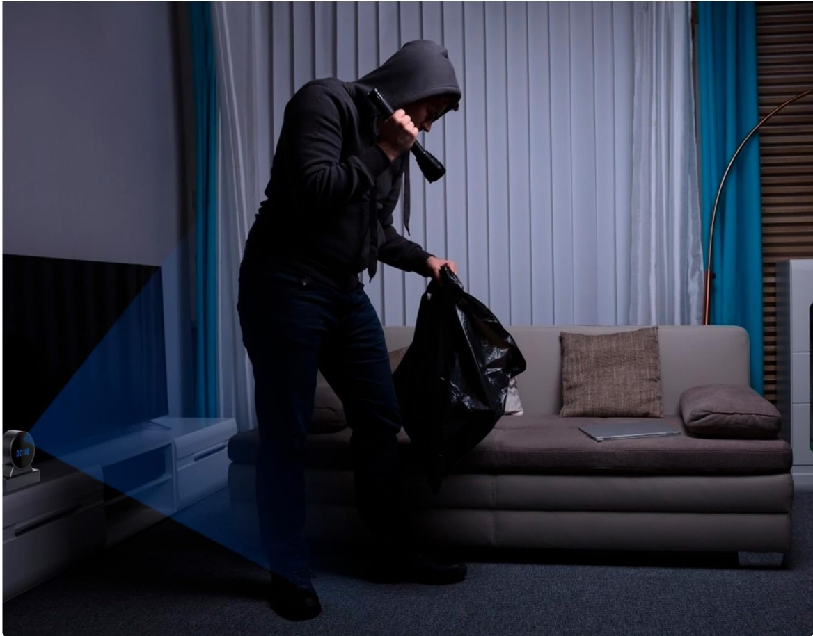
Image: Visual representation of the camera's motion detection alert system.