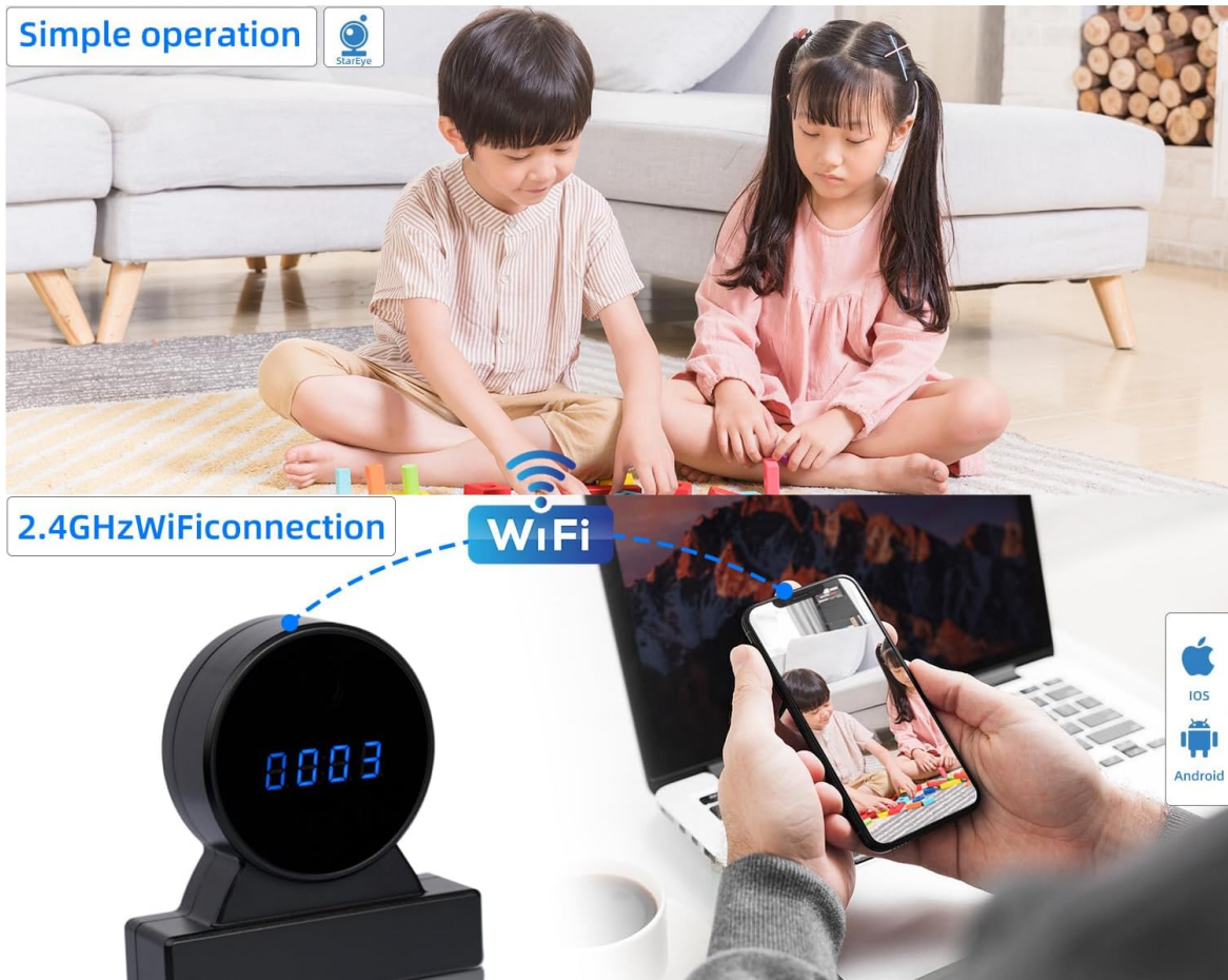
Image: Illustrates the live view functionality of the camera clock through its dedicated mobile application.