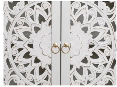
Distressed Carved Floral Design