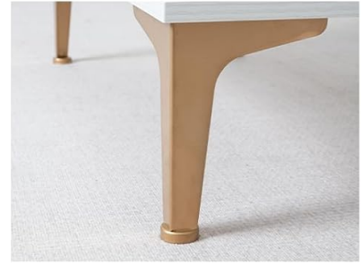
Golden Metal Legs