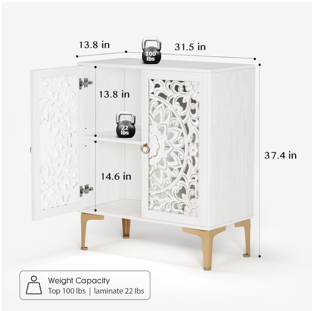
Image 3.1: Overview of cabinet dimensions and weight capacities for the top surface and internal shelf.