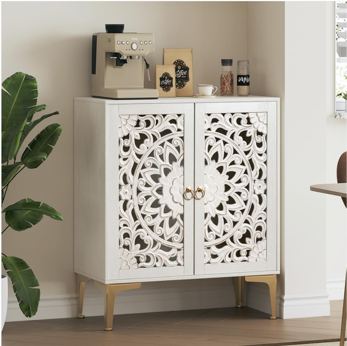
Image 1.1: The JOINICE Accent Cabinet with Doors, featuring its distinctive carved design and gold legs.