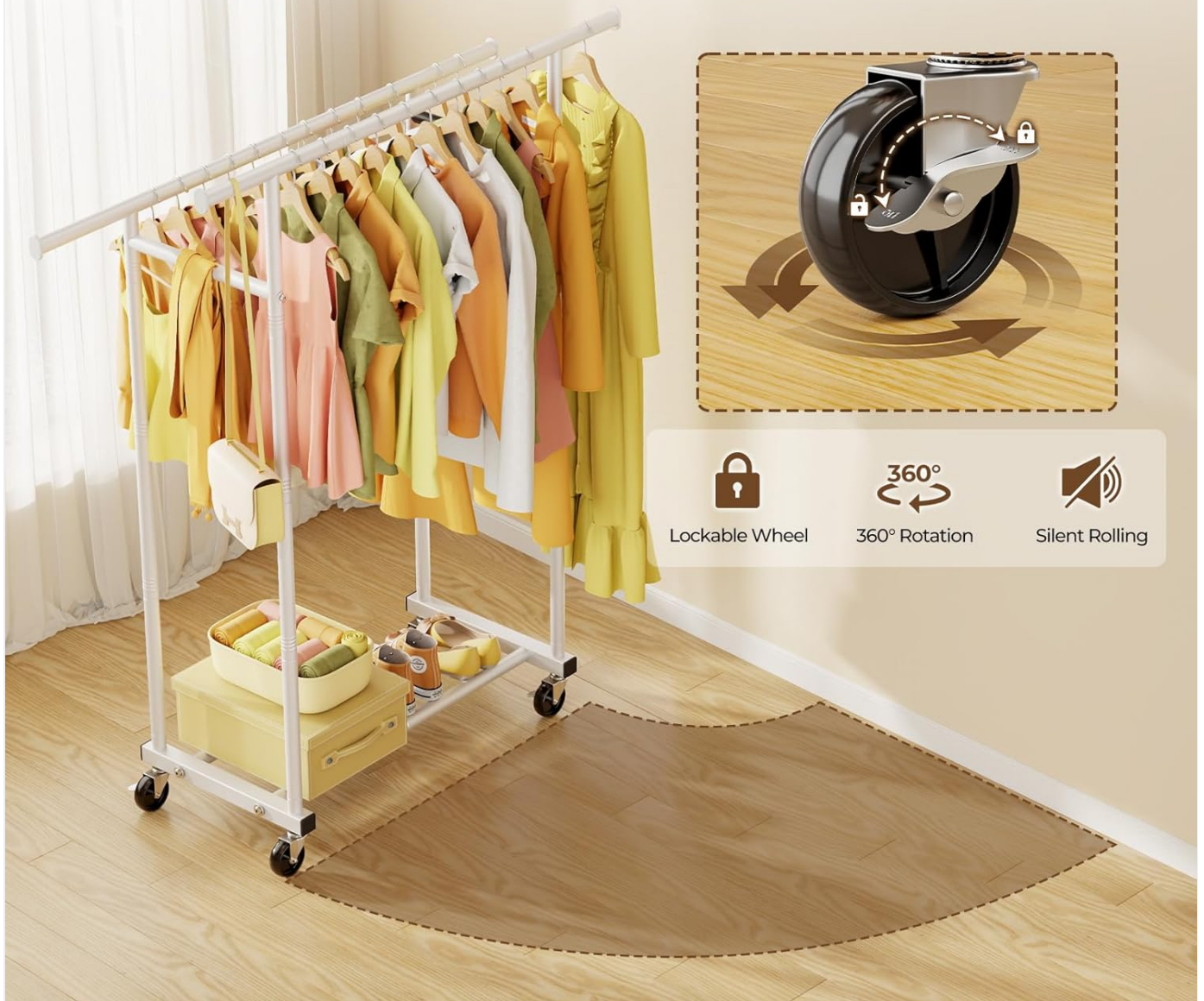
Image: Detail of the 360-degree swivel wheels with a locking mechanism for stability.