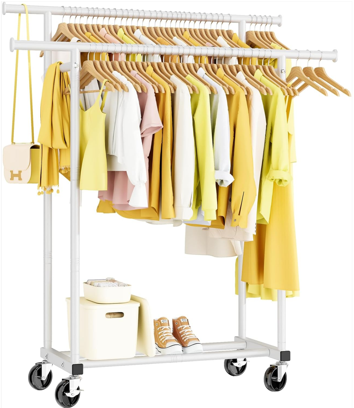
Image: The HYSEYY Double Rods Clothes Rack in white, fully assembled and holding various garments.