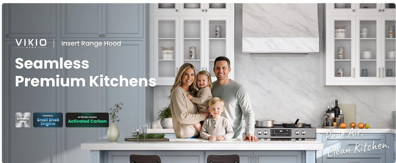
Figure 1: Overview of the VIKIO HOME Range Hood Insert and its main features.