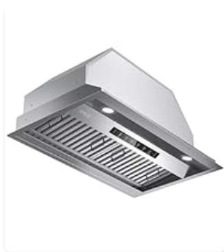
Figure 5: Baffle filters are dishwasher safe and can also be rinsed by hand.

The 3 stainless steel baffle filters are designed to effectively capture cooking grease. They are easily removable and dishwasher safe for convenient cleaning. For manual cleaning, soak them in hot water with soap and rinse thoroughly.