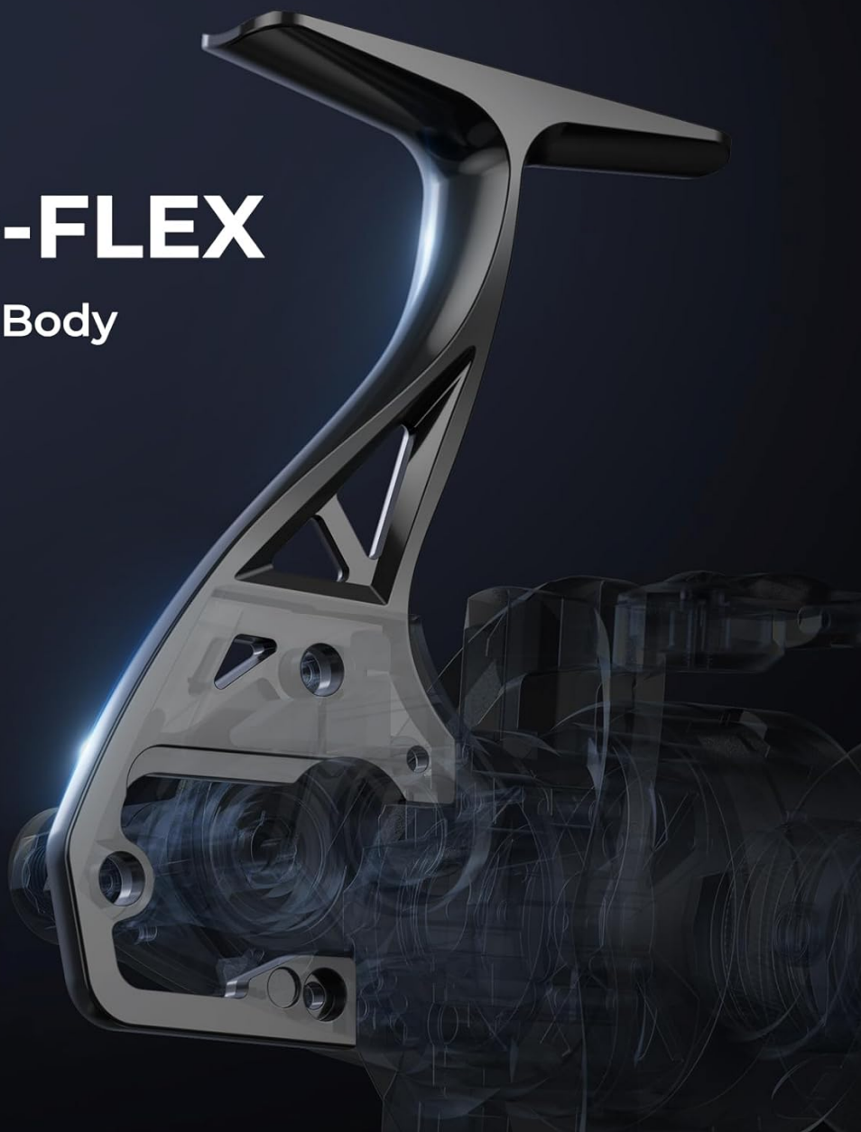
Image: A close-up view of the Megatron reel's Zero-Flex Aluminum Body, highlighting its rigid and durable construction.