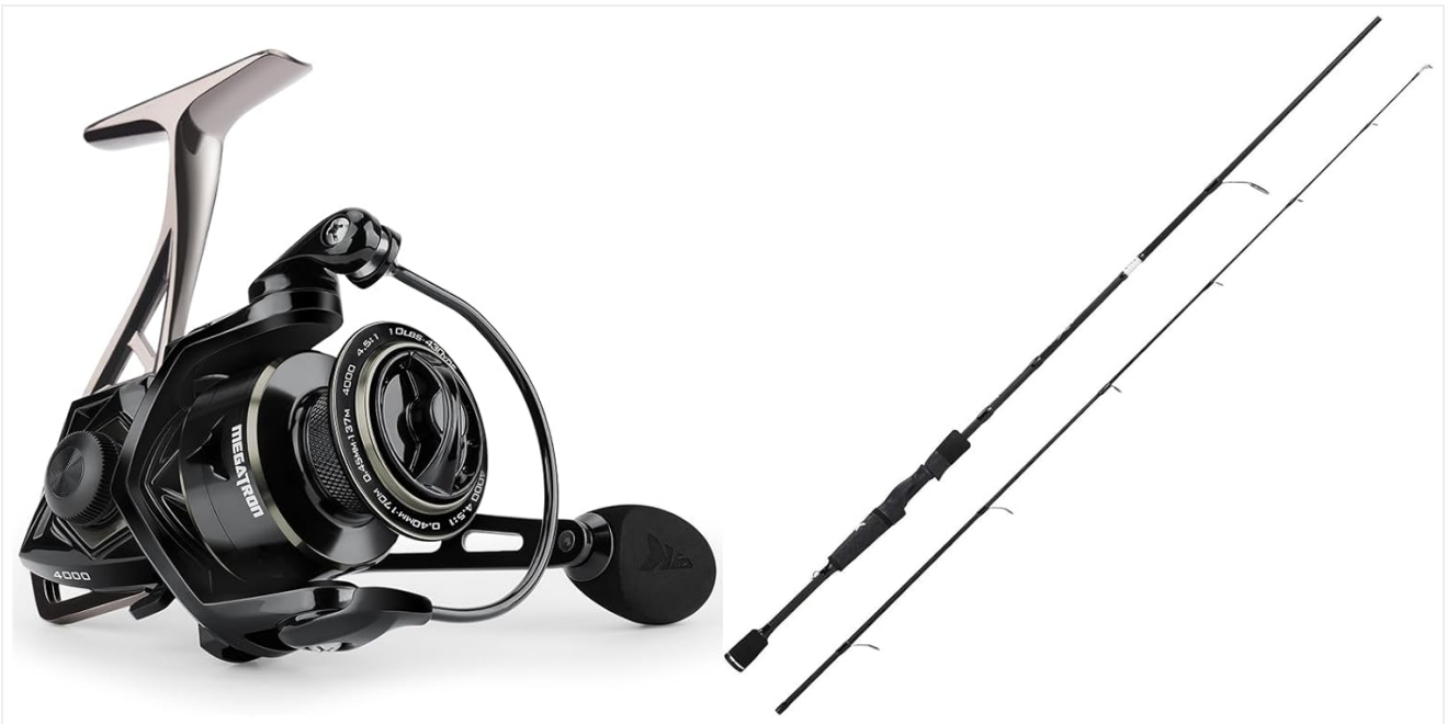
Image: The KastKing Megatron Spinning Reel paired with a KastKing Crixus Fishing Rod, showcasing the complete combo.

Congratulations on your purchase of the KastKing Megatron Spinning Reel and Crixus Fishing Rod Combo. This manual provides essential information for the proper setup, operation, maintenance, and troubleshooting of your new fishing gear. Please read this manual thoroughly before use to ensure optimal performance and longevity of your product.