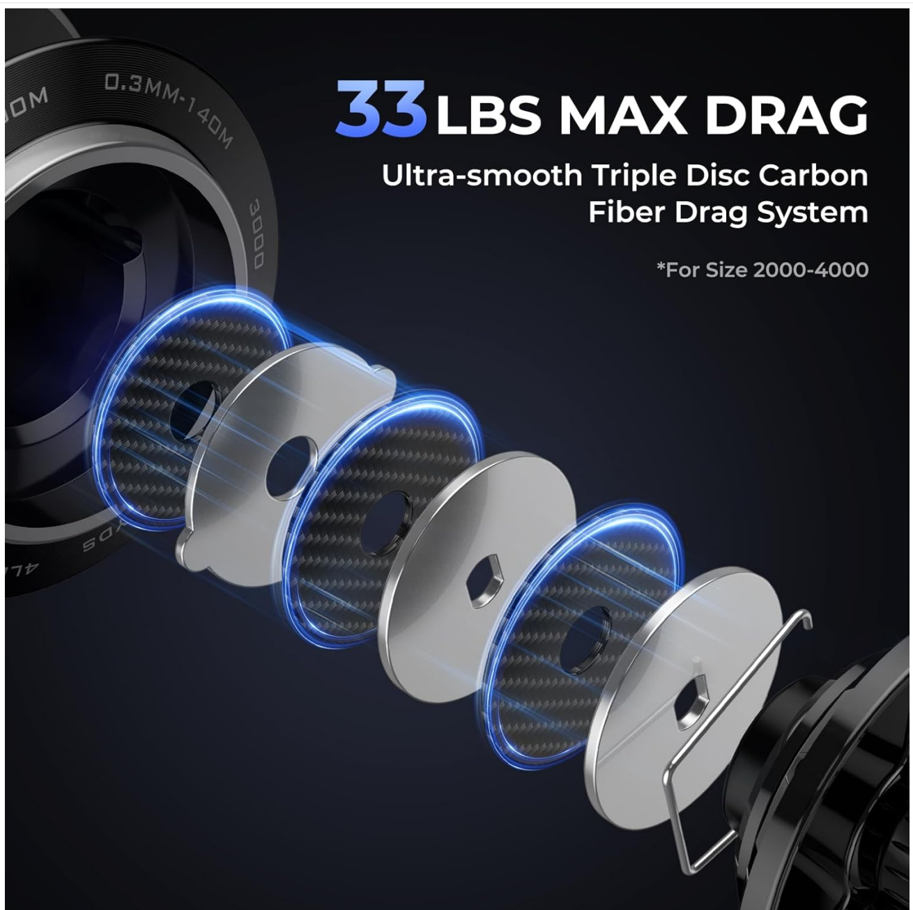
Image: An exploded view illustrating the ultra-smooth triple disc carbon fiber drag system of the Megatron reel, capable of 33 lbs max drag for sizes 2000-4000.