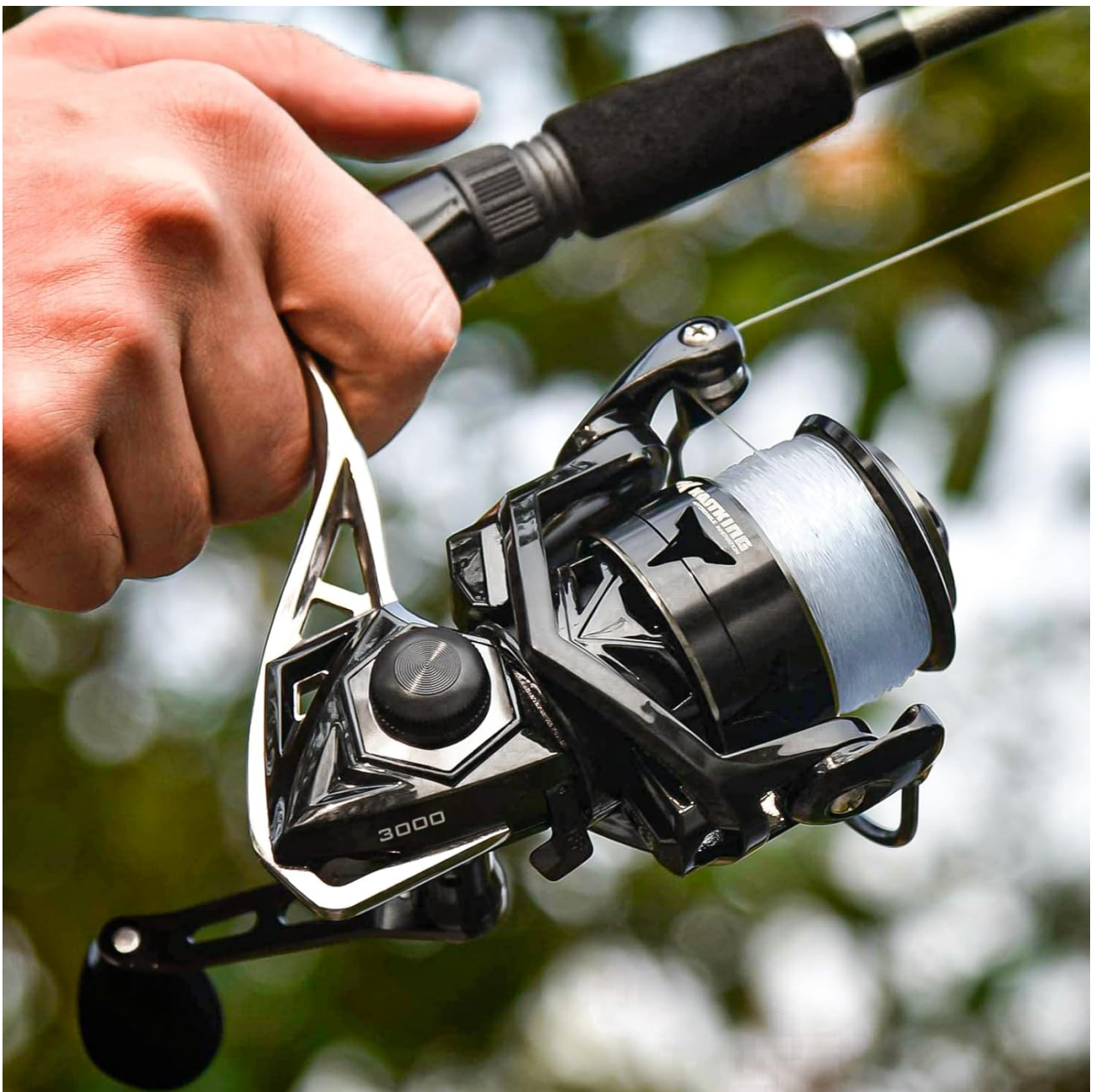
Image: A hand demonstrating the proper grip on the KastKing Megatron spinning reel and rod, illustrating how the reel is mounted and held during use.