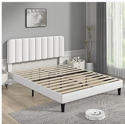
Illustration of the metal frame and wood slat support system.

Refer to the following images for visual guidance during assembly: