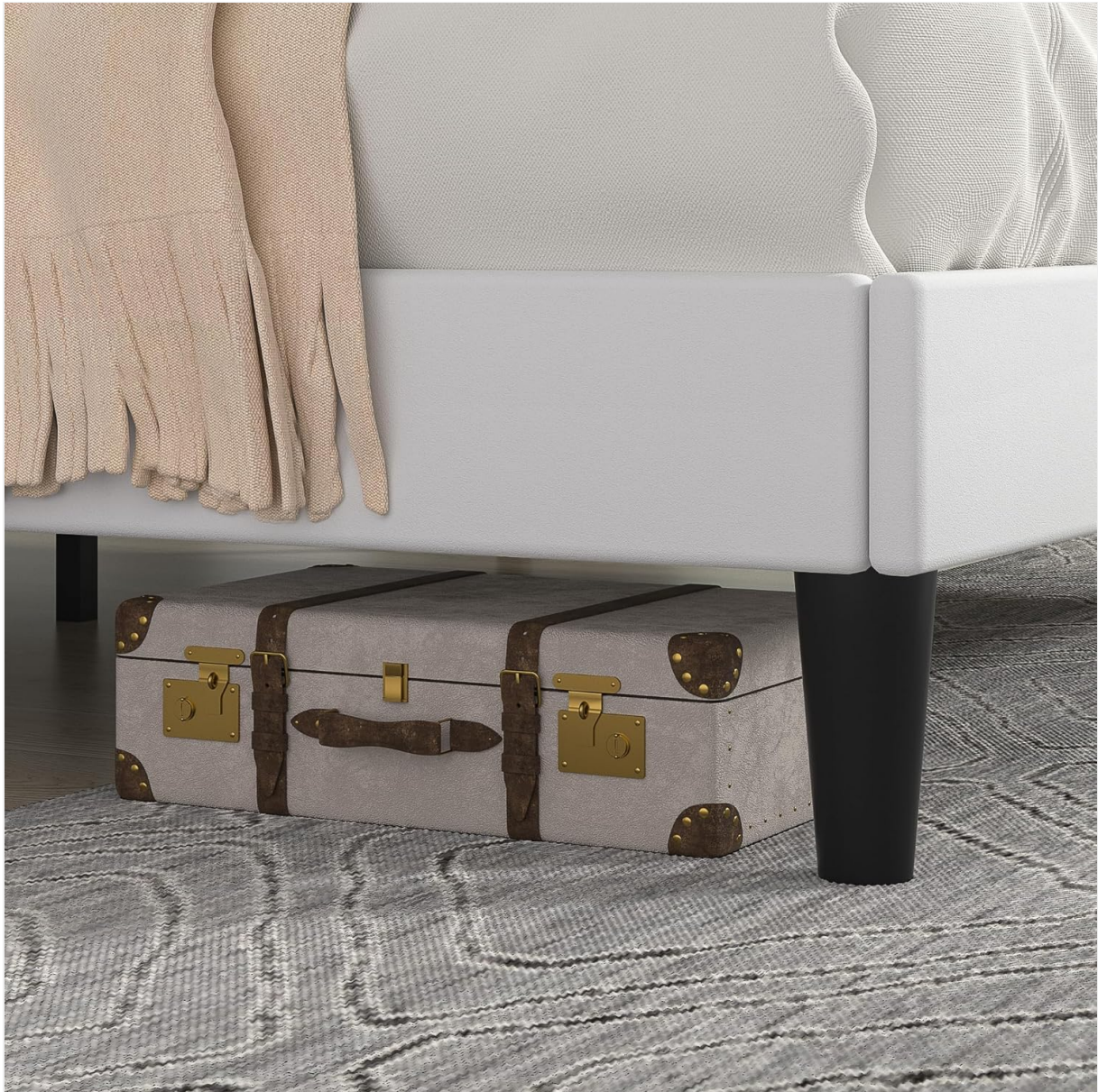
Image illustrating the available space under the bed frame, suitable for storing items like suitcases.

The bed frame offers 7.87 inches of ground clearance, providing convenient under-bed storage space. The image below shows an example of utilizing this space: