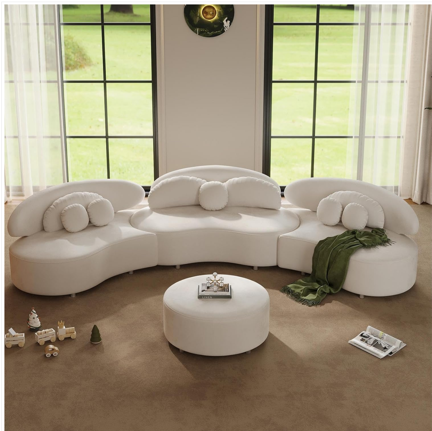
Image: Overview of the Homary 7-Seat Curved Modular Sectional Sofa with included ottoman and pillows.