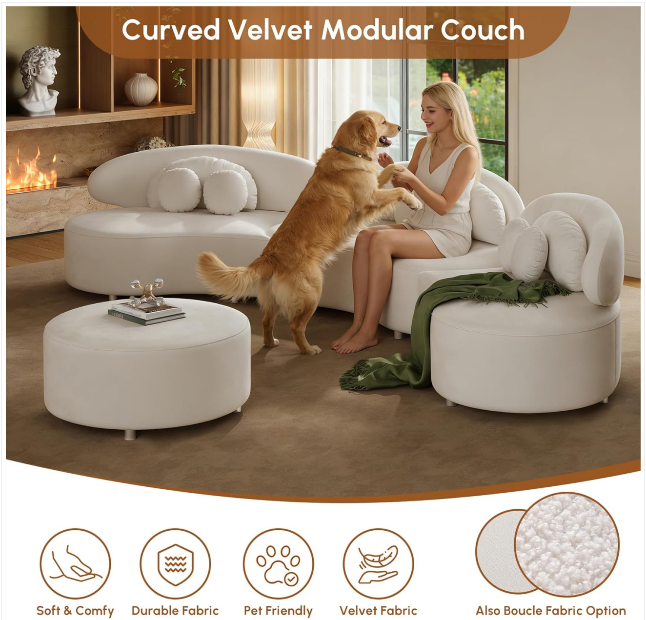
Image: Example of modular sections arranged with the ottoman.