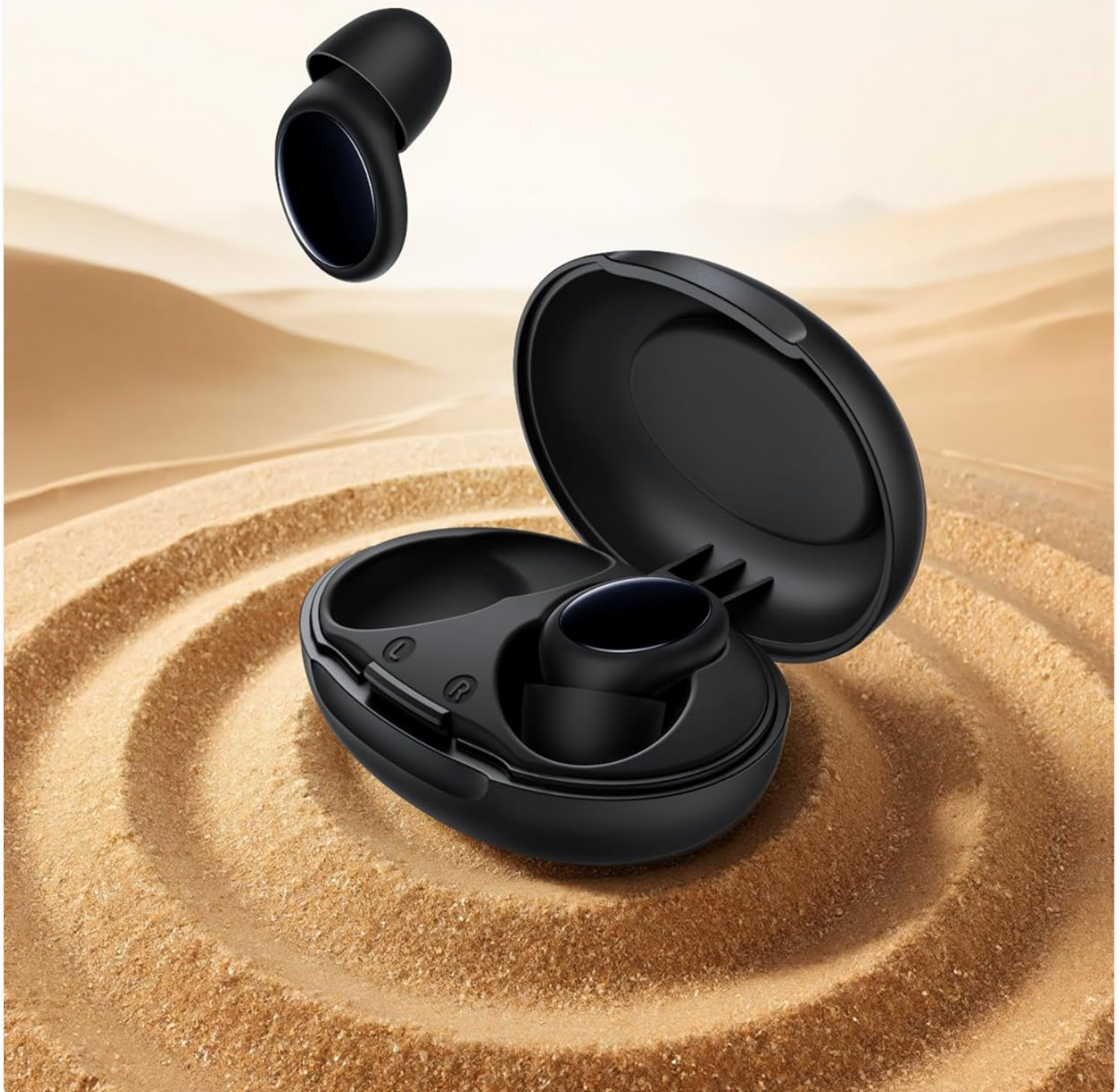
Image: The TOAPEX Q8 Ear Plugs and their compact carrying case are displayed on a sandy, desert-like background, highlighting their ultra-mini and portable design for travel and daily use.

Easy to carry, perfect for travel and daily use.