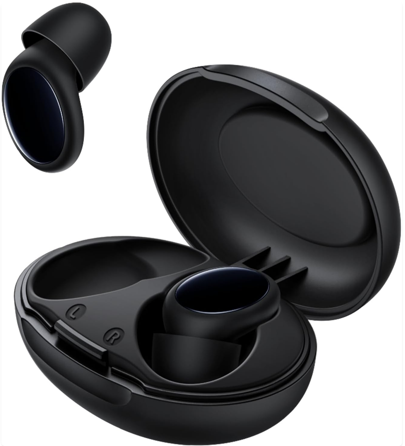
Image: The TOAPEX Q8 Ear Plugs shown with their sleek, black, oval-shaped carrying case. One earplug is visible outside the case, highlighting its compact design.