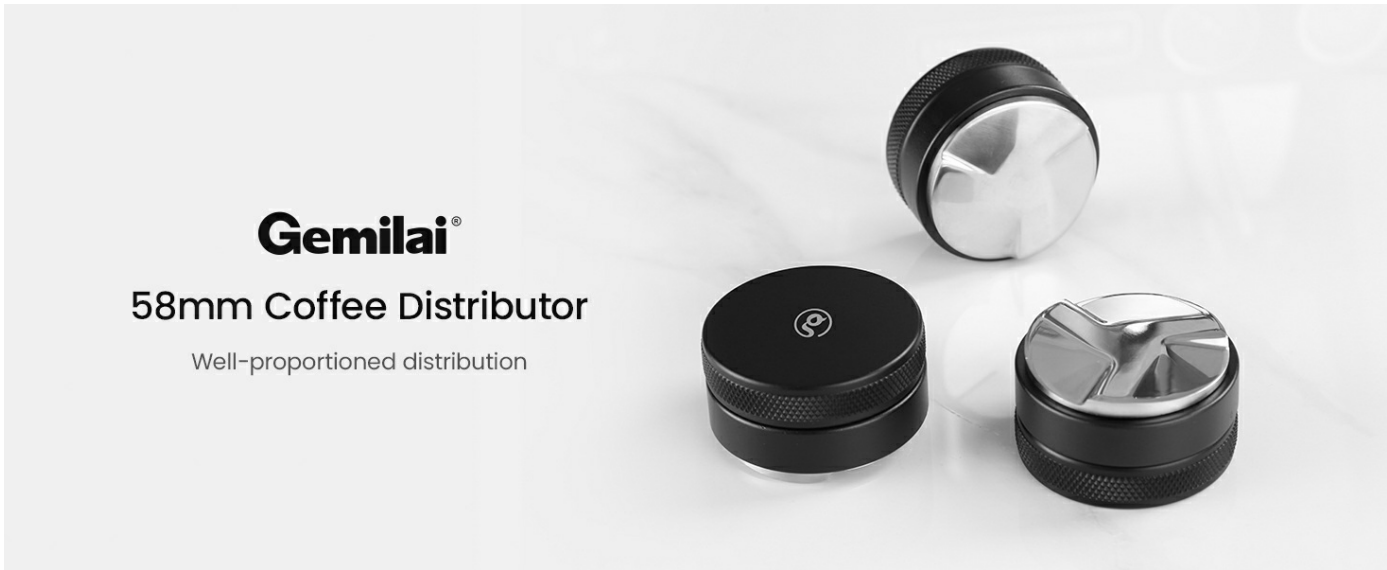
Image: Gemilai 58mm Coffee Distributor, illustrating its design and purpose for well-proportioned coffee distribution.

The Gemilai 58mm Coffee Distributor is a professional tool designed to ensure uniform distribution of coffee grounds in a 58mm portafilter. This adjustable depth tool features a durable 304 stainless steel construction and an ergonomic handle, contributing to consistent espresso extraction and improved flavor.