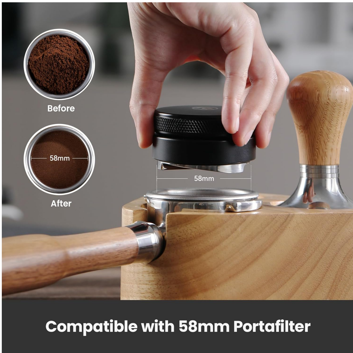
Image: A comparison showing coffee grounds before and after using the 58mm distributor, demonstrating uniform leveling.