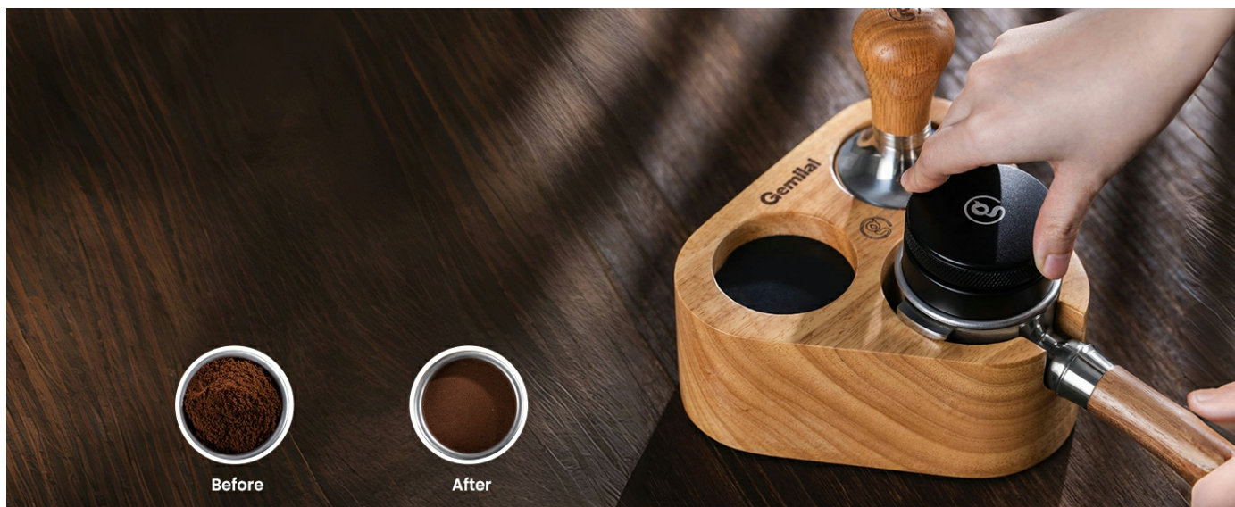
Image: A visual guide demonstrating the three steps to adjust the depth of the coffee distributor.