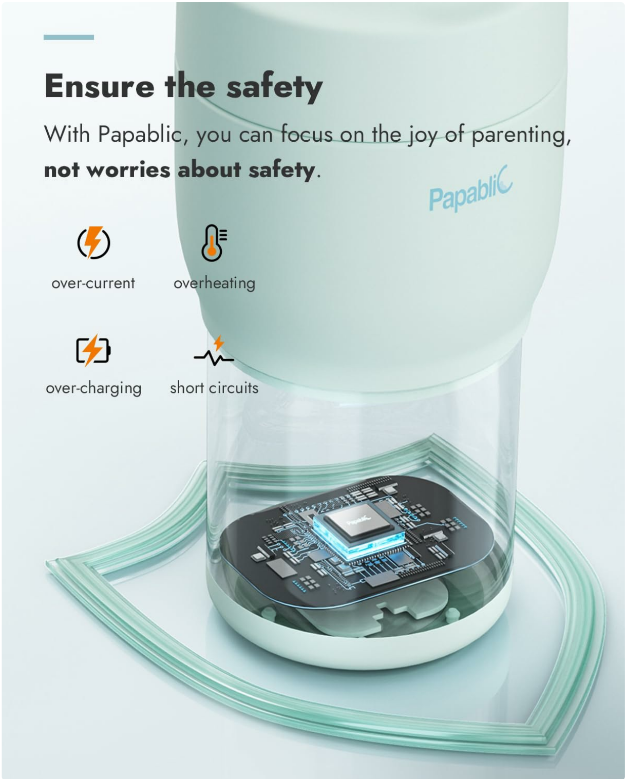
Image: A visual representation of the internal circuitry of the Papablic Pro, emphasizing its built-in safety protections against electrical issues.