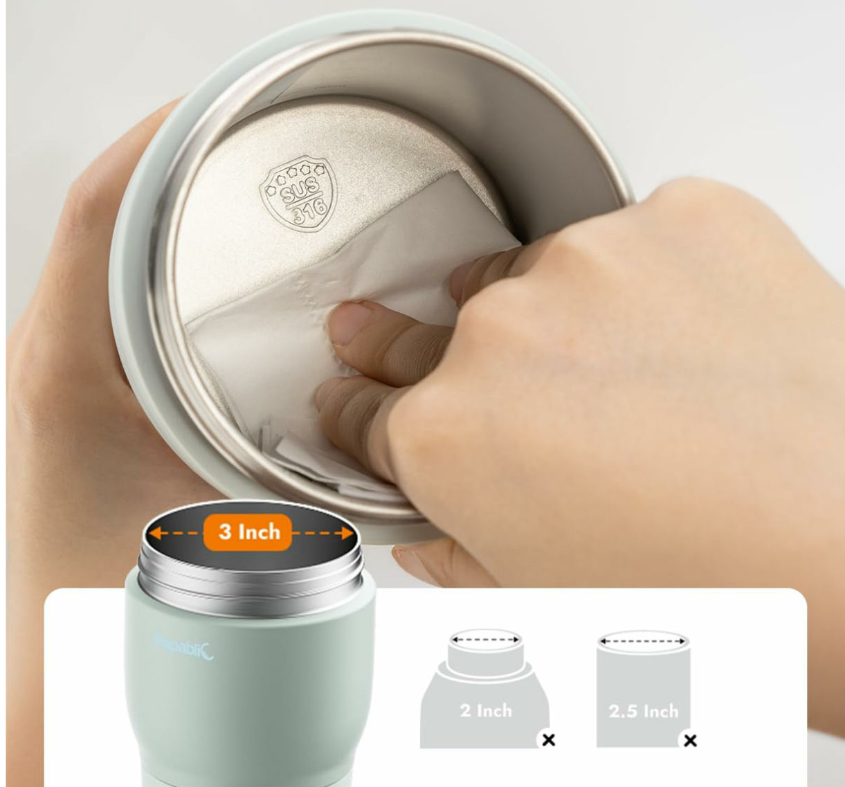
Image: A hand reaching into the wide mouth of the Papablic Pro to wipe the interior, demonstrating the ease of cleaning.

3-inch wide-mouth design allows easy hand access for wiping and cleaning