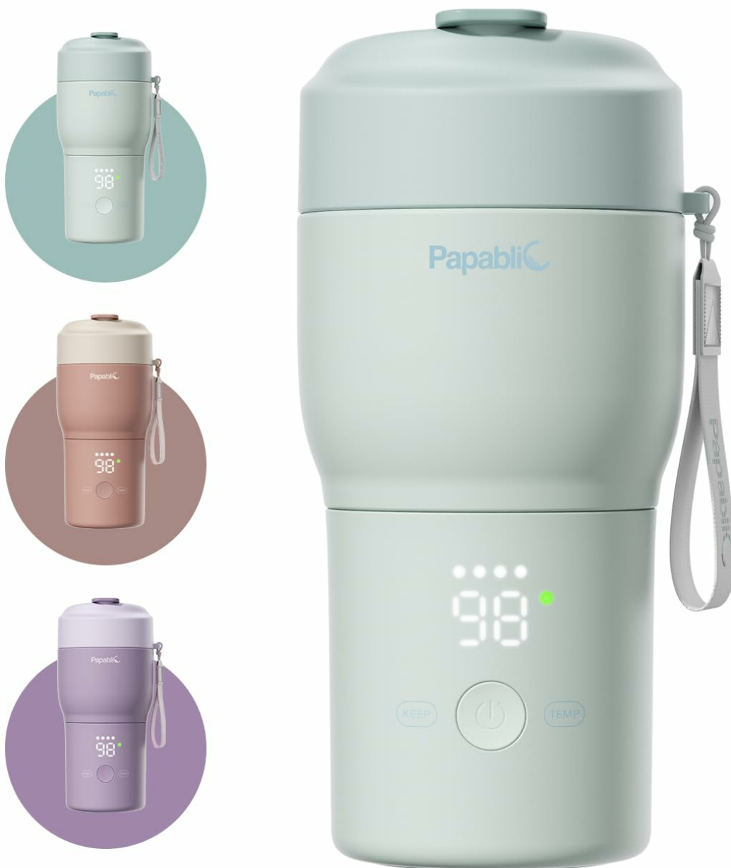
Image: The Papablic Pro Portable Bottle Warmer in mint green, showcasing its sleek design and digital display.