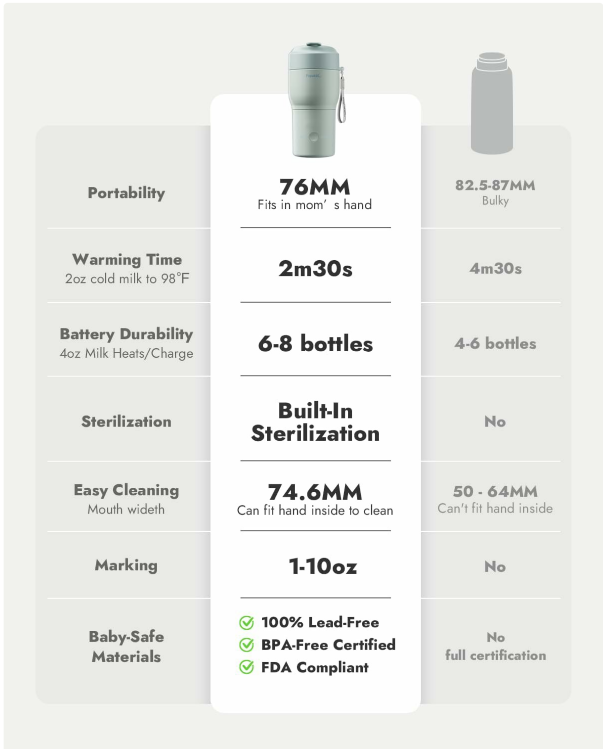
Image: A detailed comparison table highlighting key specifications and advantages of the Papablic Pro Portable Bottle Warmer against other models.