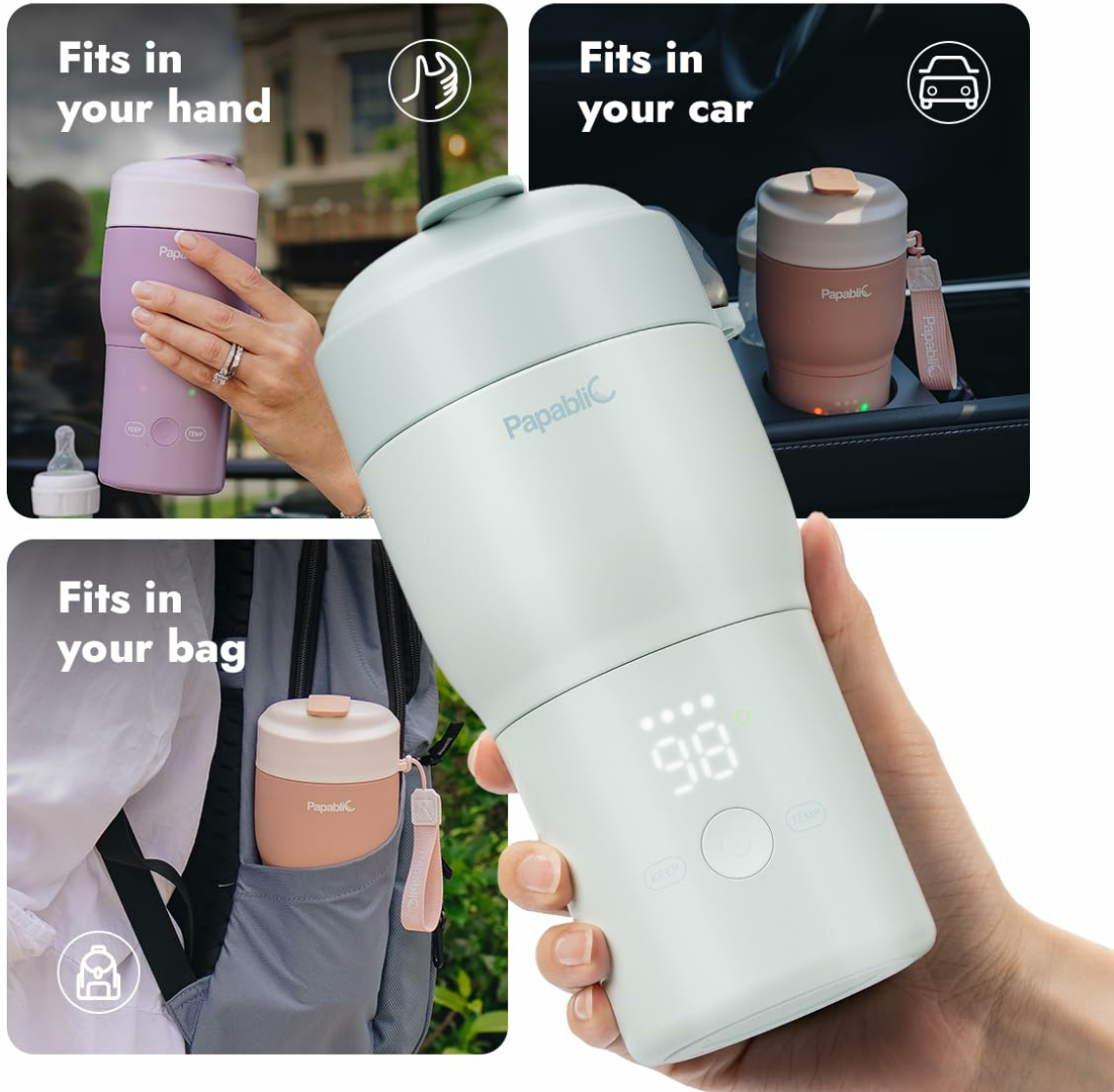
Image: Multiple views of the Papablic Pro, demonstrating how it fits easily in a hand, car cup holder, and a bag, emphasizing its ultra-portable design.

Slim body design fits comfortably in your hand, car, bags and anywhere you go