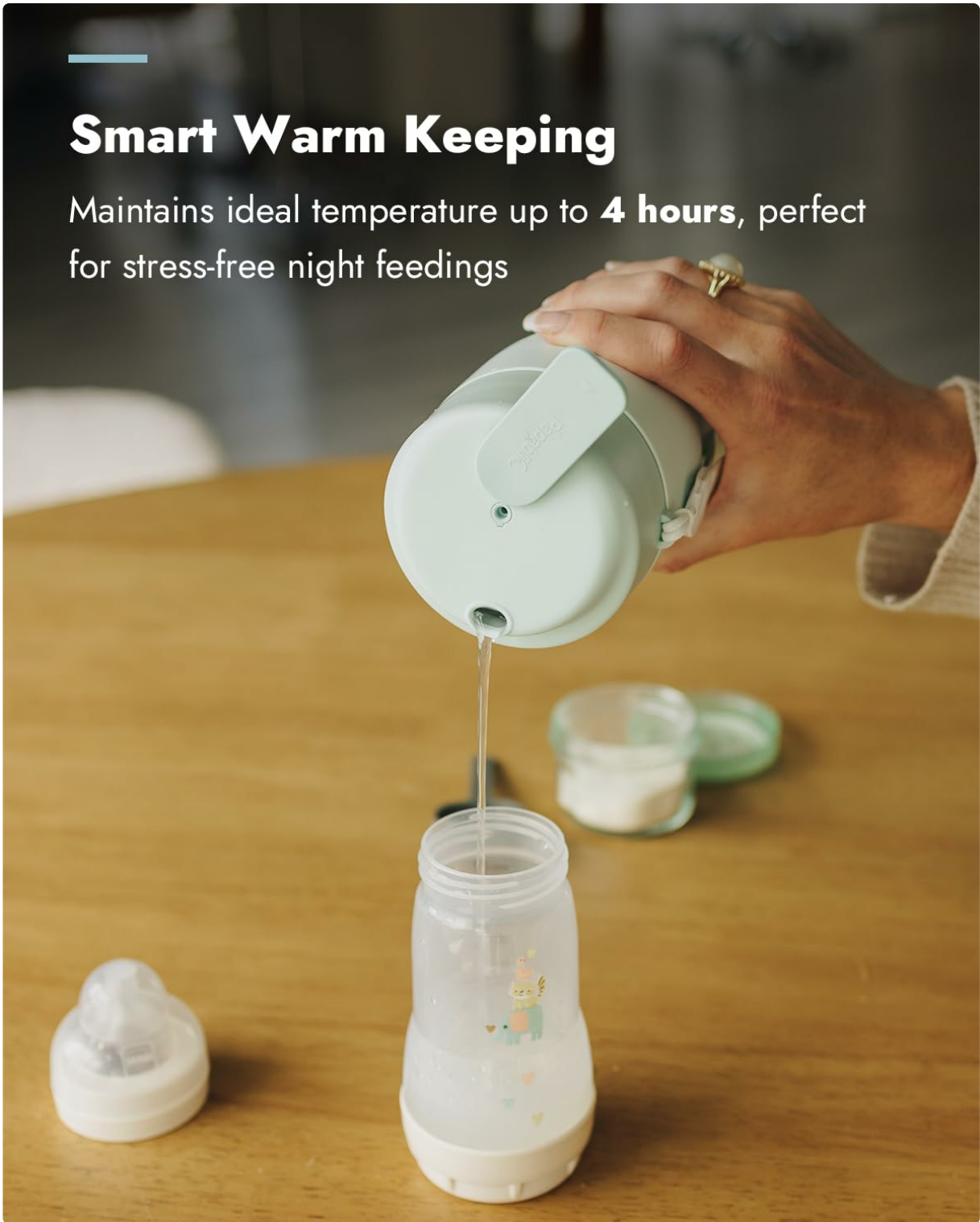
Image: A hand pouring warmed milk from the Papablic Pro into a baby bottle, highlighting the convenience of the smart warm-keeping feature for night feedings.

Maintains ideal temperature up to 4 hours , perfect for stress-free night feedings