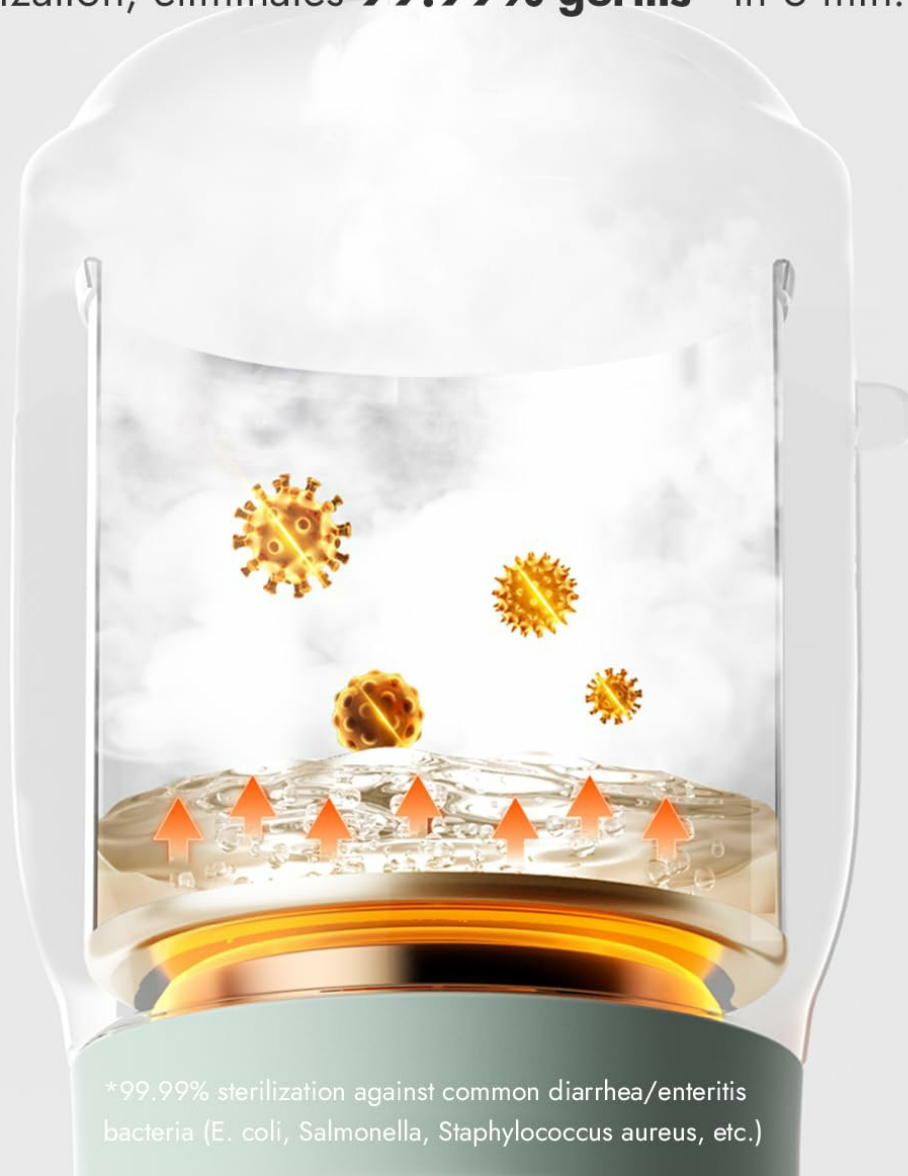
Image: A cutaway view of the Papapublic Pro, illustrating the steam sterilization process within the warming chamber.

The world's FIRST portable milk warmer with built-in sterilization, eliminates 99.99% germs* in 6 min.