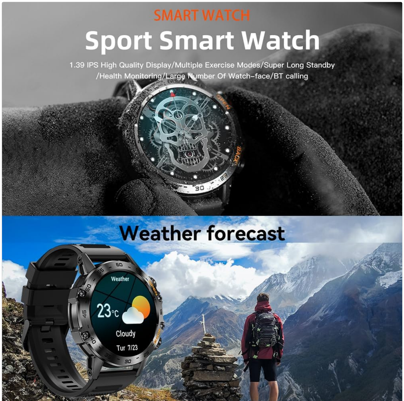
Figure 6: Sport Smart Watch and Weather Forecast. This image highlights the watch's sports tracking capabilities and its ability to display current weather conditions.