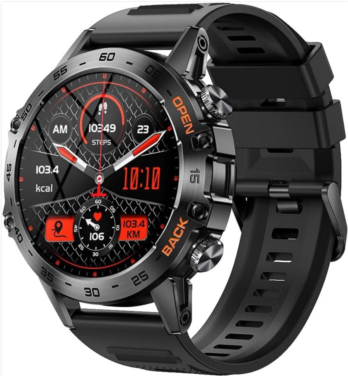
Figure 1: Karlak K52 Smart Watch. This image shows the watch face with various health metrics and time displayed, highlighting its sleek design.