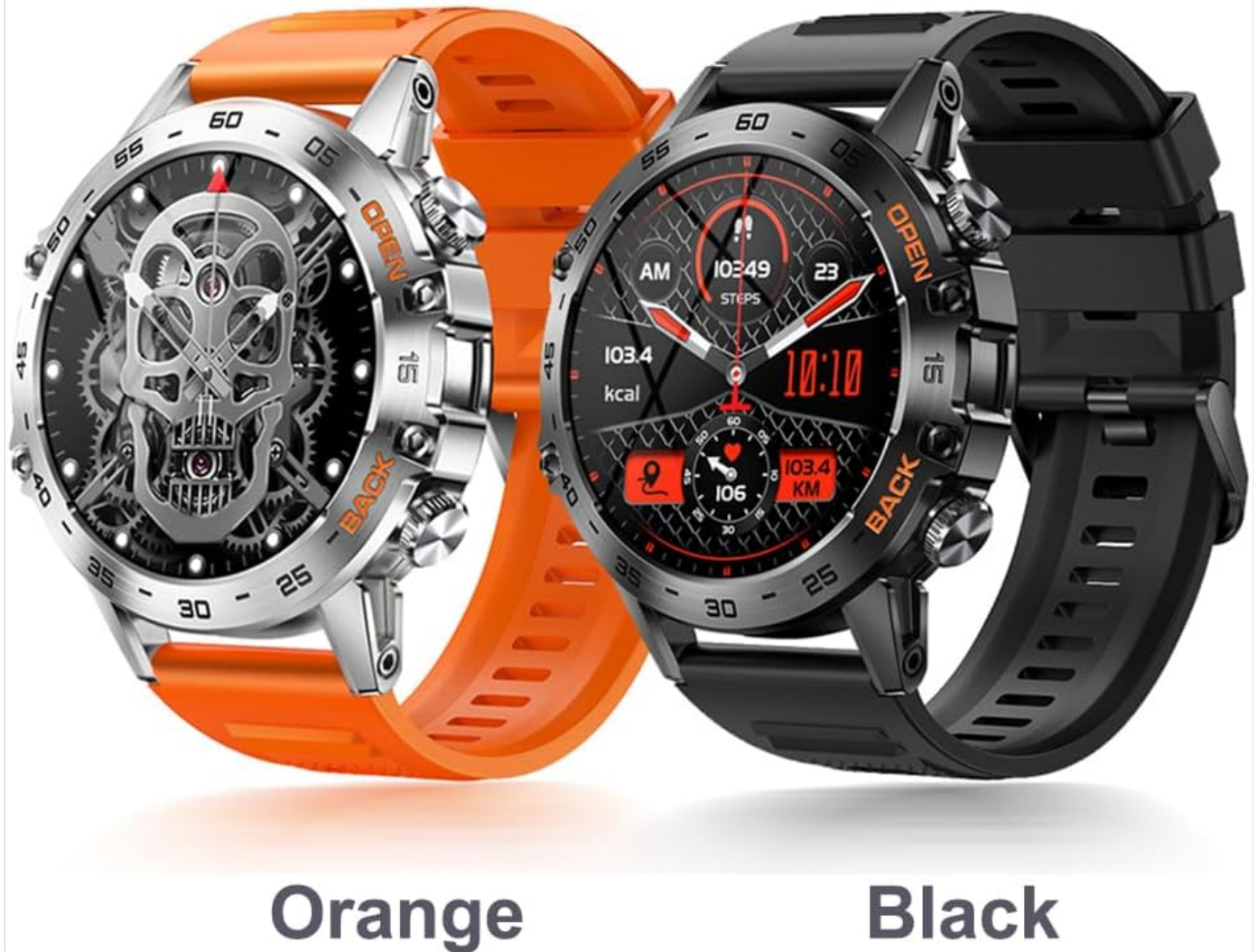
Figure 8: Available Color Options. This image displays the K52 Smart Watch in both Orange and Black variants.