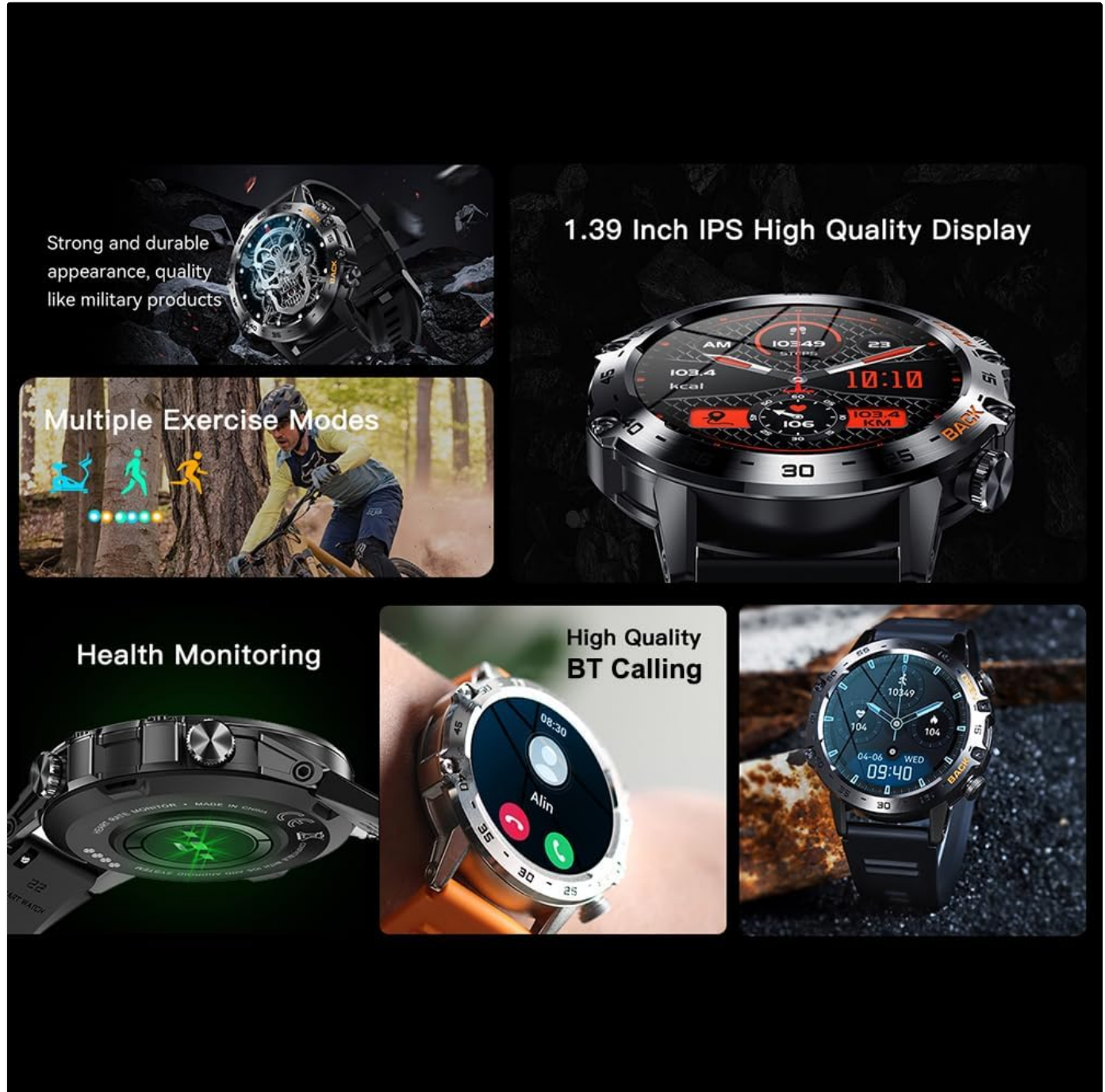
Figure 3: Key Features Overview. This image highlights the watch's display quality, various exercise modes, health monitoring capabilities, and Bluetooth calling function.