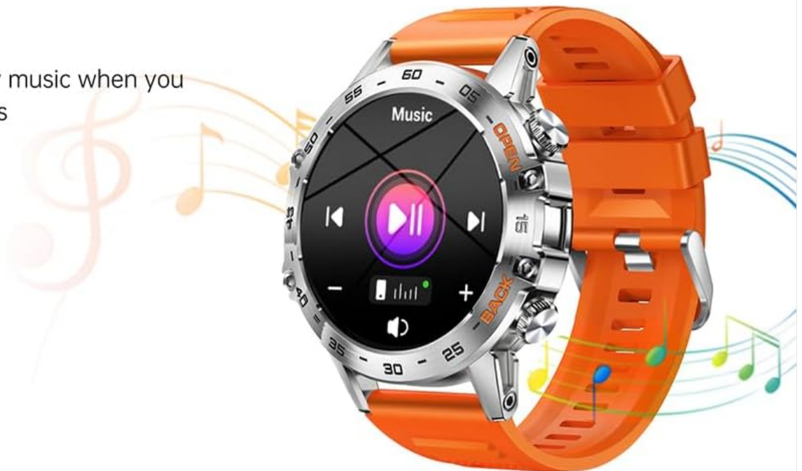
Figure 2: Battery Charging and Music Playback. This image illustrates the watch's charging indicator and its capability to control music.

Watch can play music when you are doing sports