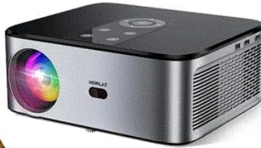
Image: A detailed view of the projector's side panel, highlighting the available input/output ports for connecting various devices.