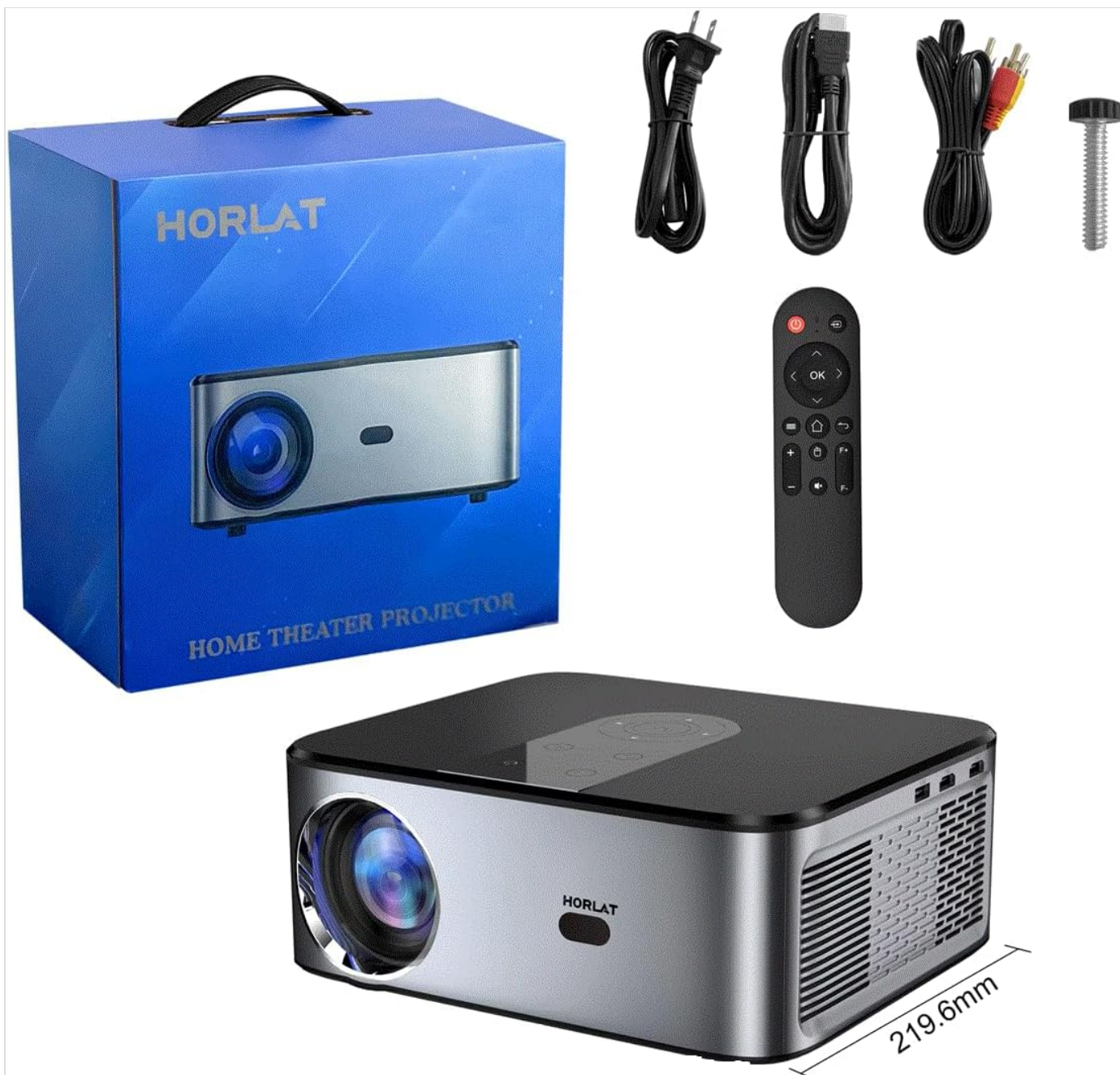
Image: The projector and its included accessories, such as the remote control, power cord, HDMI cable, AV cable, and user manual.