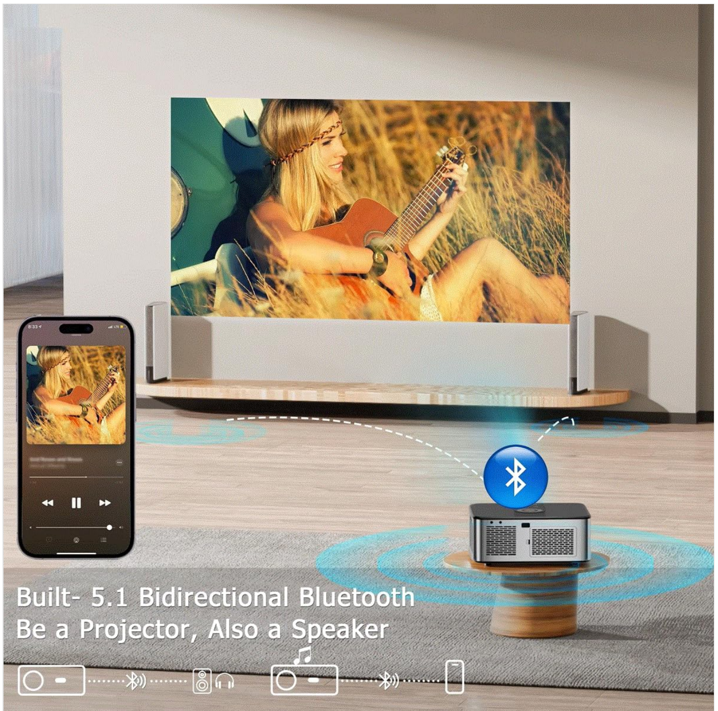
Image: Demonstrates the projector's Bluetooth 5.1 capabilities, allowing connection to smartphones and external speakers for versatile audio output.