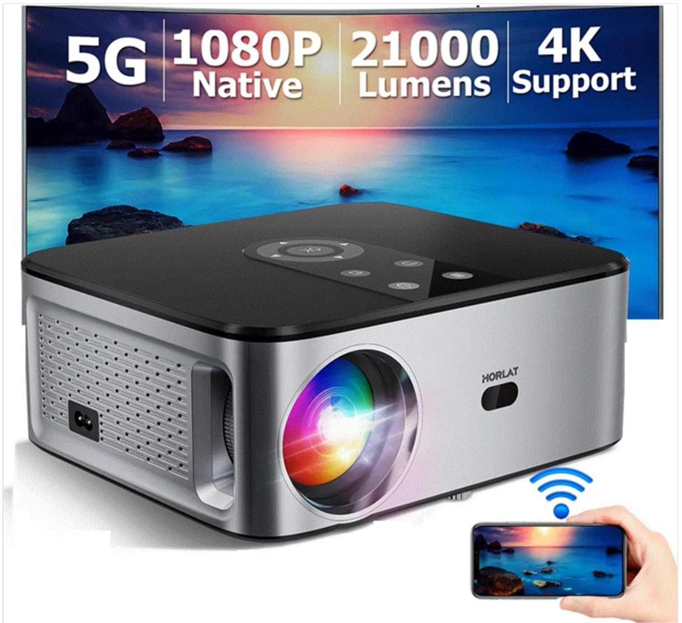
Image: Front view of the 4K LED Android Projector, highlighting its key features like 5G connectivity, 1080P native resolution, 21000 lumens brightness, and 4K support.