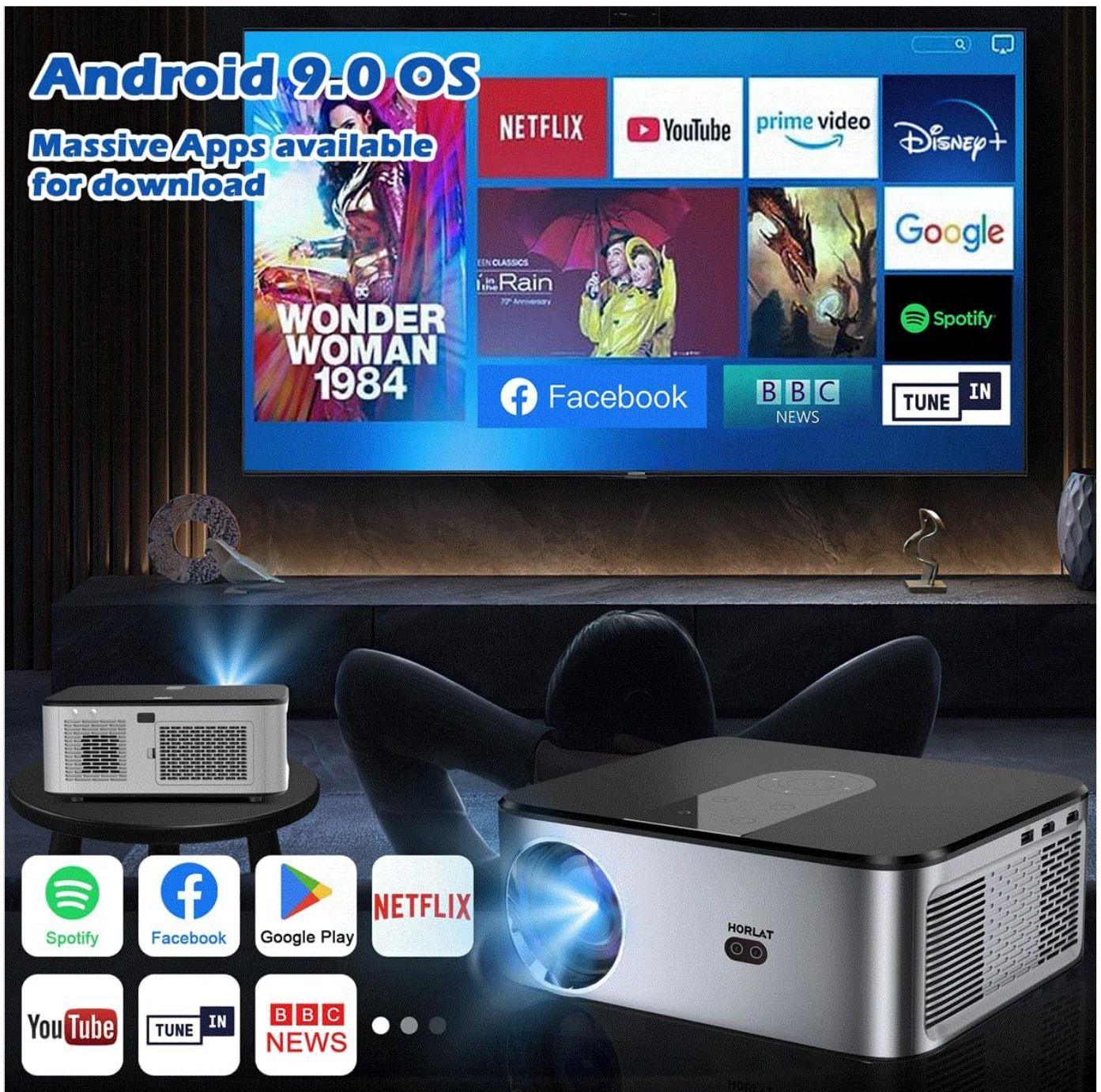
Image: The projector screen showing the Android 9.0 operating system with pre-installed and downloadable applications, providing a smart TV experience.