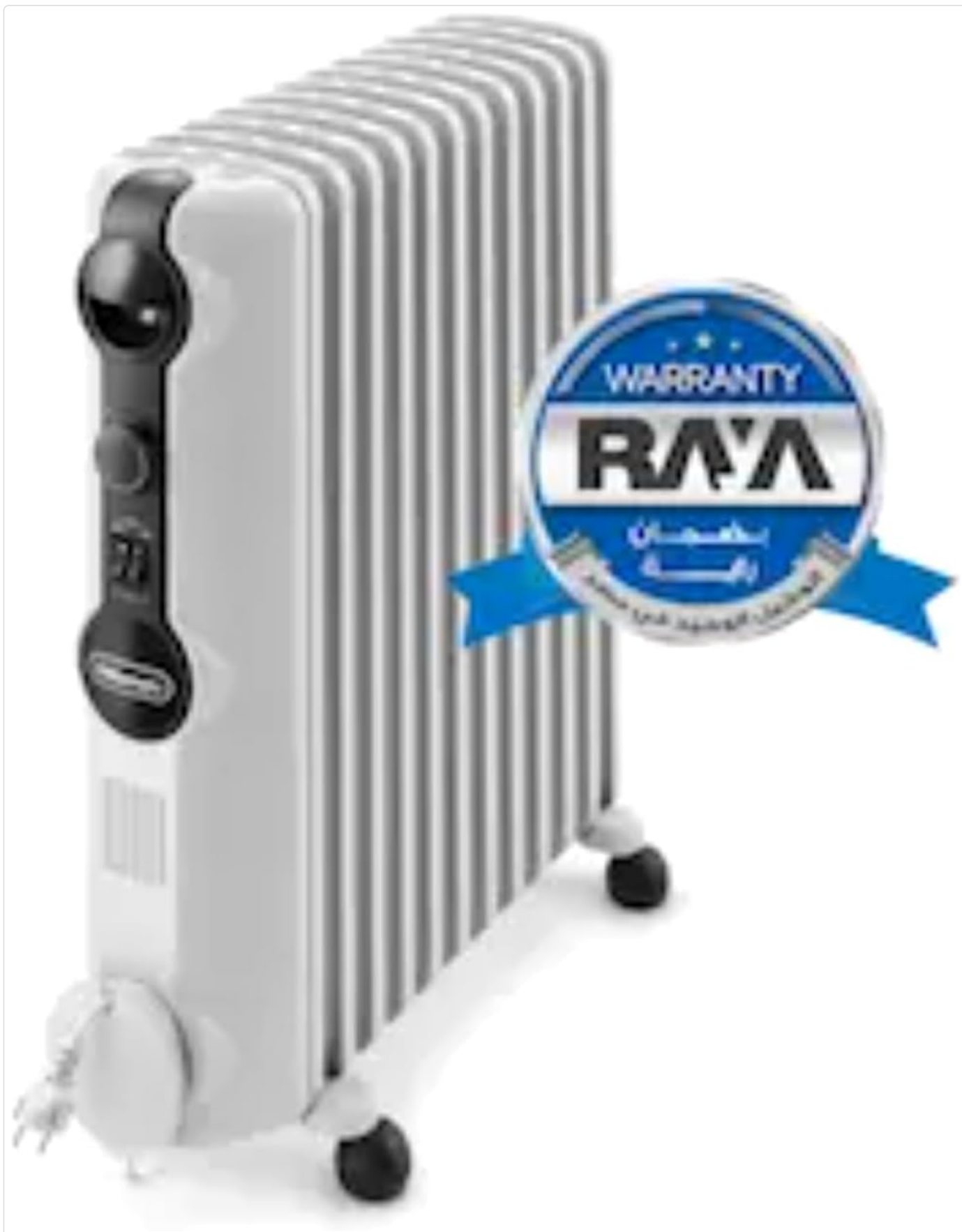
Image: The De'Longhi TRRSE1225 Radiator shown with a generic warranty badge, indicating product assurance.