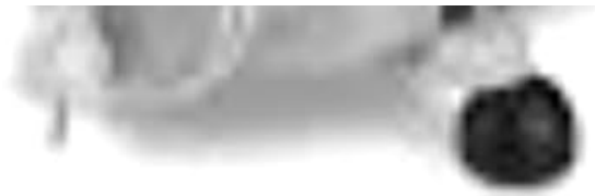
Image: The De'Longhi TRRSE1225 Radiator, showing its full profile and the De'Longhi logo. This illustrates the complete unit as it appears out of the box.