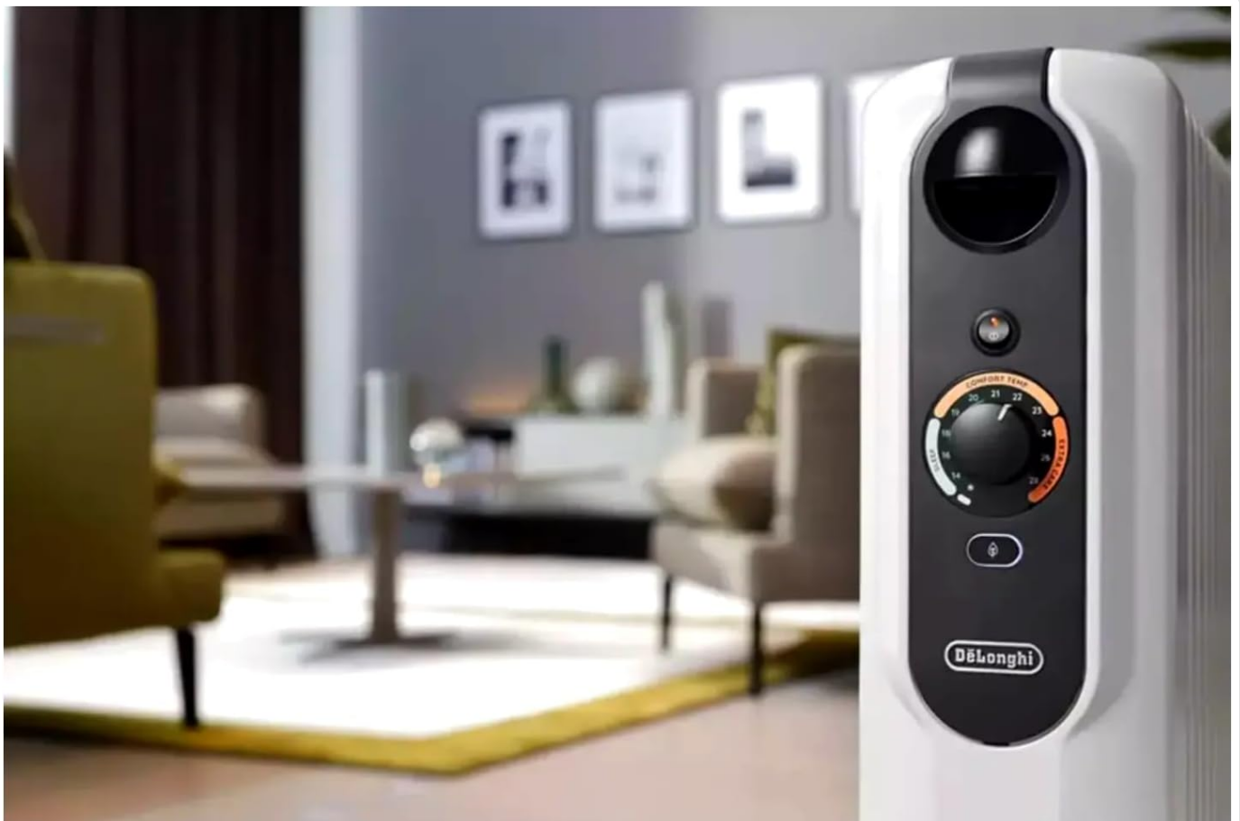
Image: The De'Longhi TRRSE1225 Radiator positioned in a living room, demonstrating appropriate placement away from furniture for optimal heating and safety.