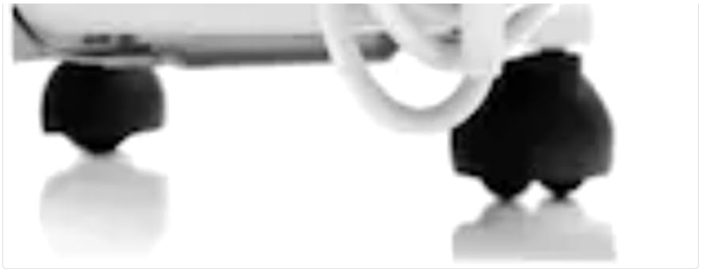
Image: A close-up view of the integrated power cord storage on the De'Longhi TRRSE1225 Radiator, demonstrating how to neatly store the cord when not in use.

If you encounter issues with your radiator, consult the following table before contacting customer support.