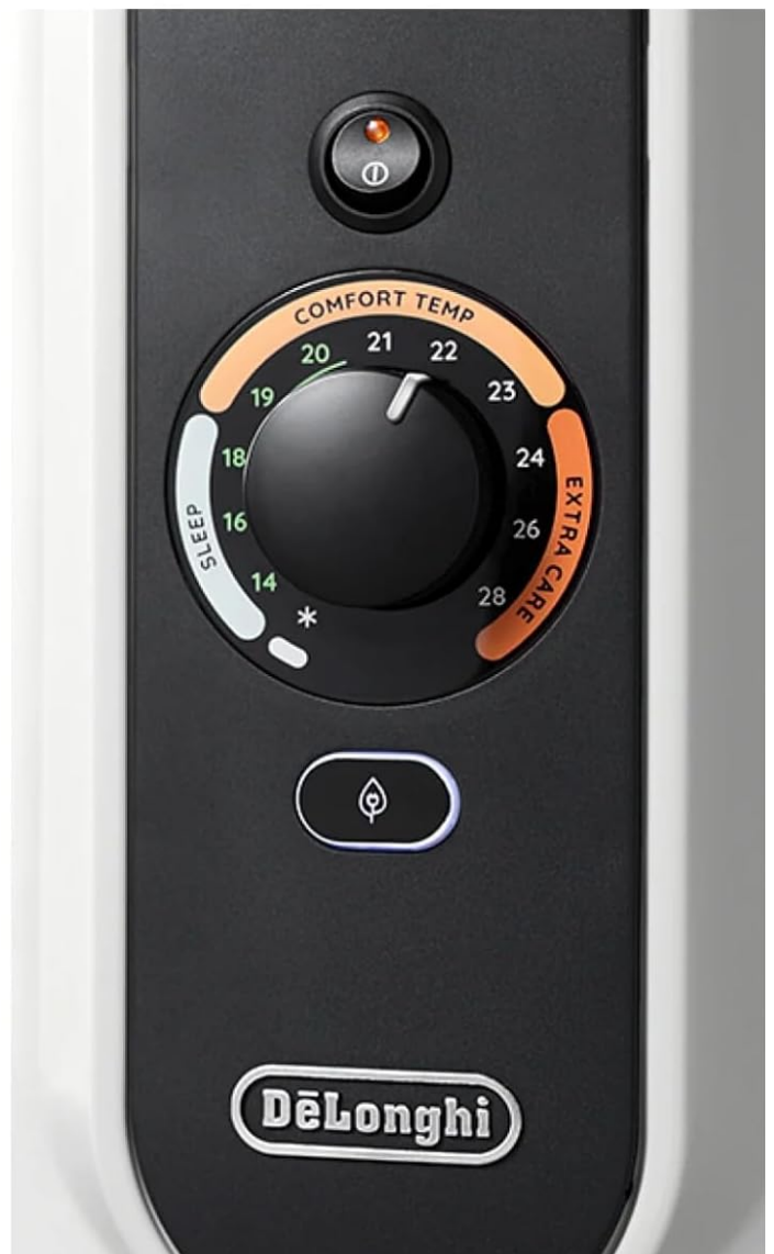
Image: The control panel with text highlighting "Your comfort precisely selected," illustrating the intuitive interface for choosing the ideal temperature.