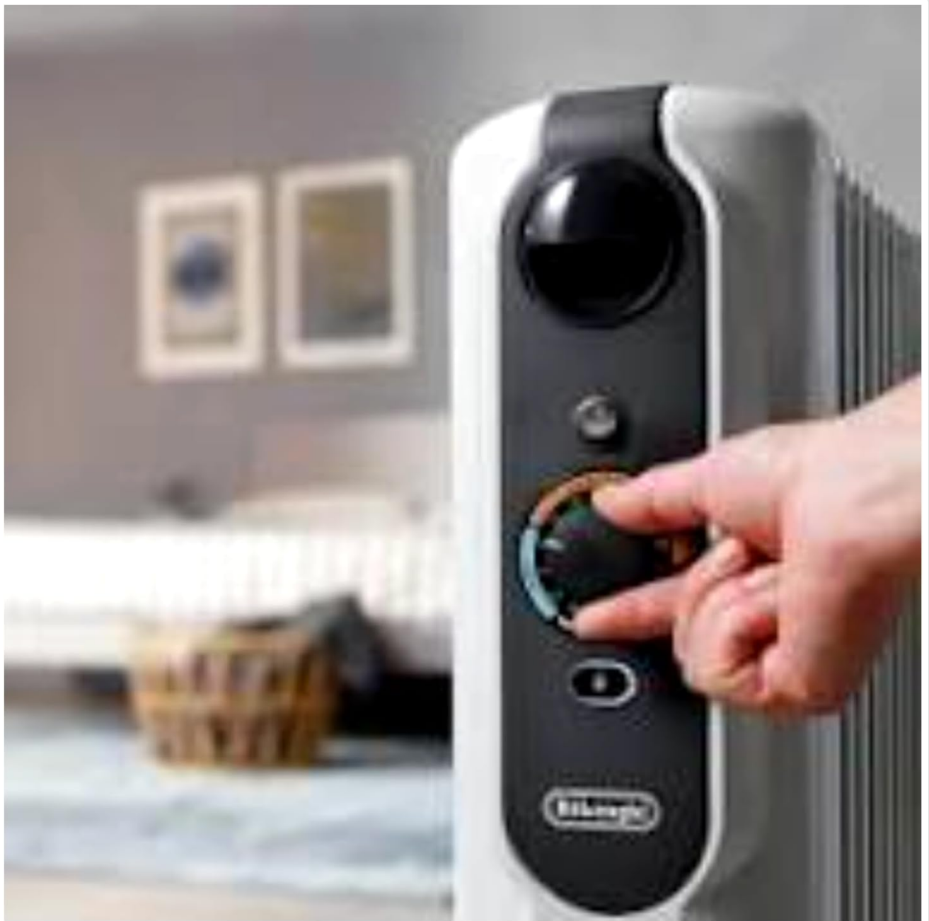
Image: A hand demonstrating the adjustment of the temperature dial on the control panel, highlighting the ease of setting the desired heat level.