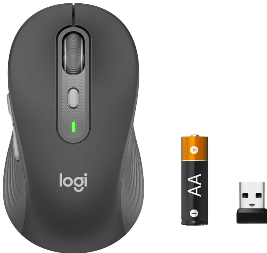
Figure 2: Included components: mouse, AA battery, and Logi Bolt USB receiver.