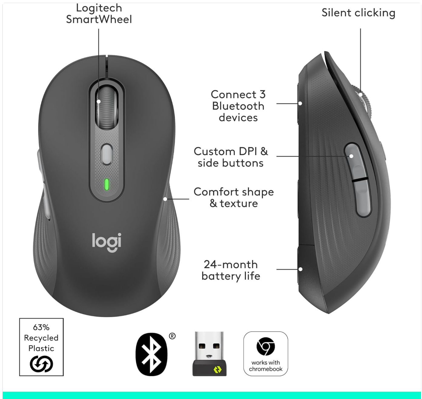
Figure 9: Key features overview.