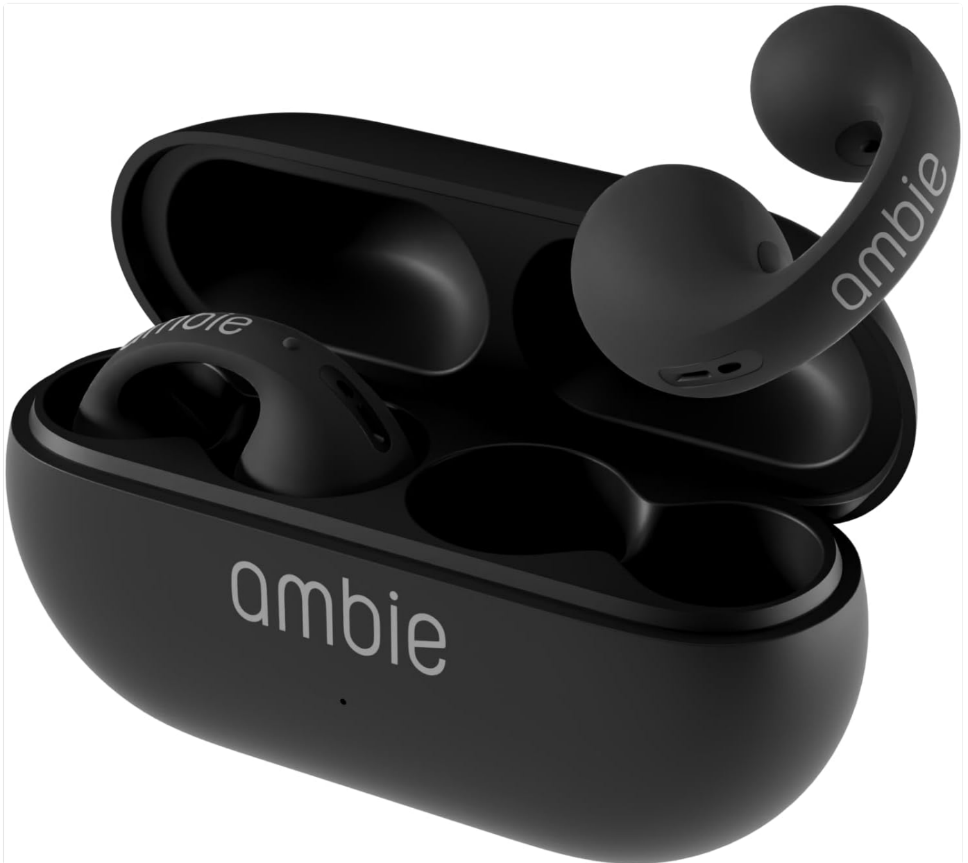
Image: The ambië AM-TW02 Open Ear Wireless Earphones shown with their charging case. The earbuds are black with the 'ambië' logo, and the charging case is also black with the 'ambië' logo on top.