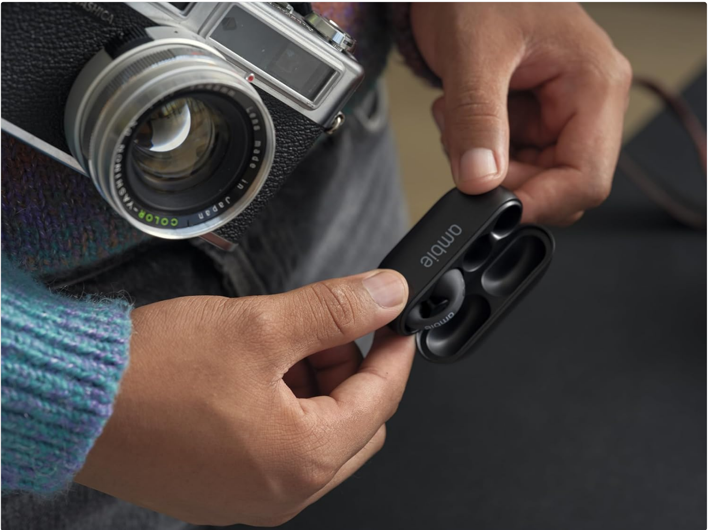
Image: A pair of hands demonstrating the placement of the ambie AM-TW02 earbuds into their compact black charging case. The case is open, revealing the molded slots for each earbud.