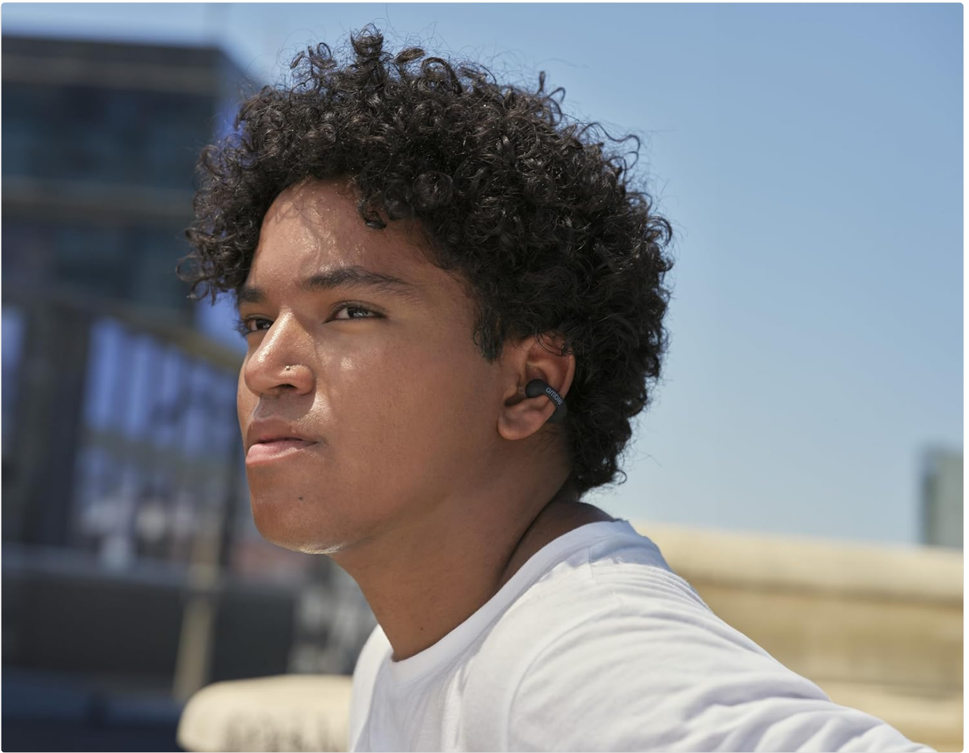
Image: A close-up of a person wearing the ambie AM-TW02 open ear earphones. The earbud is discreetly clipped onto the ear, demonstrating its unique design that allows for situational awareness.