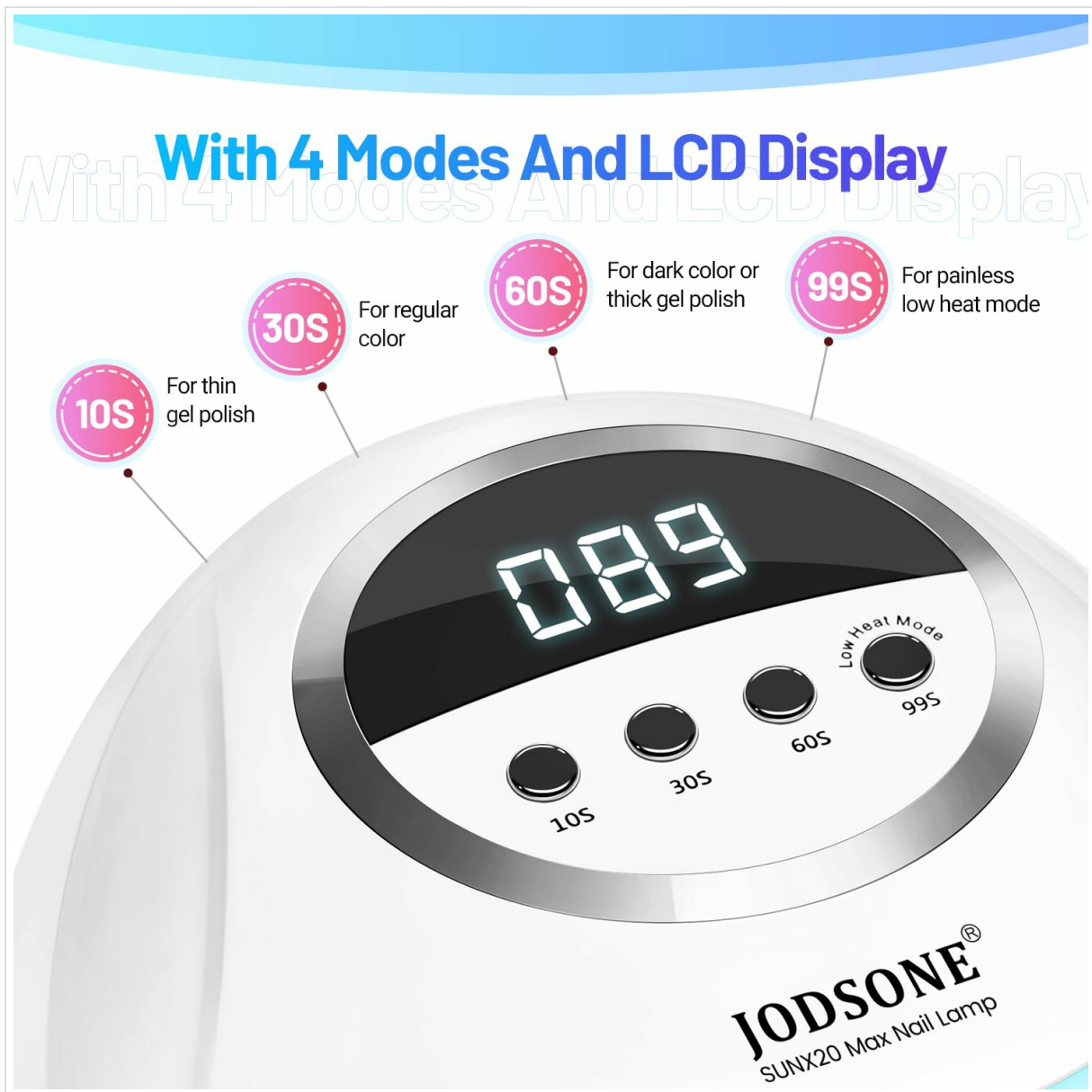
Figure 4: The LCD display and timer buttons for selecting specific curing durations.