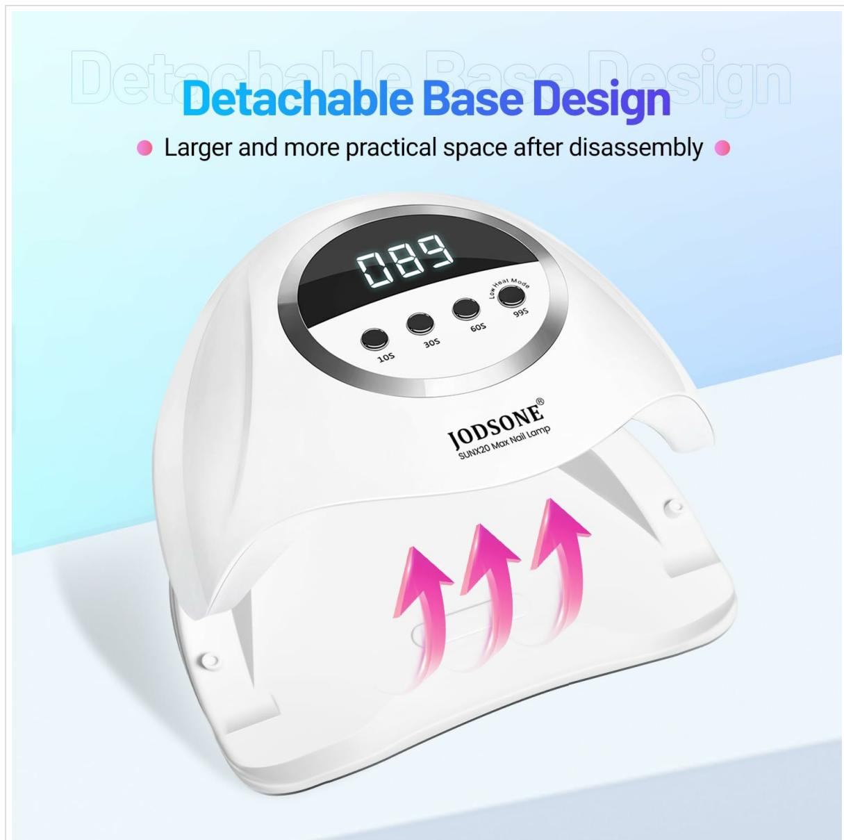
Figure 2: Illustration of the detachable base design, allowing for easier cleaning and versatile use.