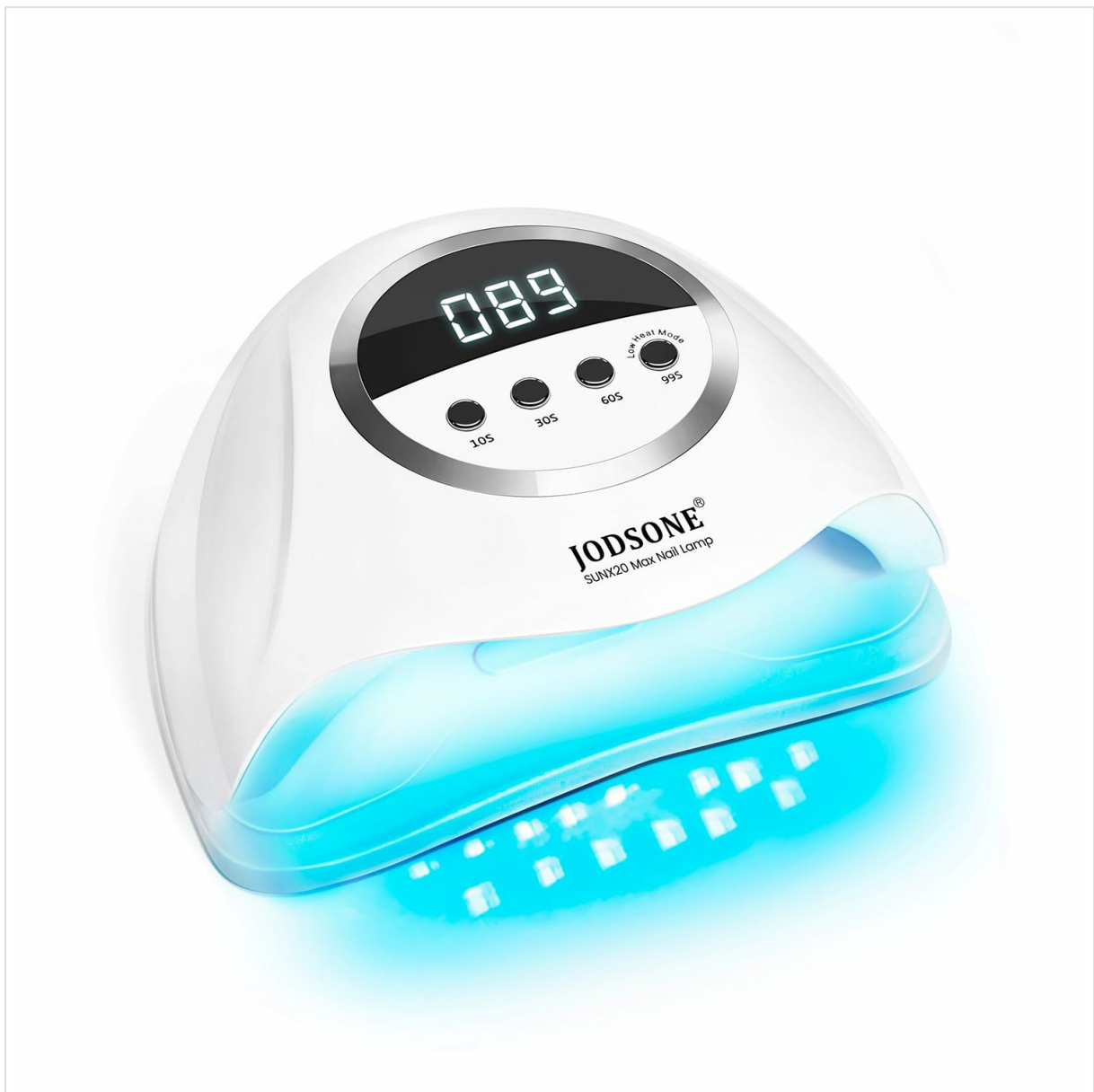
Figure 1: Front view of the JODSONE UV LED Nail Lamp, showing the digital display and timer buttons.