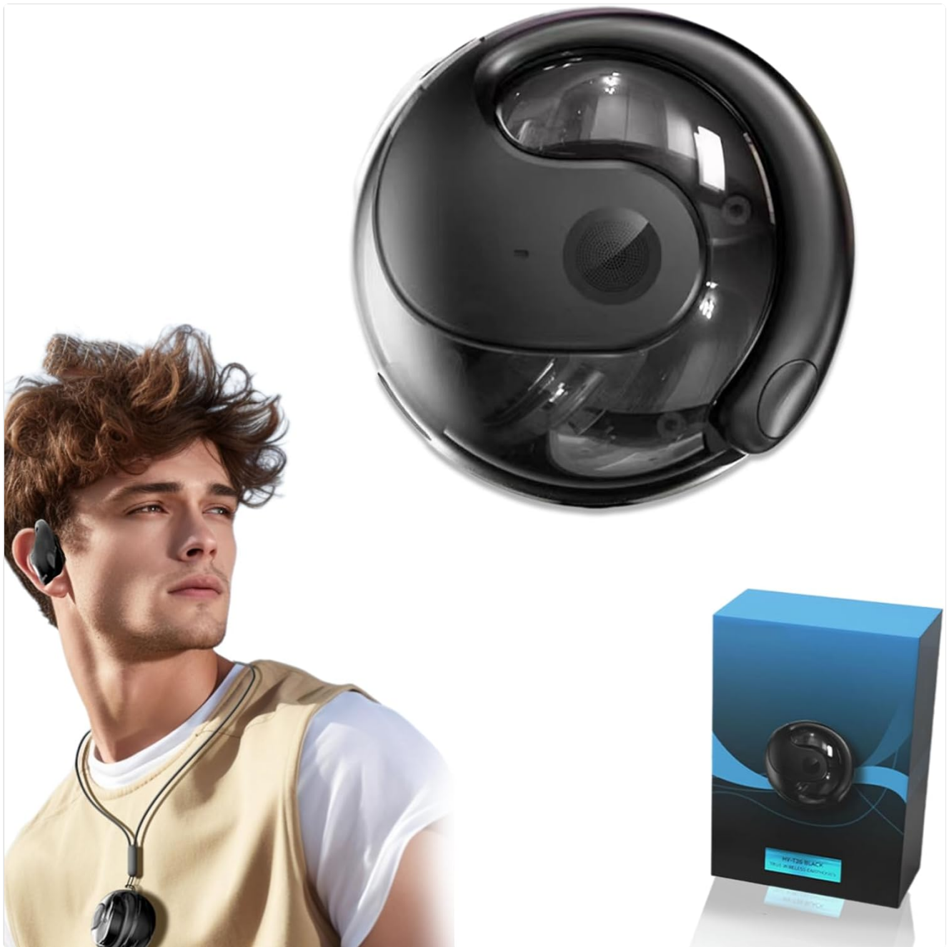
Figure 1.1: T26 Pro Language Translator Earbuds and charging case.