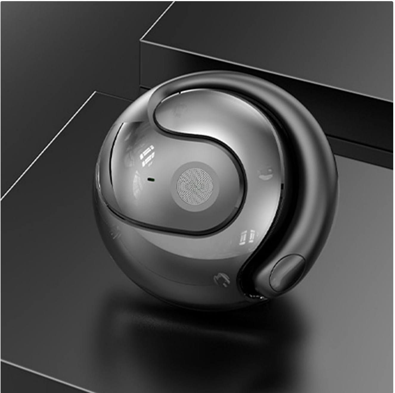
Figure 3.4: Earbud highlighting audio capabilities.