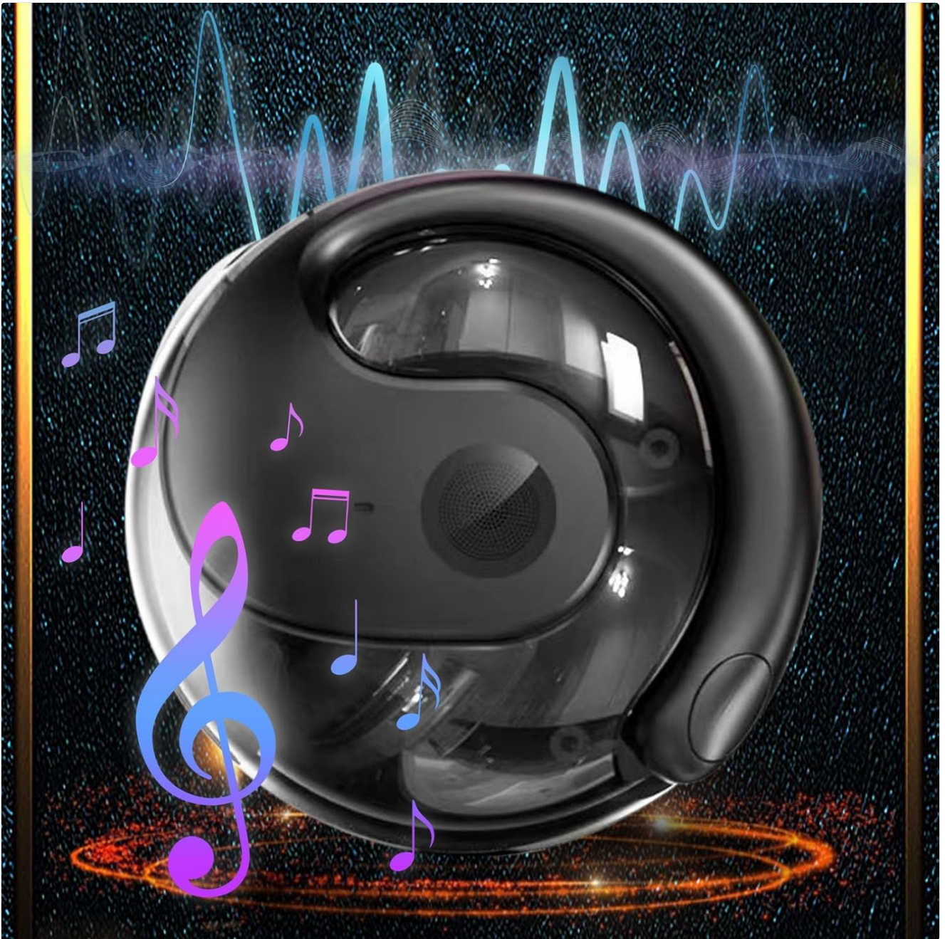
Figure 3.3: AI chat feature for interactive translation.