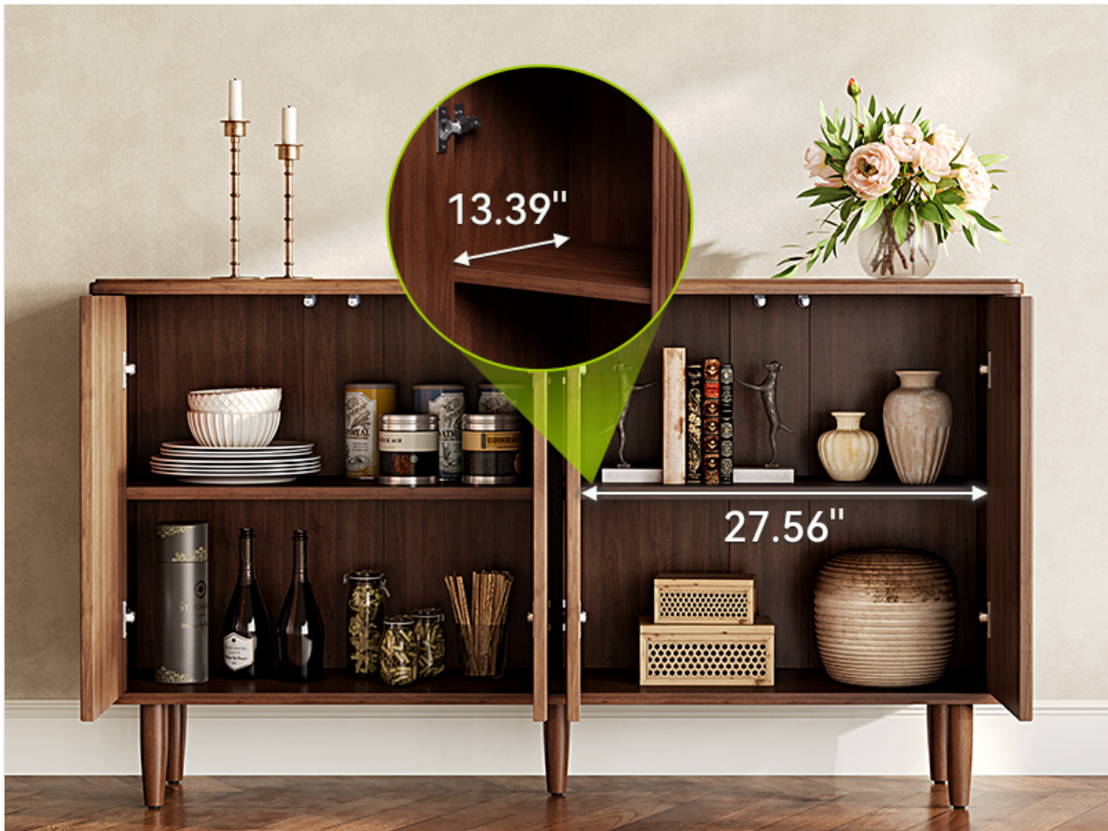
Figure 4: Cabinet with doors open, showcasing the internal storage compartments.

The cabinet offers ample storage with a spacious countertop and four tiered inner shelves. These shelves are ideal for accommodating various utensils, appliances, books, dishes, or other items.