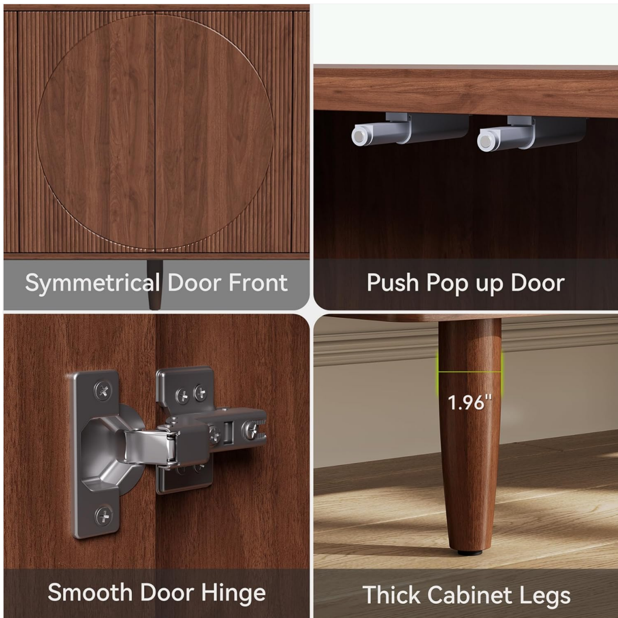
Figure 3: Detail of the push-pop door mechanism and cabinet legs.