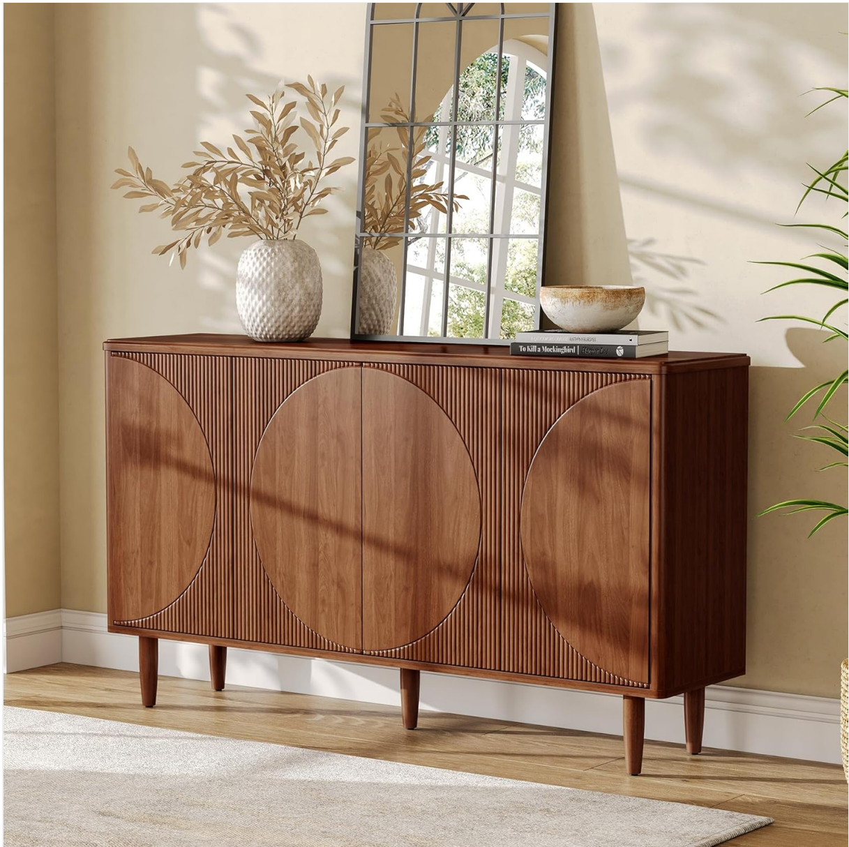
Figure 1: Fully assembled LITTLE TREE 59-Inch Buffet Cabinet Sideboard.