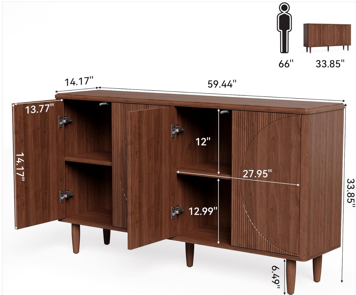
Figure 2: Product dimensions and internal shelf layout for assembly reference.