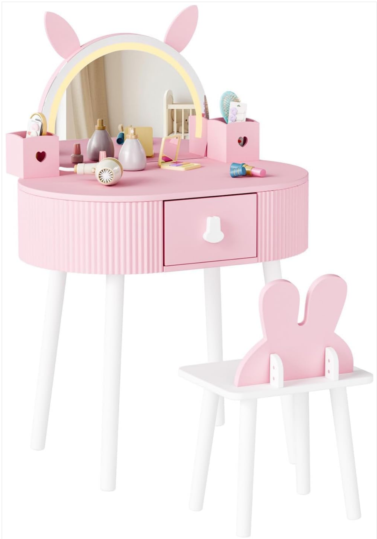
Image: The JOYMOR Kids Vanity with Lights in pink, featuring a rabbit-ear mirror and matching stool.