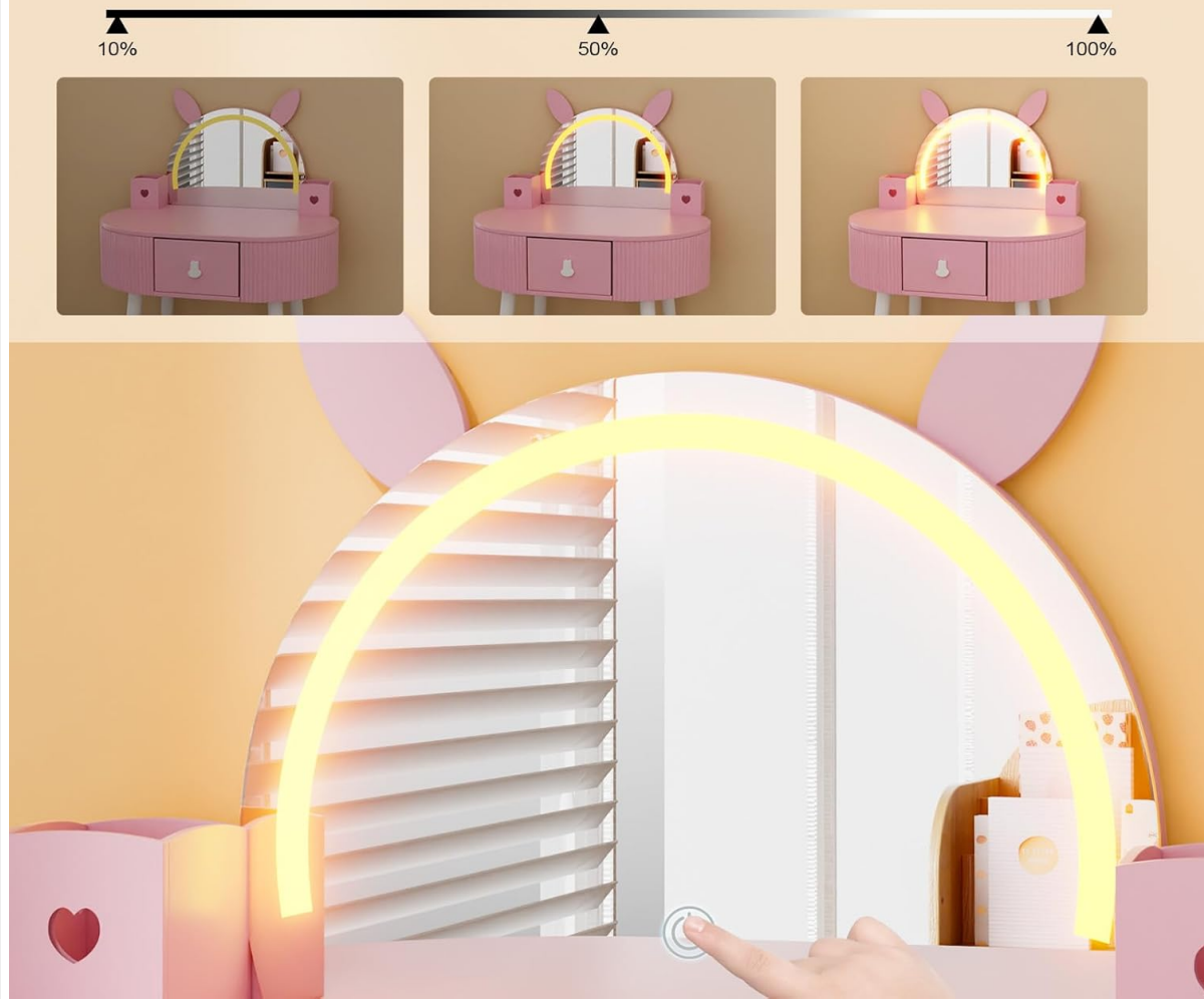
Image: Illustration showing the 3-color LED touch mirror lighting with different brightness modes (10%, 50%, 100%) and a finger touching the sensor.

Long Press to Adjust Different Brightness Modes