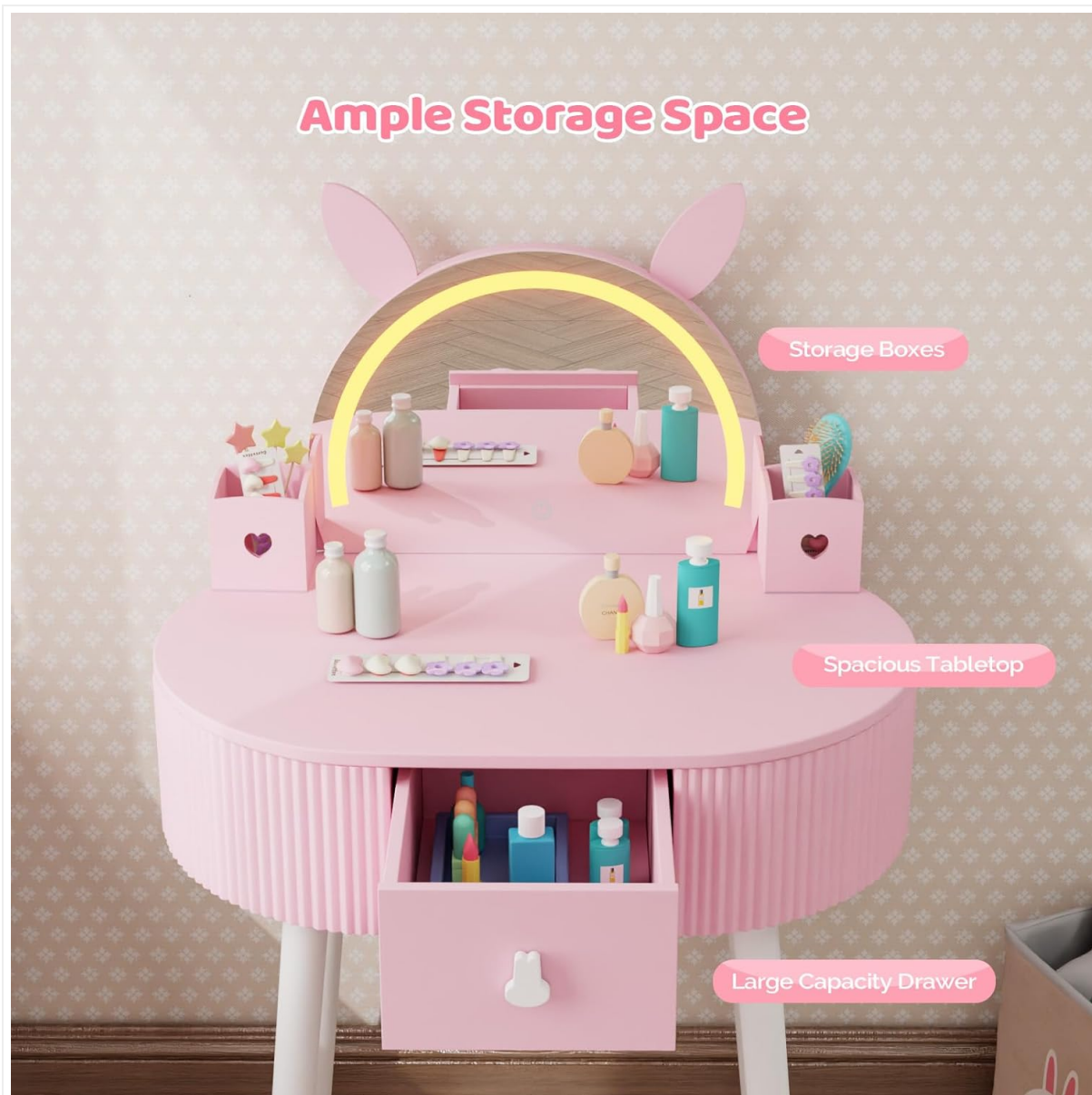
Image: An overhead view of the vanity highlighting the spacious tabletop, two storage boxes, and a large capacity drawer.