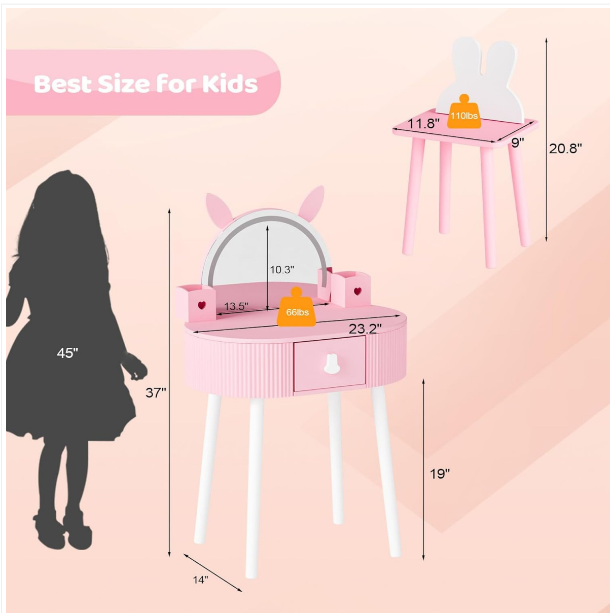
Image: Diagram illustrating the dimensions of the JOYMOR Kids Vanity and its accompanying chair, showing height, width, and depth measurements.