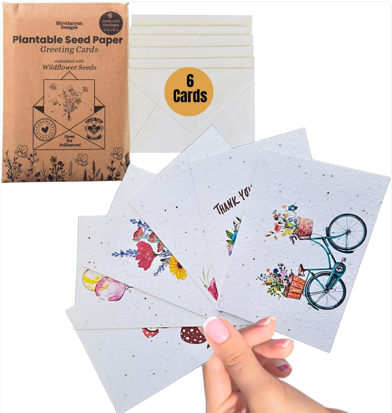
Image 1.1: Complete set of Plantable Seed Paper Greeting Cards, including cards, envelopes, and packaging.