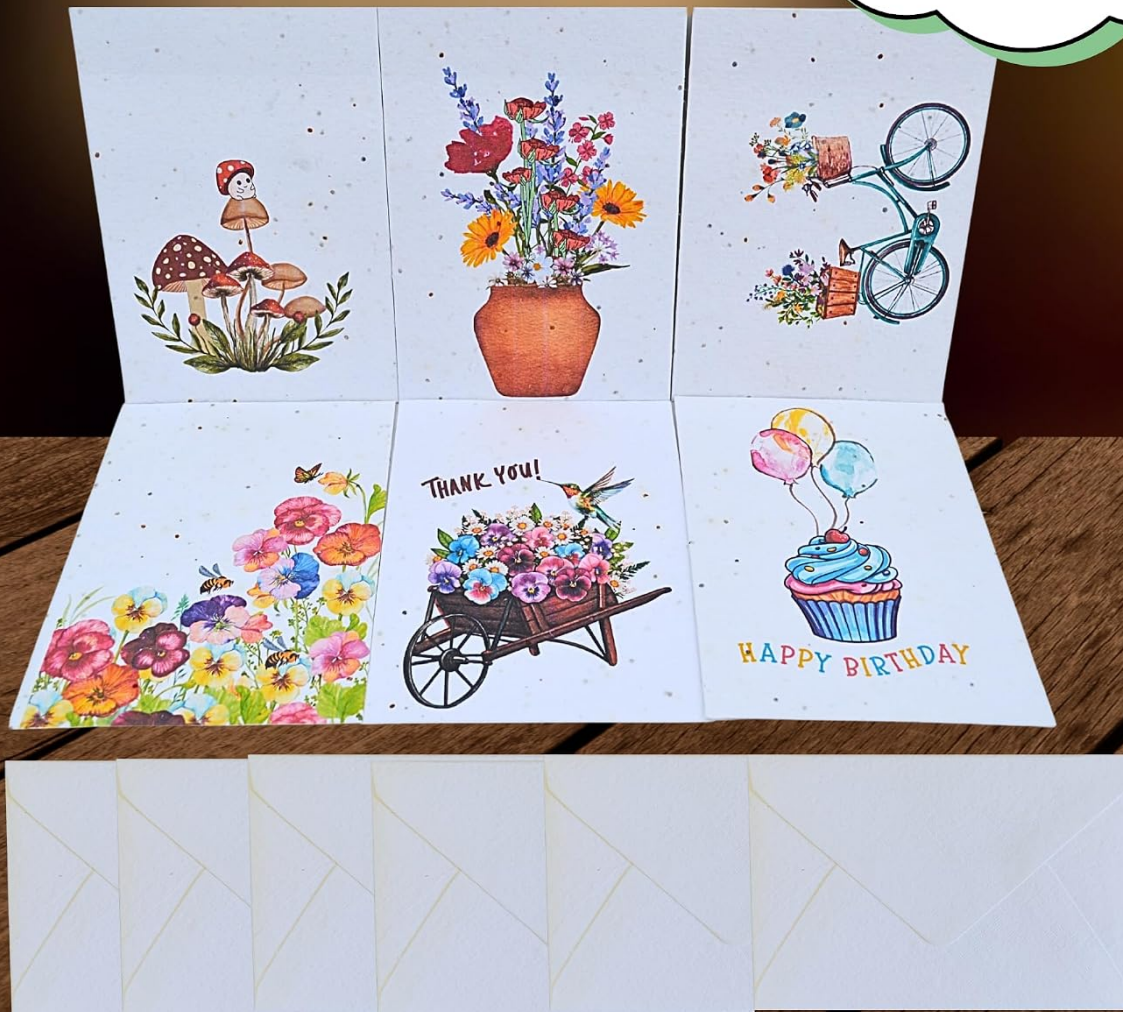
Image 2.1: A selection of six plantable greeting cards, each with a unique design, accompanied by their respective envelopes.