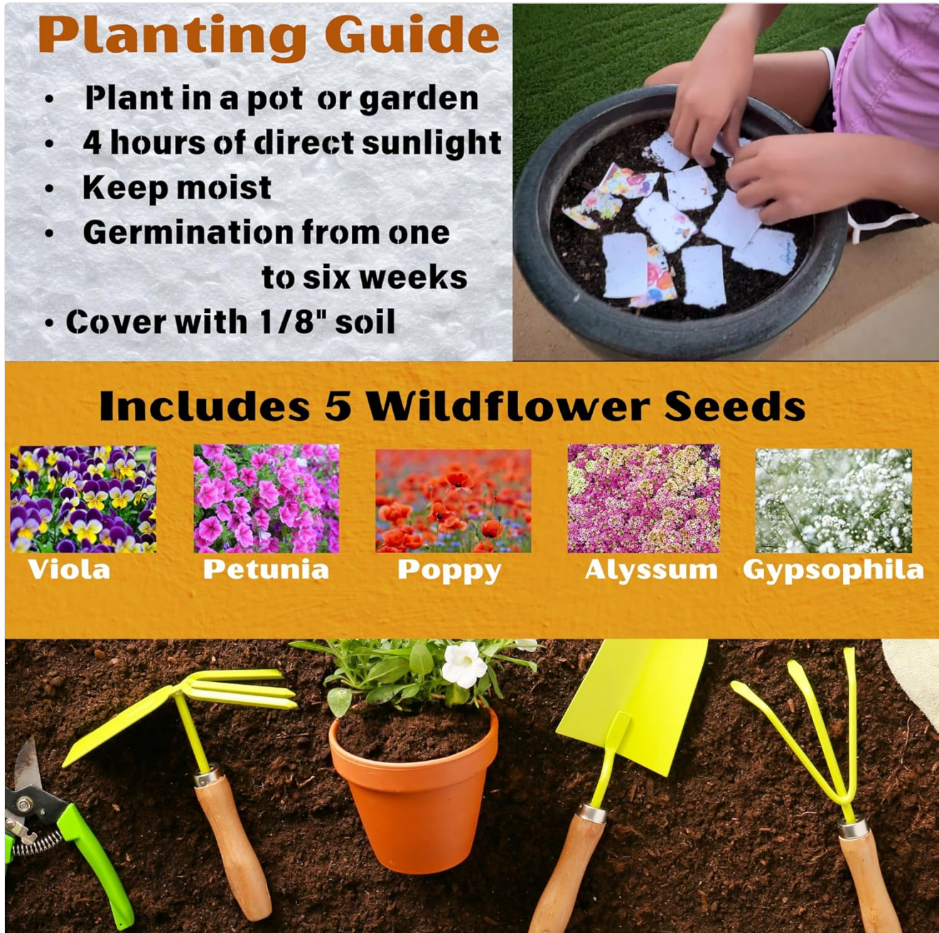
Image 3.1: A visual guide detailing the planting steps and illustrating the five types of wildflower seeds embedded in the paper: Viola, Petunia, Poppy, Alyssum, and Gypsophila.

Video 3.1: An official product video demonstrating the process of using and planting the Plantable Seed Paper Greeting Cards.