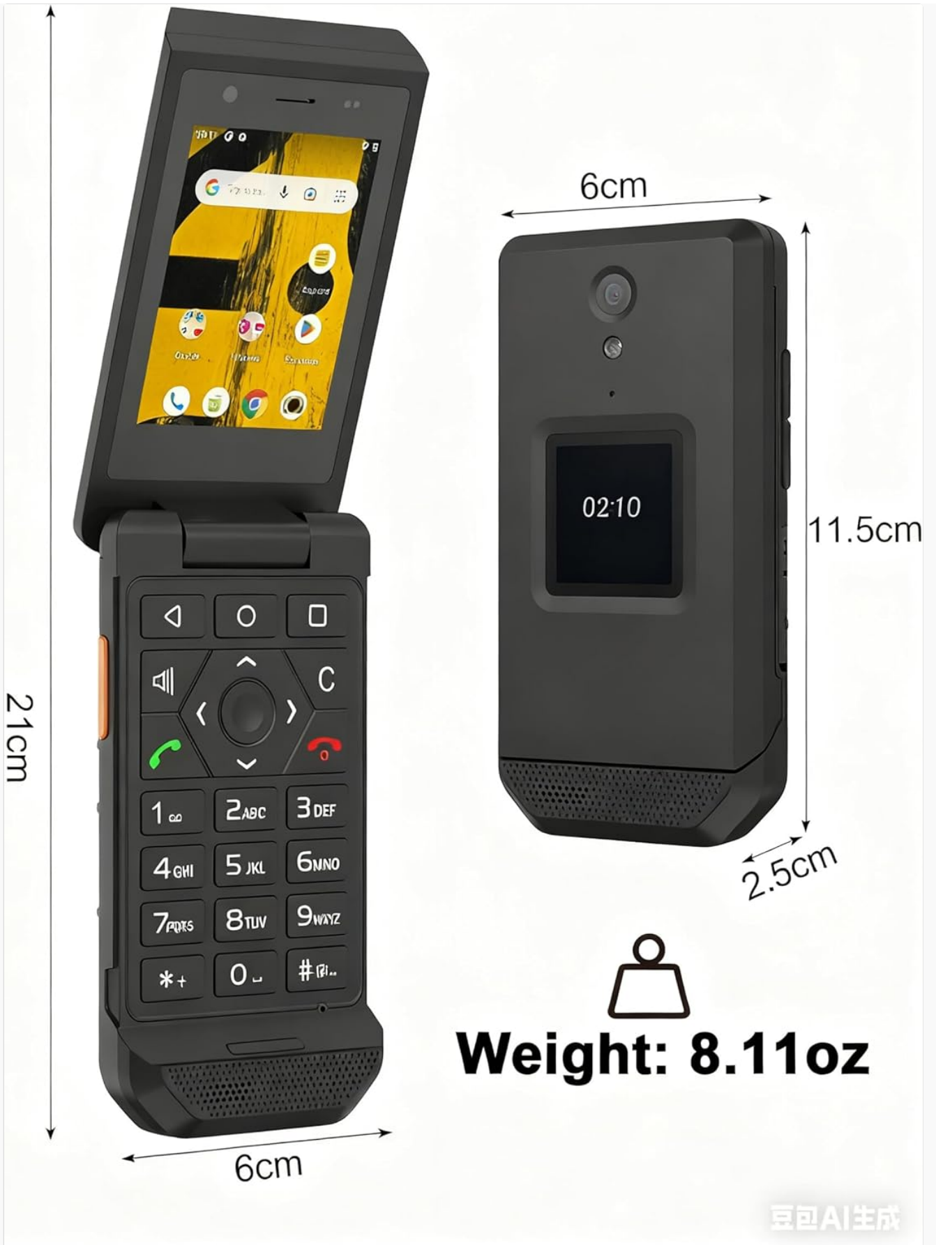
Image: Diagram illustrating the dimensions and weight of the Unifone S22 Flip Phone.