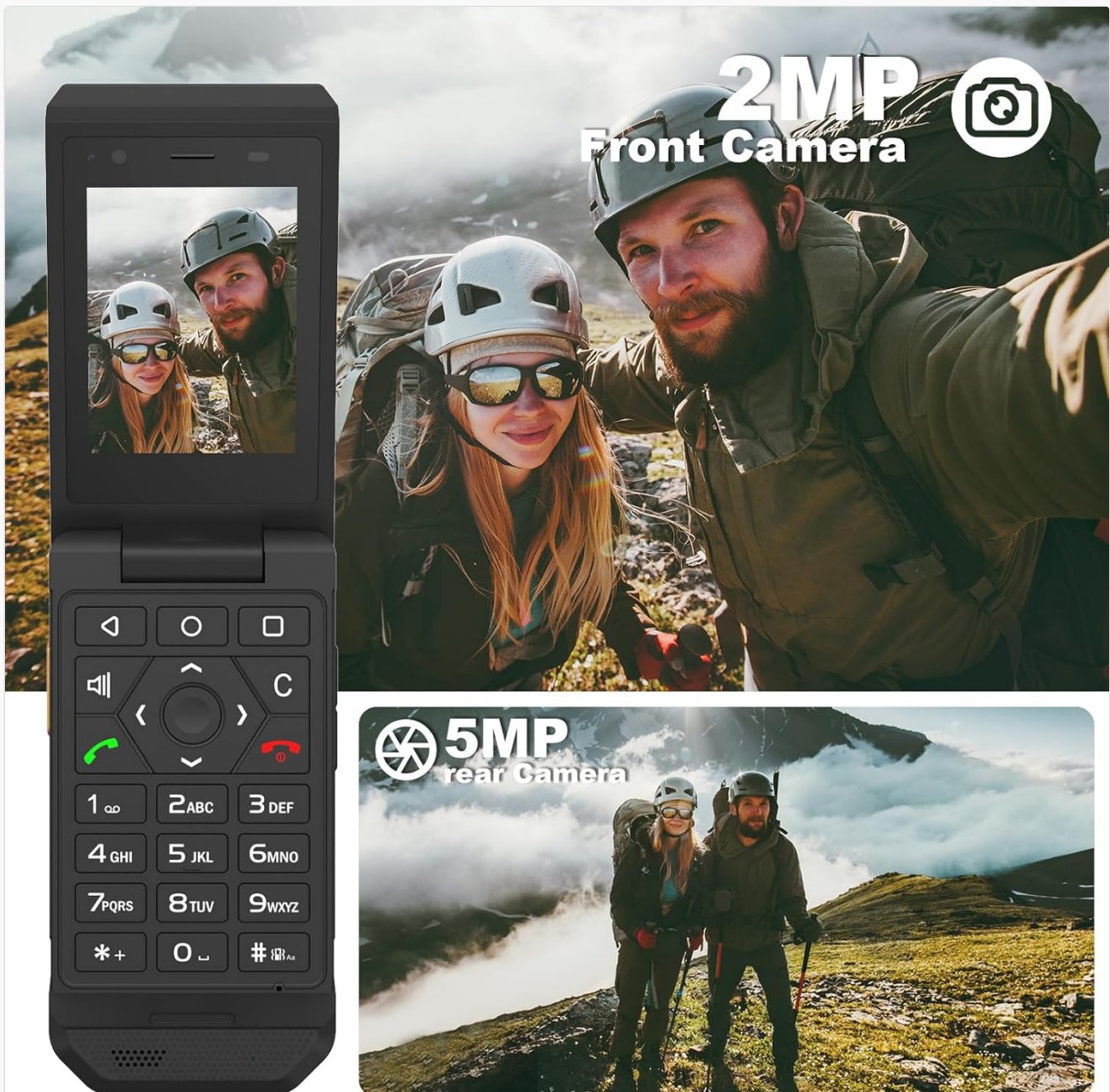
Image: Illustration of the Unifone S22 Flip Phone's 5MP rear camera and 2MP front camera capabilities.