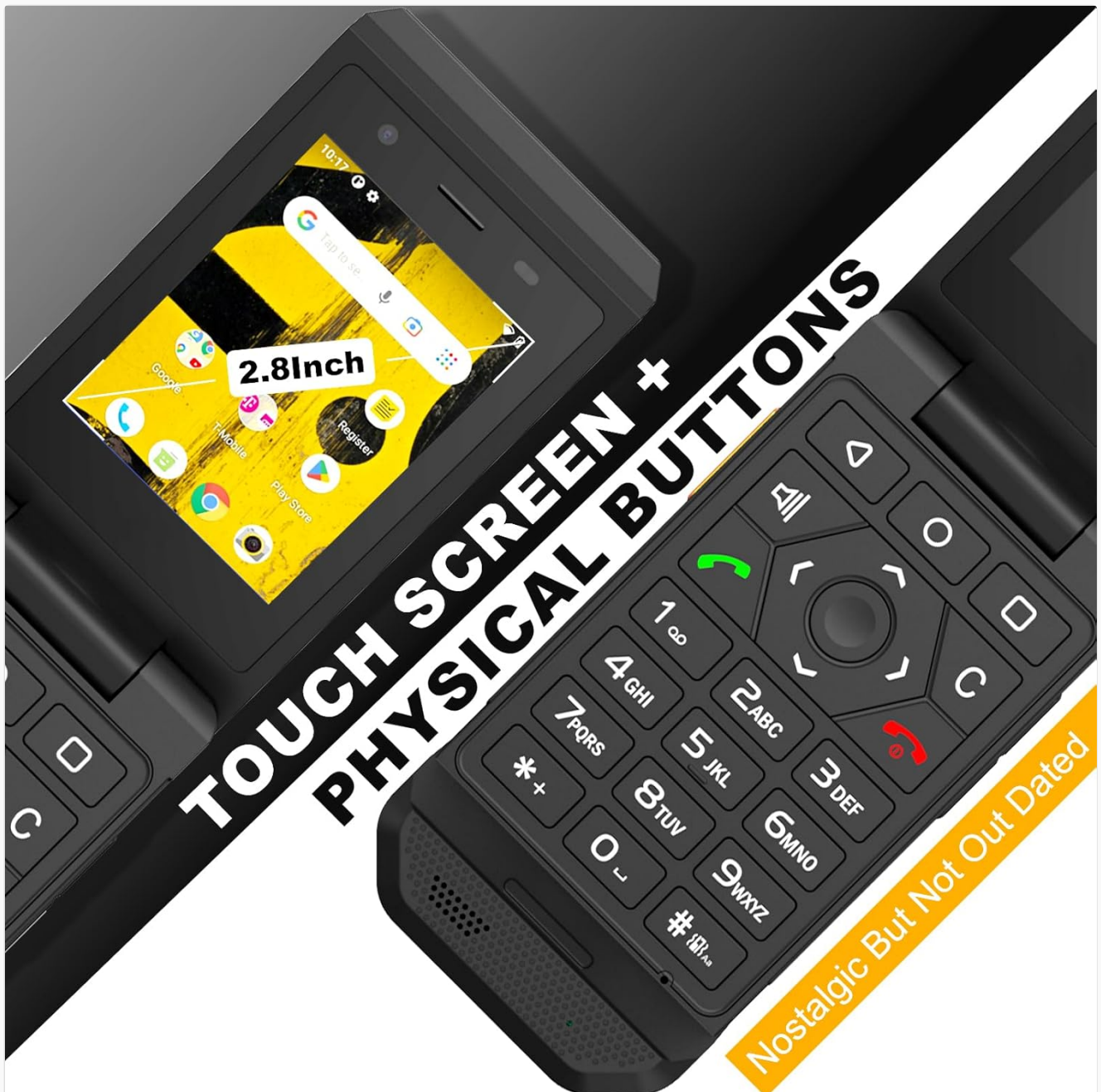
Image: The Unifone S22 Flip Phone displaying its 2.8-inch touchscreen and physical keypad.

The S22 Flip combines a 2.8-inch touchscreen with traditional physical buttons, offering flexible navigation. You can interact with the device by tapping and swiping on the screen or by using the keypad and directional buttons.