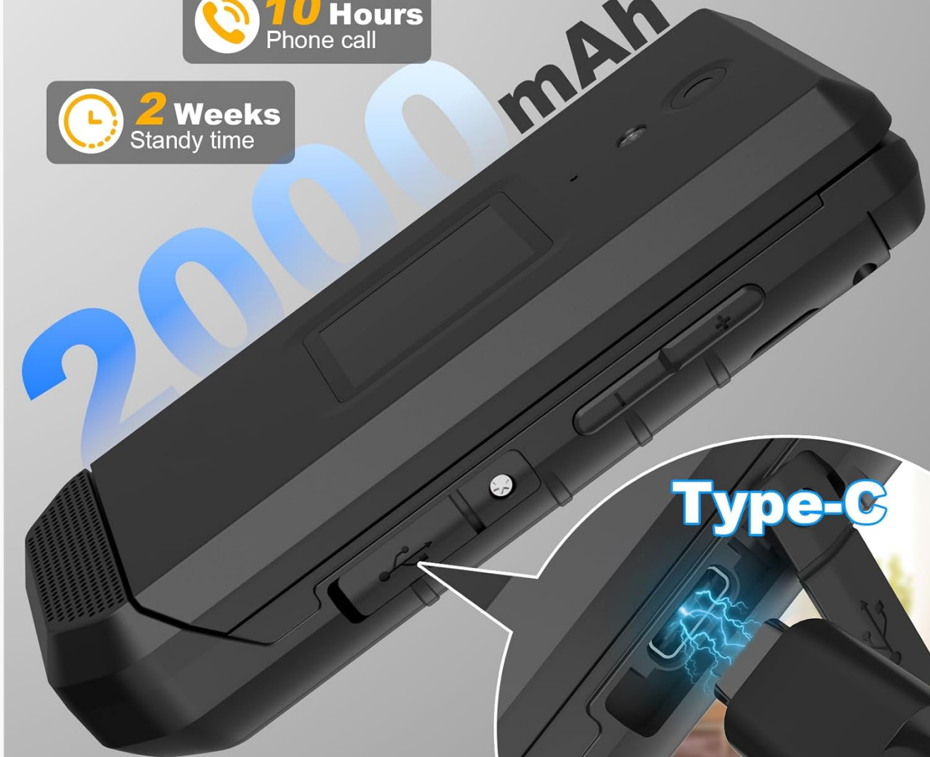
Image: The Unifone S22 Flip Phone connected to a charger via its Type-C port.