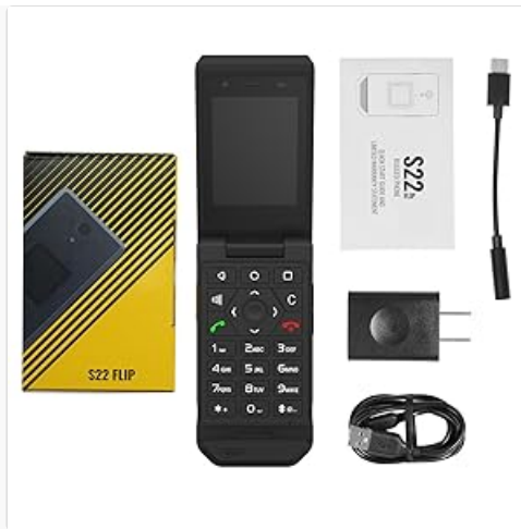
Image: Contents of the Unifone S22 Flip Phone retail box, including the phone, charger, adapter, and documentation.