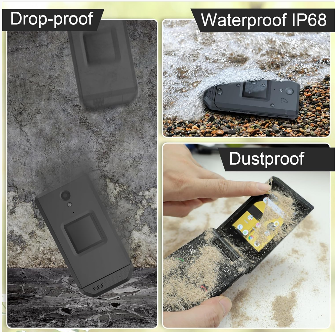
Image: Visual representation of the Unifone S22 Flip Phone's drop-proof, waterproof (IP68), and dustproof capabilities.

The S22 Flip is designed to be rugged, featuring IP68 water, dust, and drop resistance. This means it can withstand immersion in water up to 1.5 meters for 30 minutes, is protected against dust ingress, and can endure drops from a certain height. While durable, avoid intentional misuse or extreme conditions.