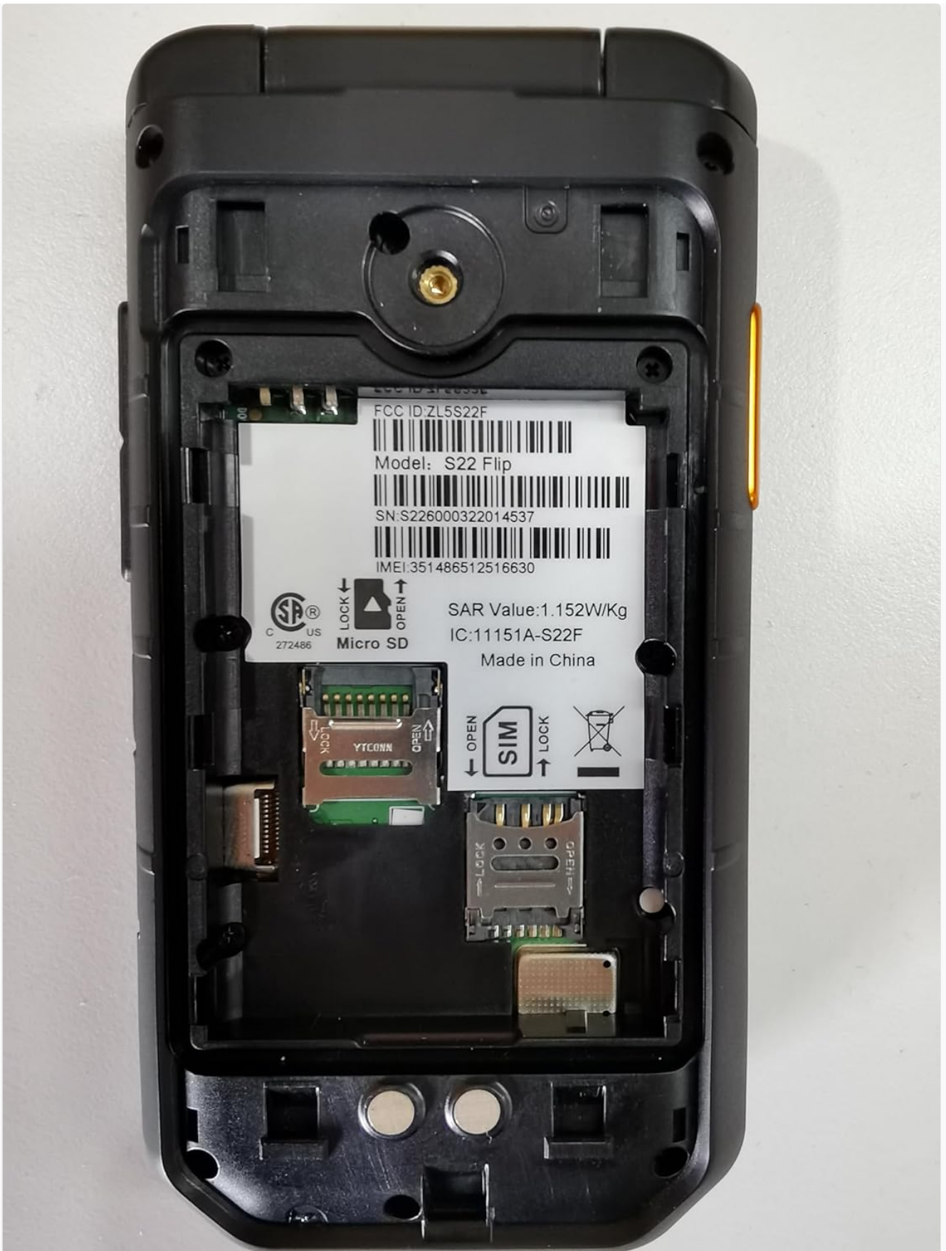
Image: Internal view of the Unifone S22 Flip Phone, highlighting the SIM card and Micro SD card slots.