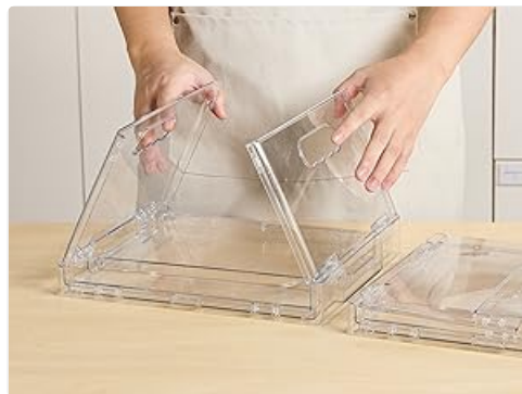
Image 3.2: Folding the bin for storage. The bins can be collapsed when not in use to save space.