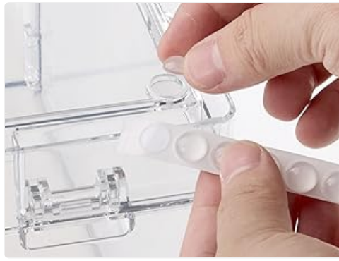
Image 3.3: Applying silicone pads. These pads help prevent the bins from sliding on smooth surfaces.