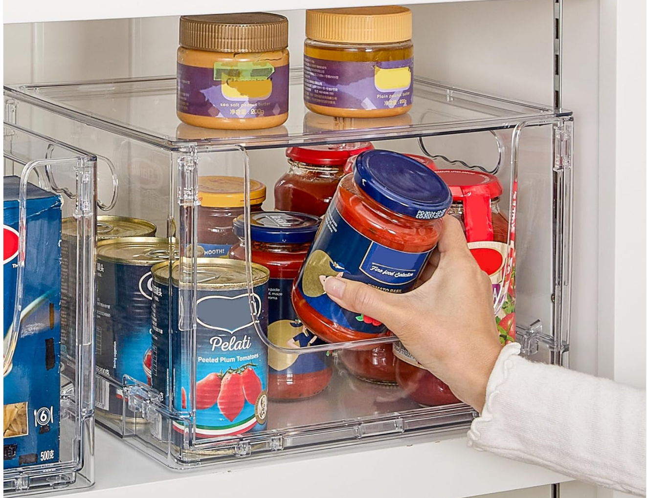
Image 4.1: Open Front for Easy Access. The design allows for convenient retrieval of items.