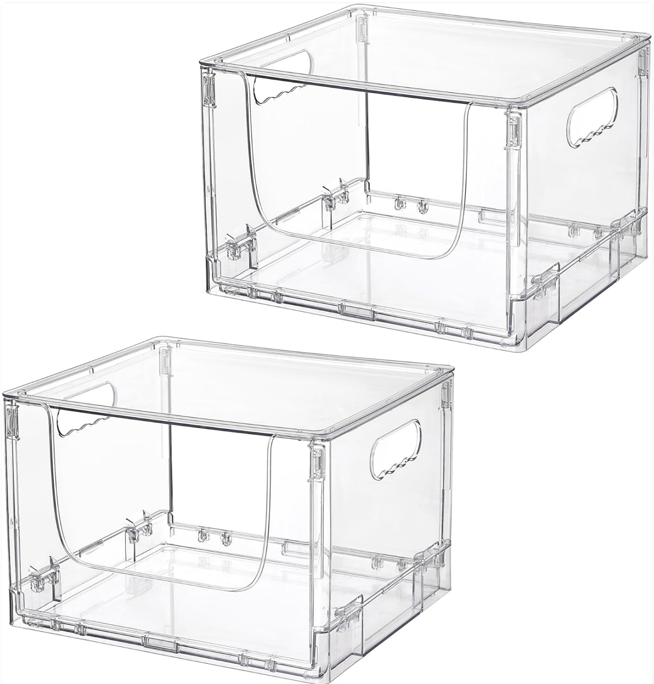
Image 1.1: Two Vtopmart Foldable Open Front Storage Bins. These bins are designed for efficient storage and easy access.