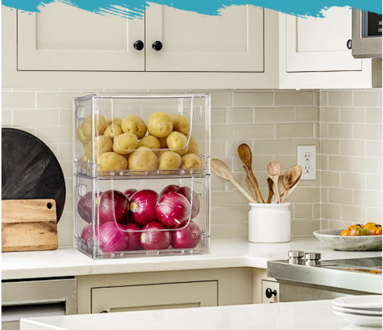
Image 4.2: Stackable for Space-Saving. Bins can be stacked to optimize vertical storage.

Keeping countertops neat and clutter-free