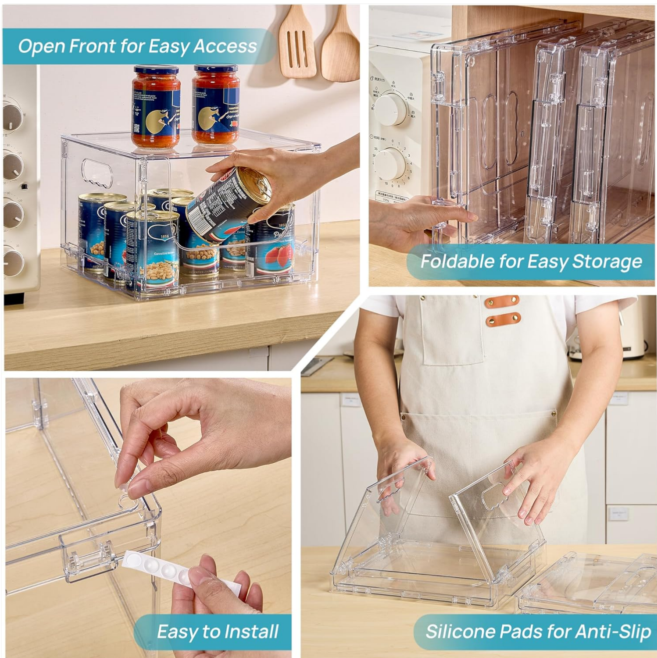
Image 3.1: Visual guide for assembly and key features. The bins are designed to be easily folded and unfolded, and include anti-slip pads for stability.