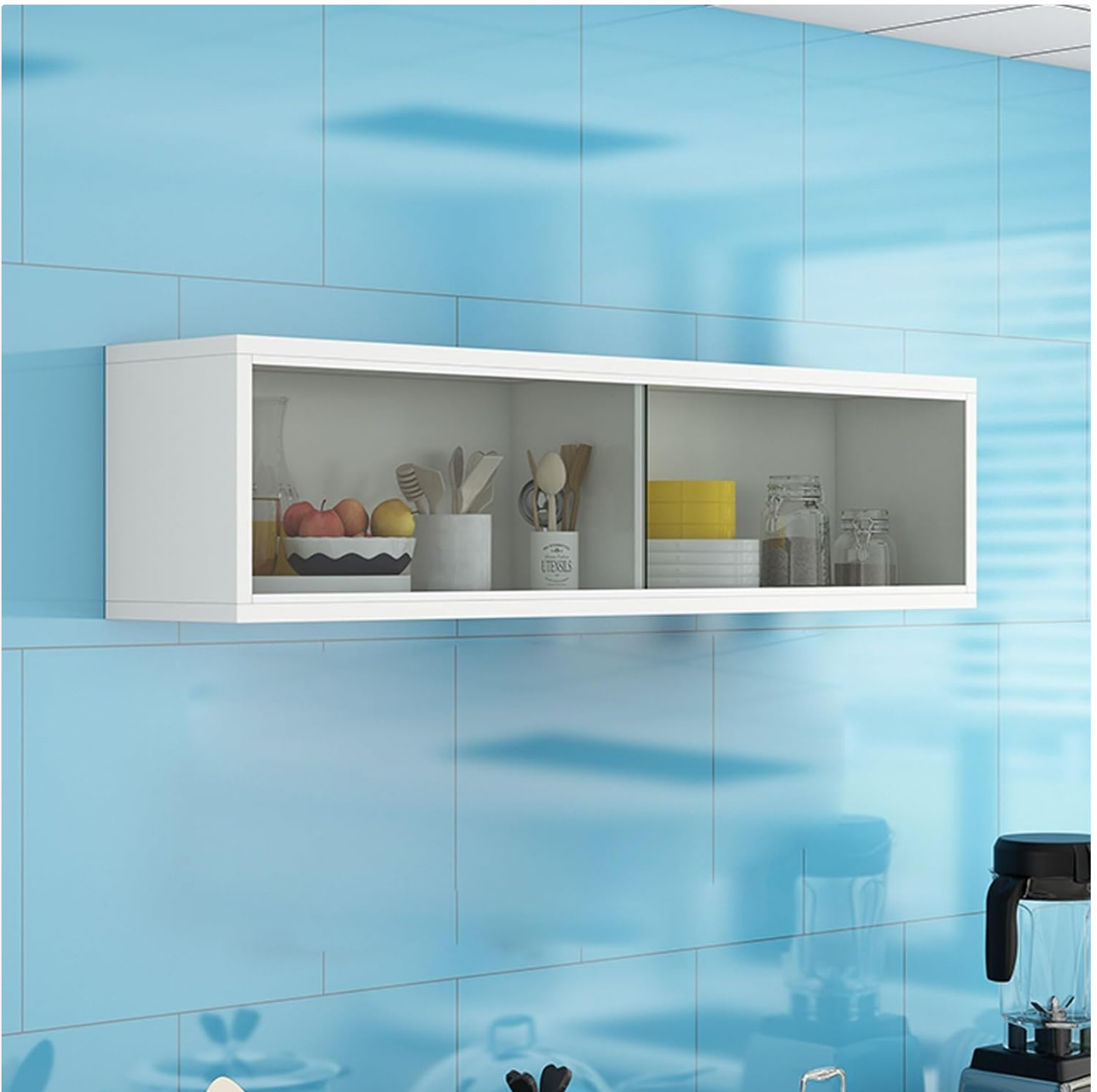
Figure 1: YITAYMLI Wall Mounted Glass Display Cabinet (White)