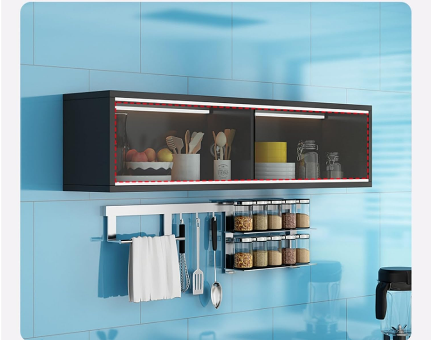
Figure 4: Thickened Explosion-Proof Glass Door

Thickened sliding glass door, sliding design saves space and makes the space more spacious