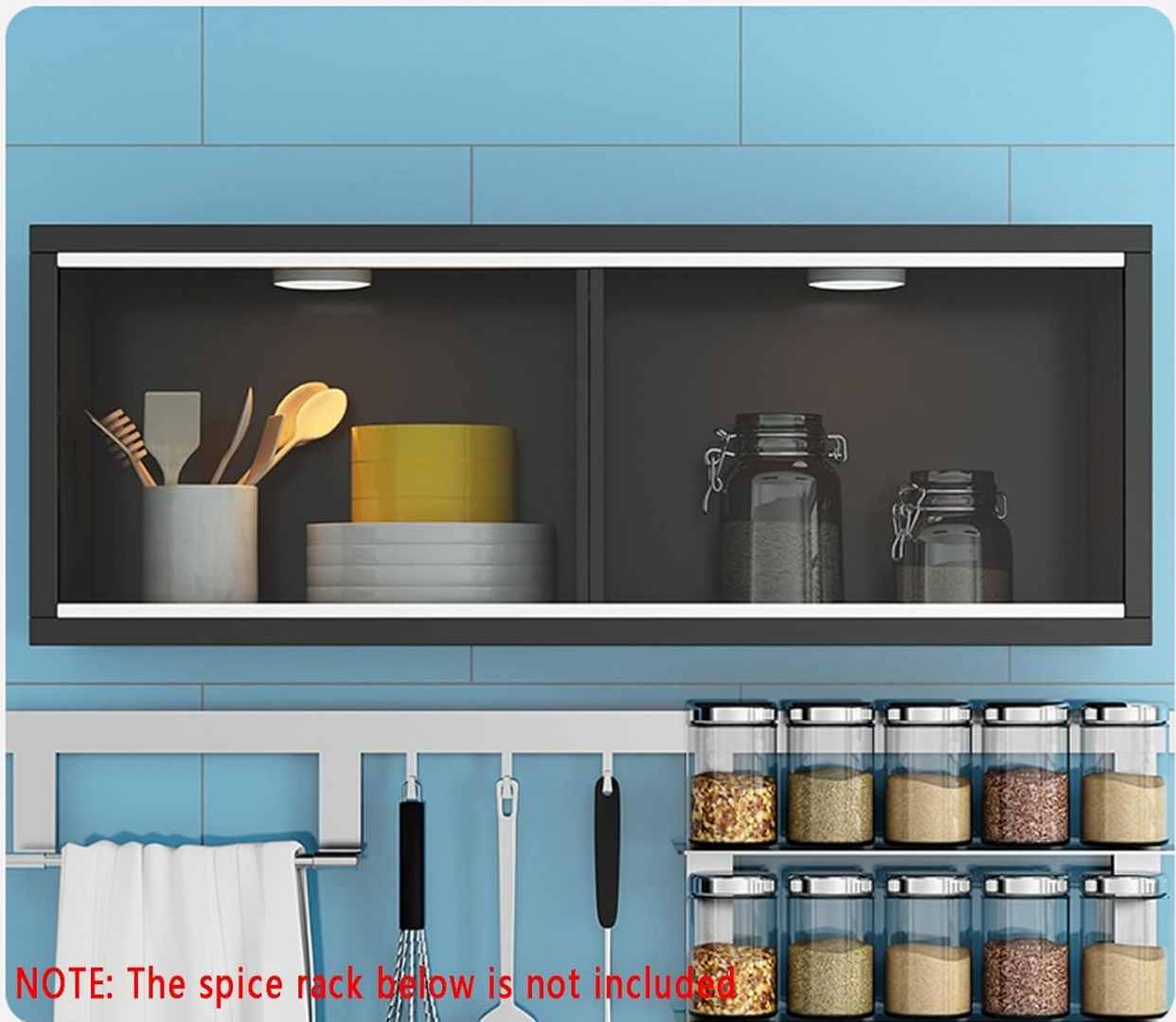
Figure 6: Double-Grid Classified Storage

Double-grid separated storage design allows storage to be classified and organized, no longer messy