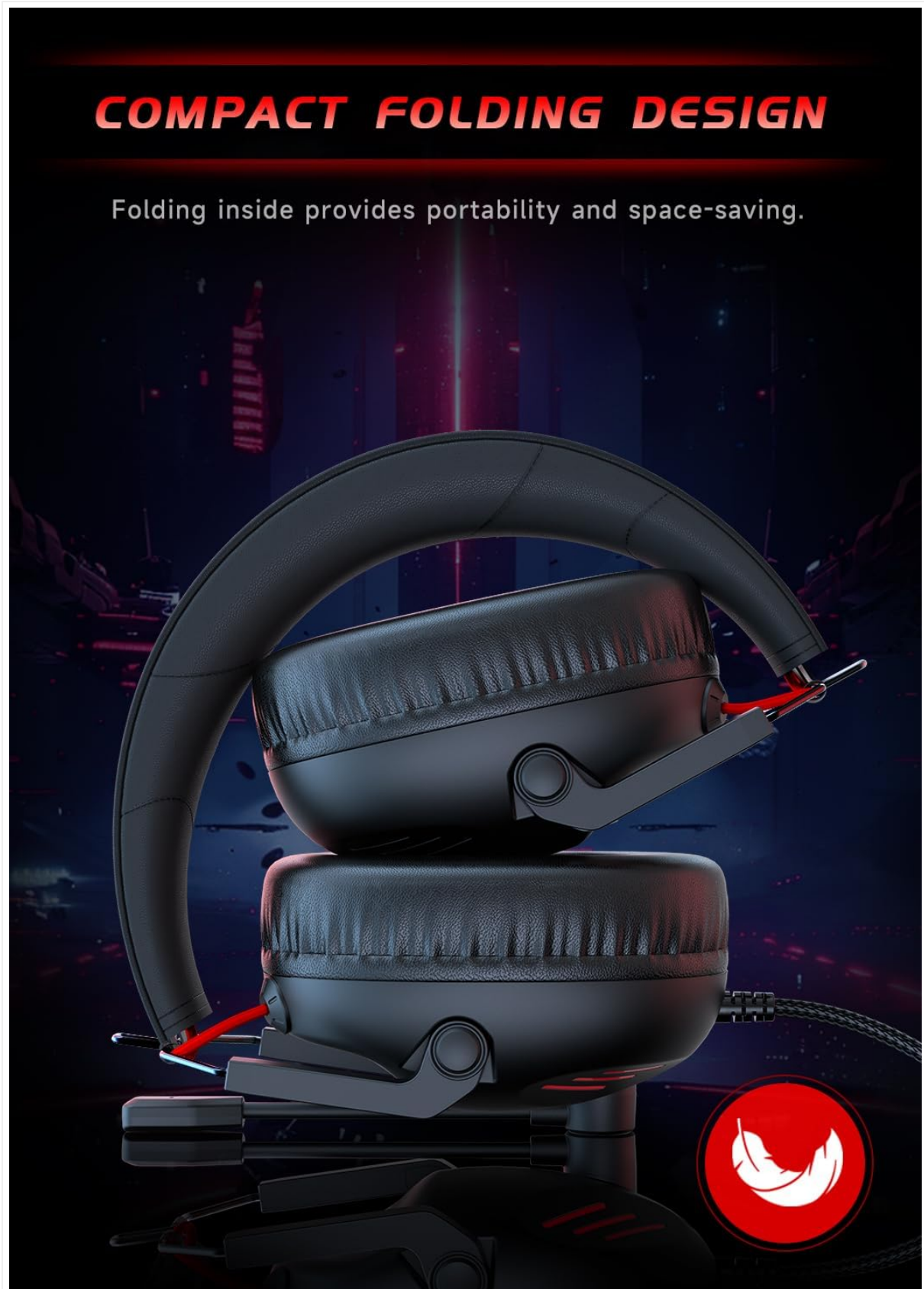
Image: The CM7007 headset demonstrating its compact folding design for portability and storage.

The headset features a folding design, allowing the earcups to fold inwards for compact storage and enhanced portability.