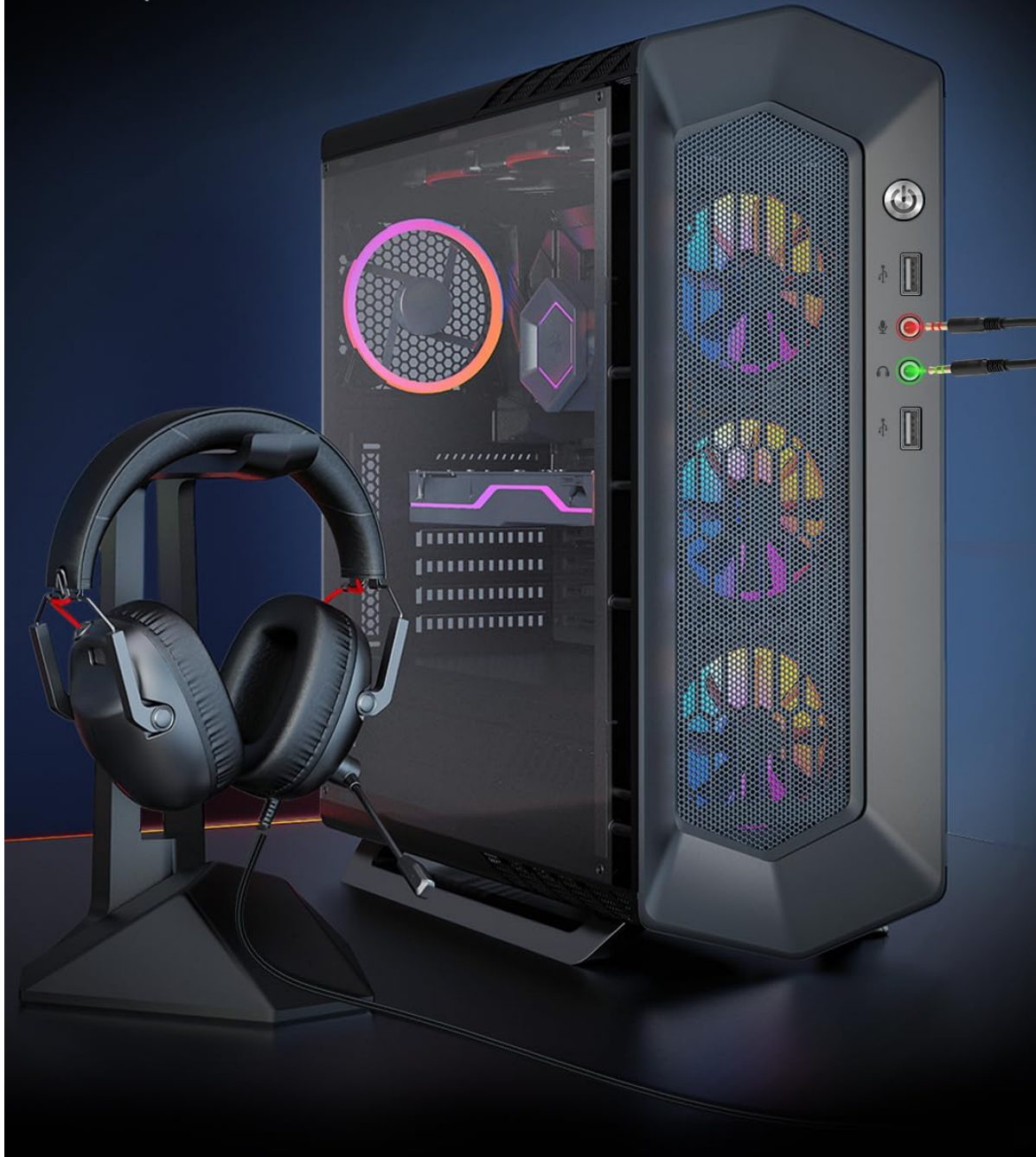
Image: The CM7007 headset connected to a desktop PC, illustrating the use of an audio splitter for separate audio and microphone jacks.

When using on a PC, an audio connection requires a splitter cable.