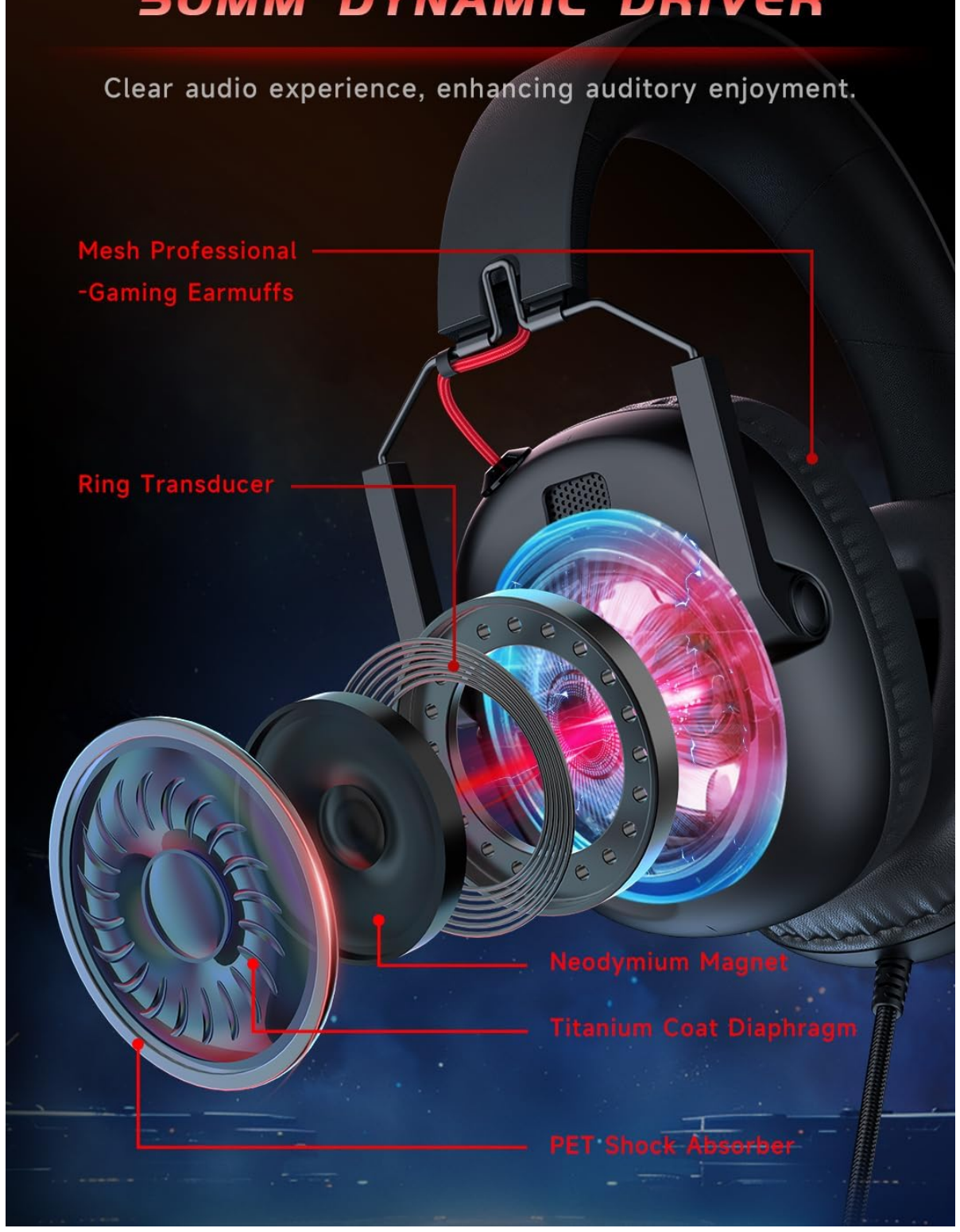
Image: Exploded view of the 50mm dynamic driver, showing components like the neodymium magnet and titanium coat diaphragm.

Clear audio experience, enhancing auditory enjoyment.