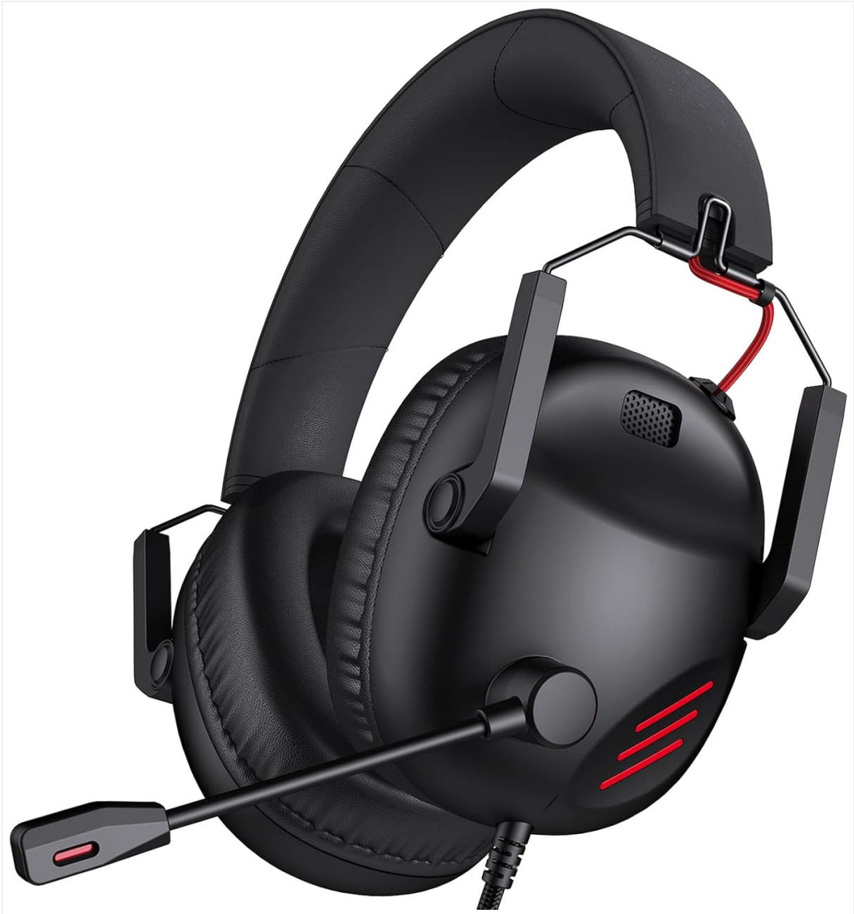
Image: The KAPEYDESI CM7007 Gaming Headset, showing its overall design with microphone and cable.

The CM7007 headset connects via a 3.5mm audio jack. Ensure the jack is fully inserted into the device's audio port.