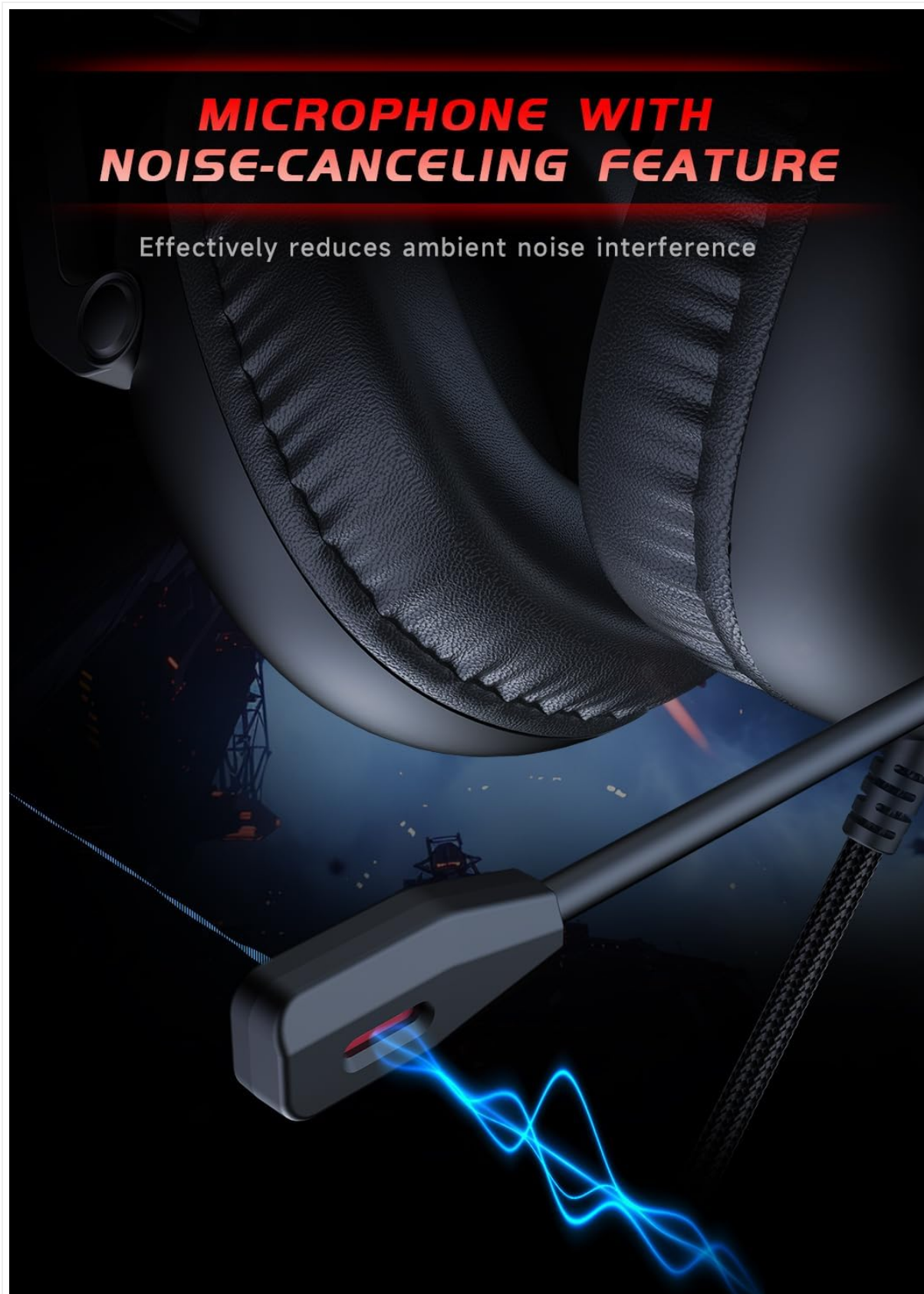
Image: Close-up of the CM7007 headset's microphone, highlighting its noise-canceling capability.

A one-touch mute button is integrated on the headset cable or ear cup. Press this button to quickly mute or unmute the microphone.