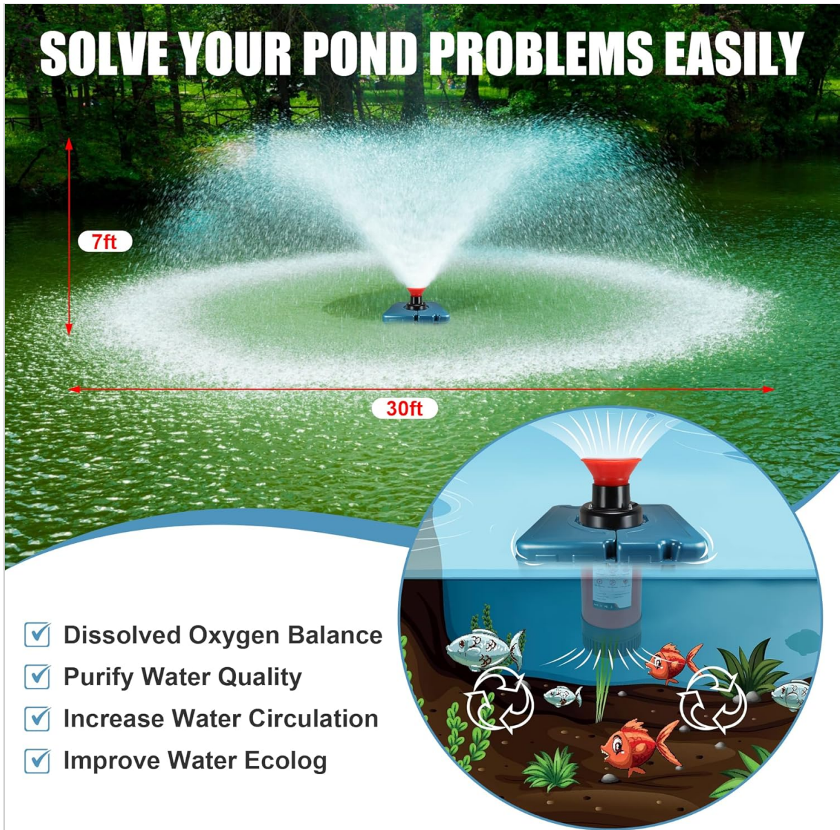
Image: Product dimensions of the Goldlife F1-4 Pond Fountain Aerator, including the pump, float, and nozzle heads.