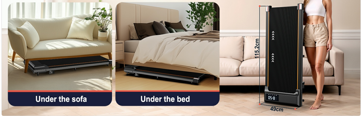
Image: The VOWVIT TW1 Treadmill's space-saving design is illustrated by showing it stored conveniently under a sofa and under a bed, making it suitable for homes with limited space.