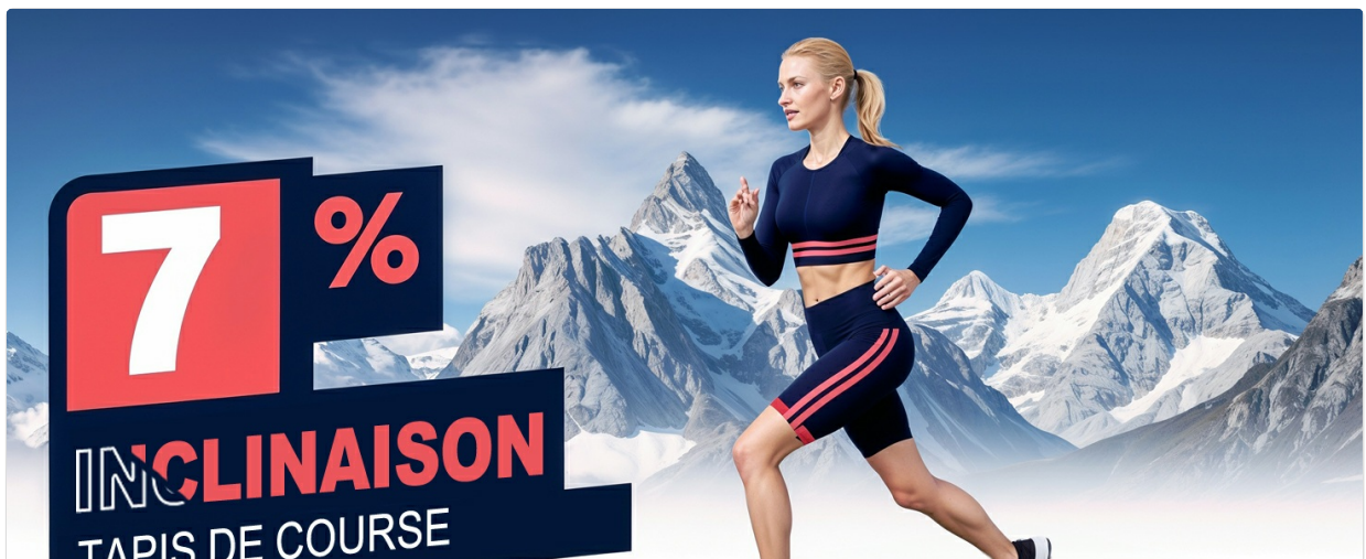
Image: A woman is shown running on the VOWVIT TW1 treadmill, highlighting its 7% incline capability for enhanced workout intensity.