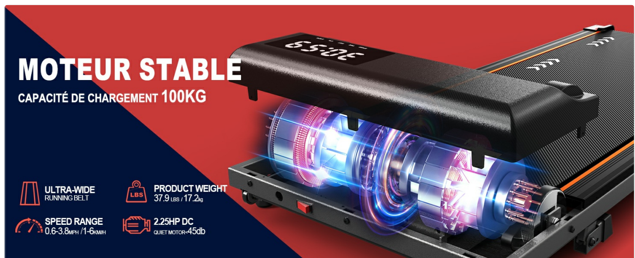
Image: An internal view of the VOWVIT TW1 treadmill's motor, illustrating its robust construction designed for stable and quiet operation, capable of supporting up to 100 kg.