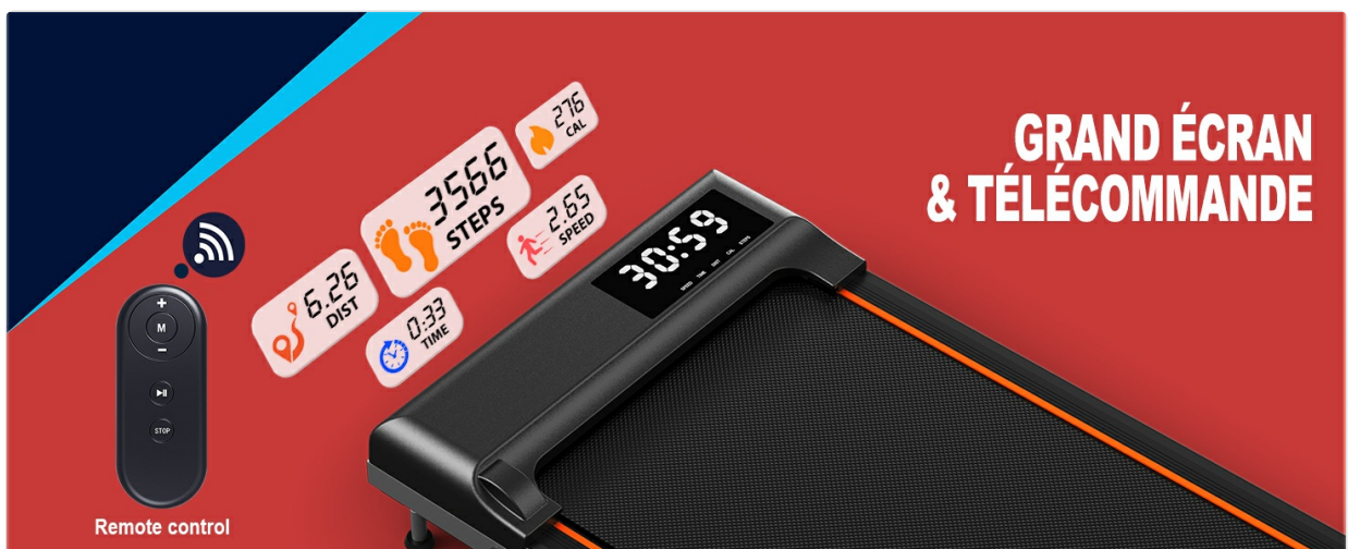
Image: The treadmill's LED display provides real-time workout metrics such as steps, distance, time, speed, and calories. A compact remote control is shown for convenient speed adjustment.