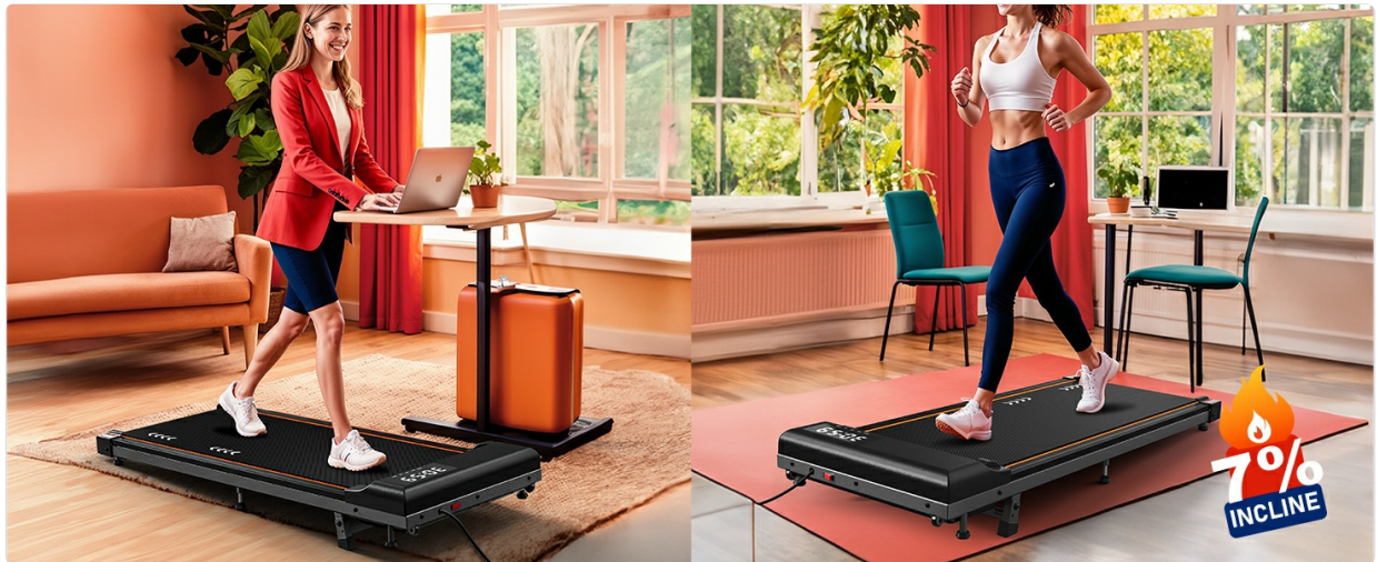
Image: The VOWVIT TW1 Treadmill offers dual functionality. One user is shown walking on the pad while working at a standing desk, and another is running on the treadmill with the 7% incline feature activated.