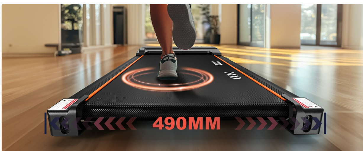
Image: A close-up view emphasizes the generous 490mm width of the VOWVIT TW1 treadmill's running surface, providing ample space for comfortable and safe workouts.