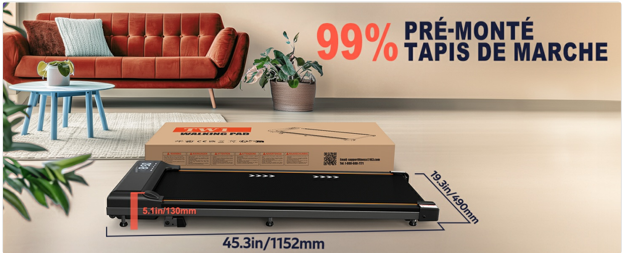
Image: The VOWVIT TW1 Treadmill is 99% pre-assembled, simplifying the setup process. The image displays the treadmill with its packaging and key dimensions (1152mm length, 490mm width, 130mm height).