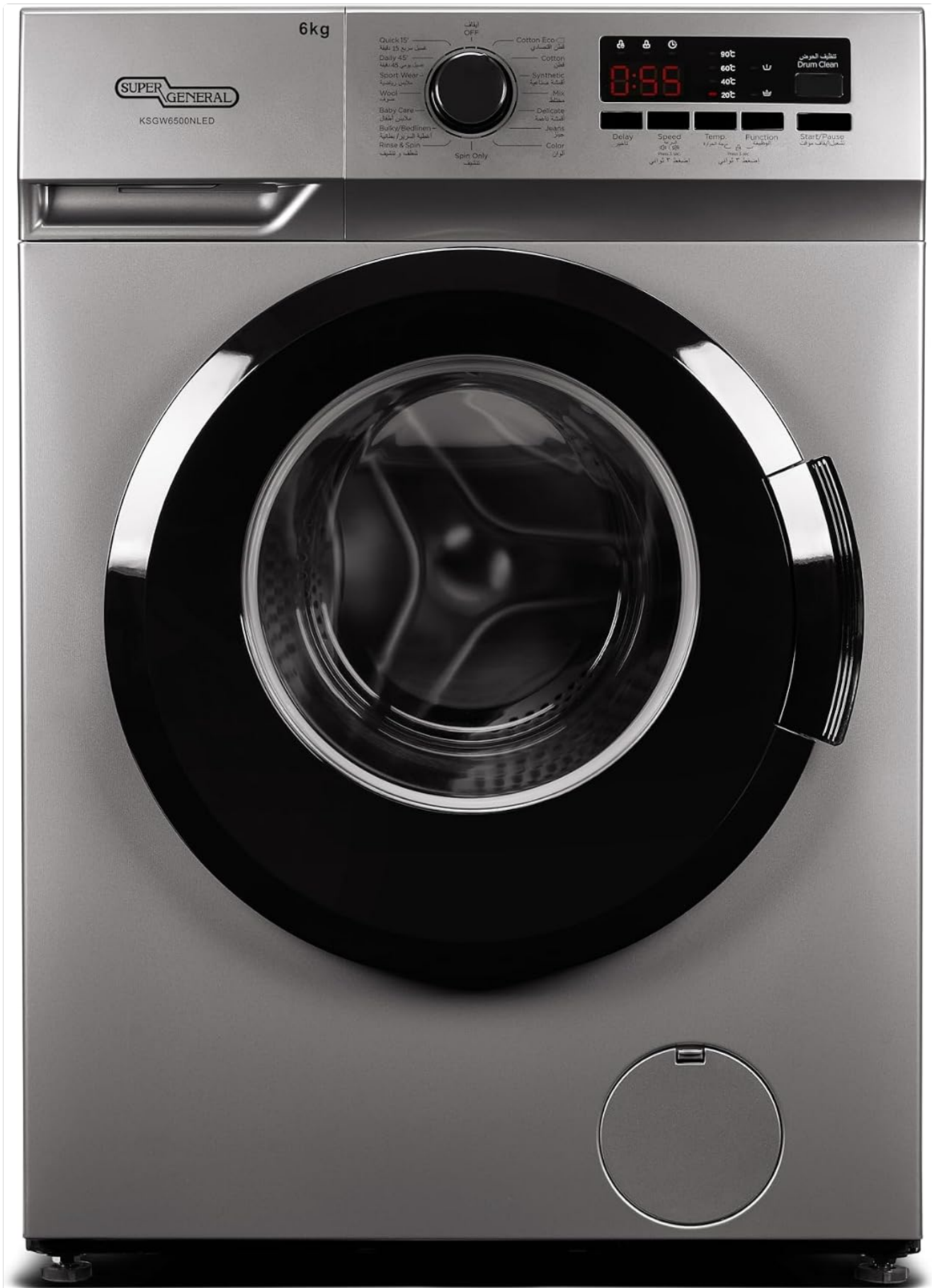
Figure 2.1: Front view of the Super General KSGW6500NLED washing machine.