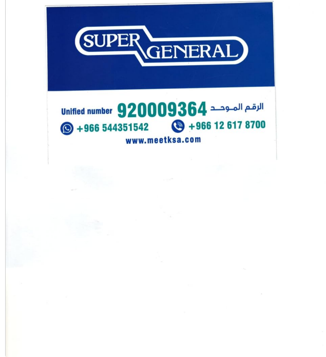
Figure 9.1: Super General Service Center Contact Details.