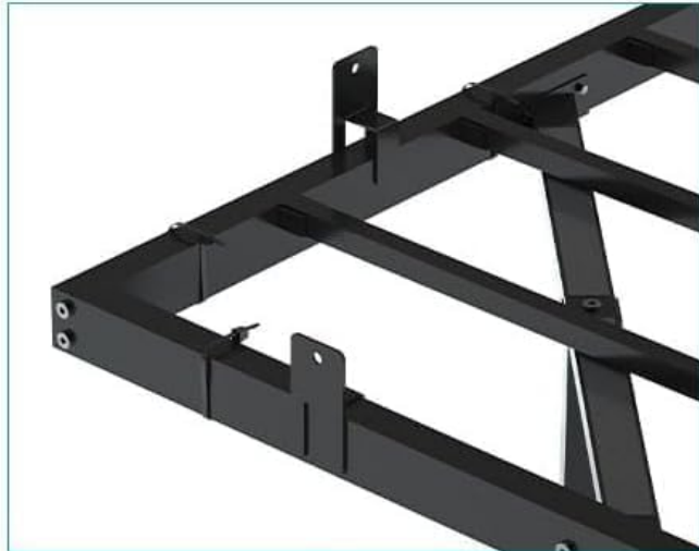
Mattress Slide Stopper