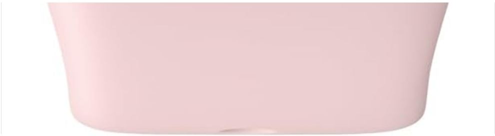
Image: A close-up view of the Smart Band 9 Pro's strap and its attachment mechanism.