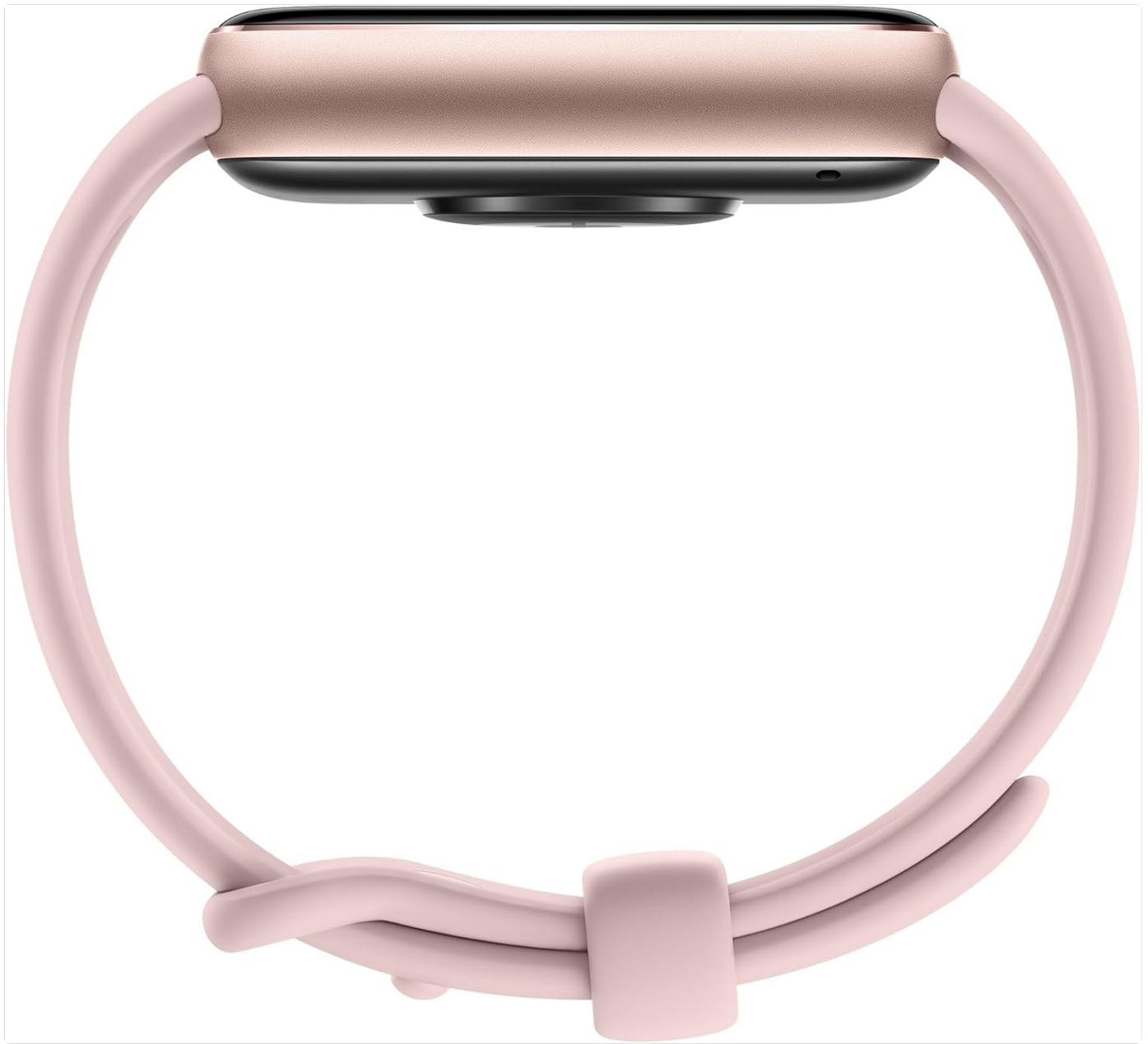
Image: Rear view of the Smart Band 9 Pro, highlighting the charging contacts and sensors.