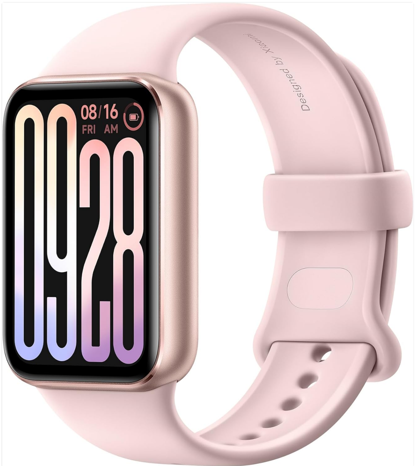
Image: The Xiaomi Smart Band 9 Pro, showcasing its main unit and the attached strap.