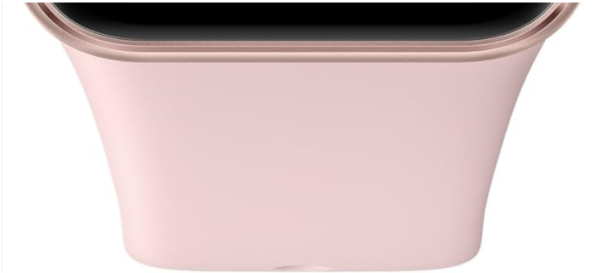
Image: Front view of the Smart Band 9 Pro display, showing the time and date.