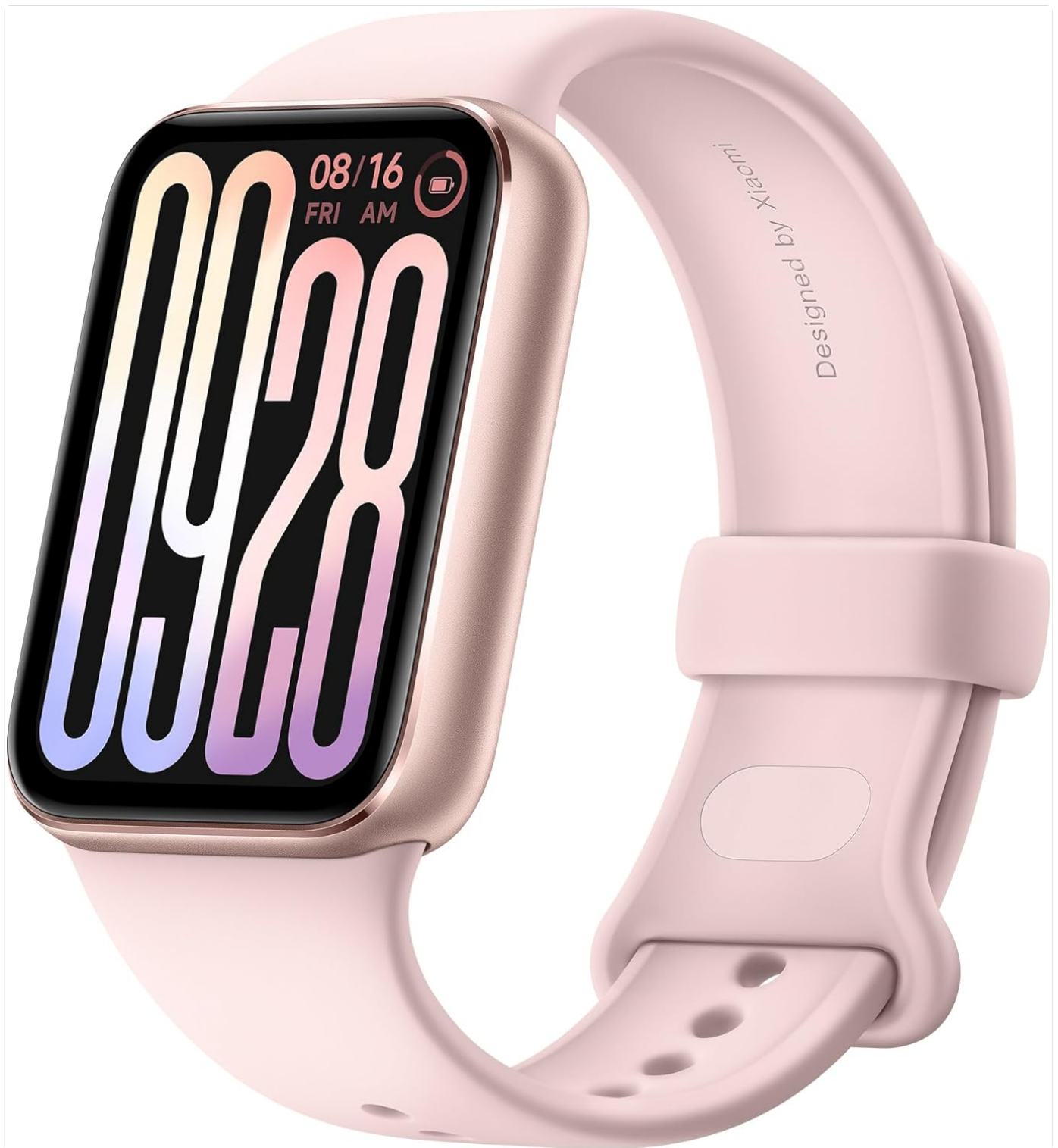
Image: The Xiaomi Smart Band 9 Pro comfortably worn on a wrist, showcasing its sleek design.