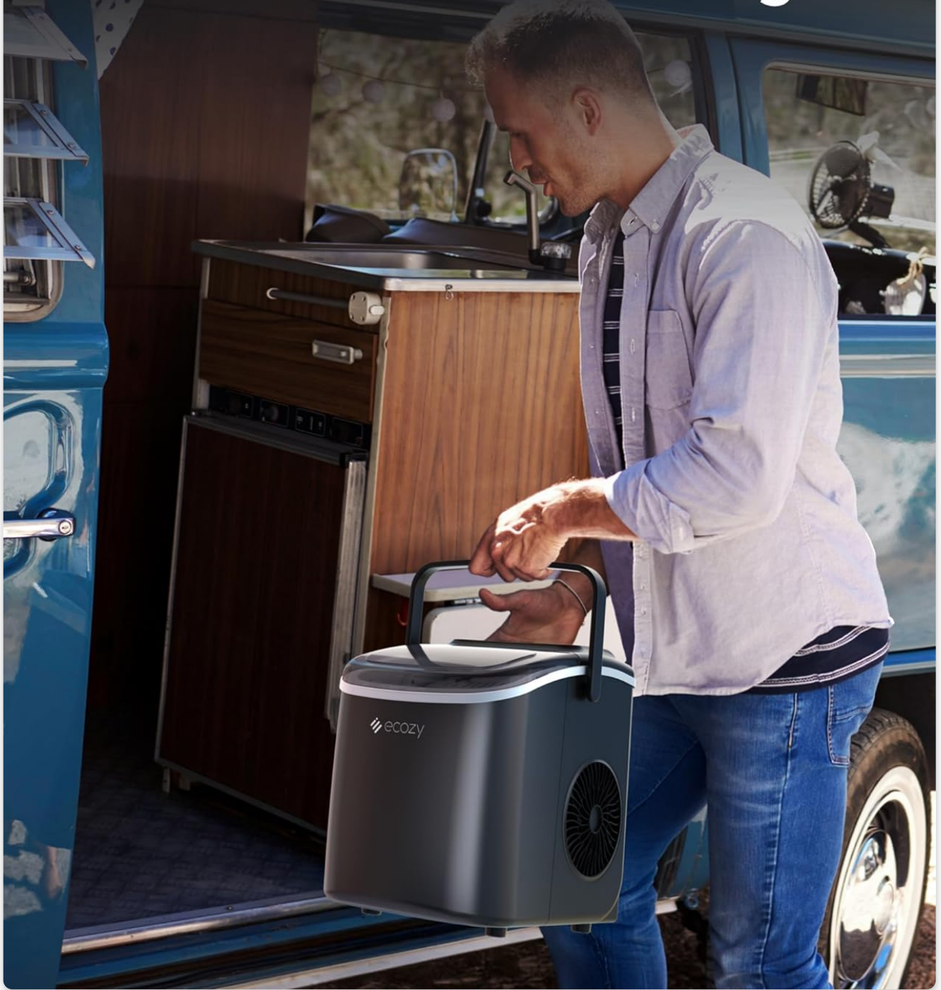
Image 1.2: The portable handle design facilitates easy transport of the ice maker.