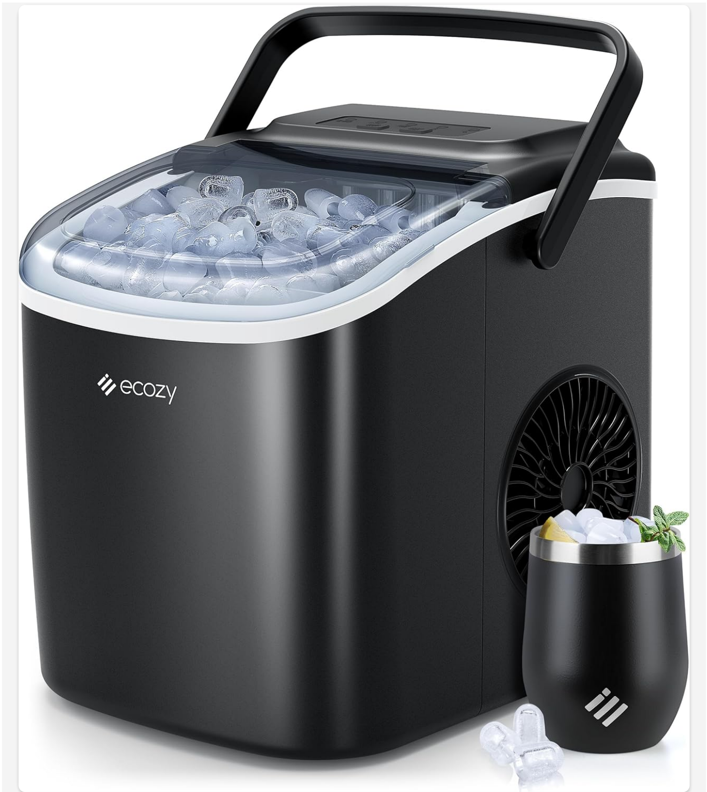
Image 1.1: The ecozy IM-BS260C Countertop Ice Maker, showcasing its compact design and included insulated cup.

Its compact footprint makes it easy to place on any countertop, seamlessly fitting into your kitchen, office, or RV setup. The integrated handle allows for easy portability.