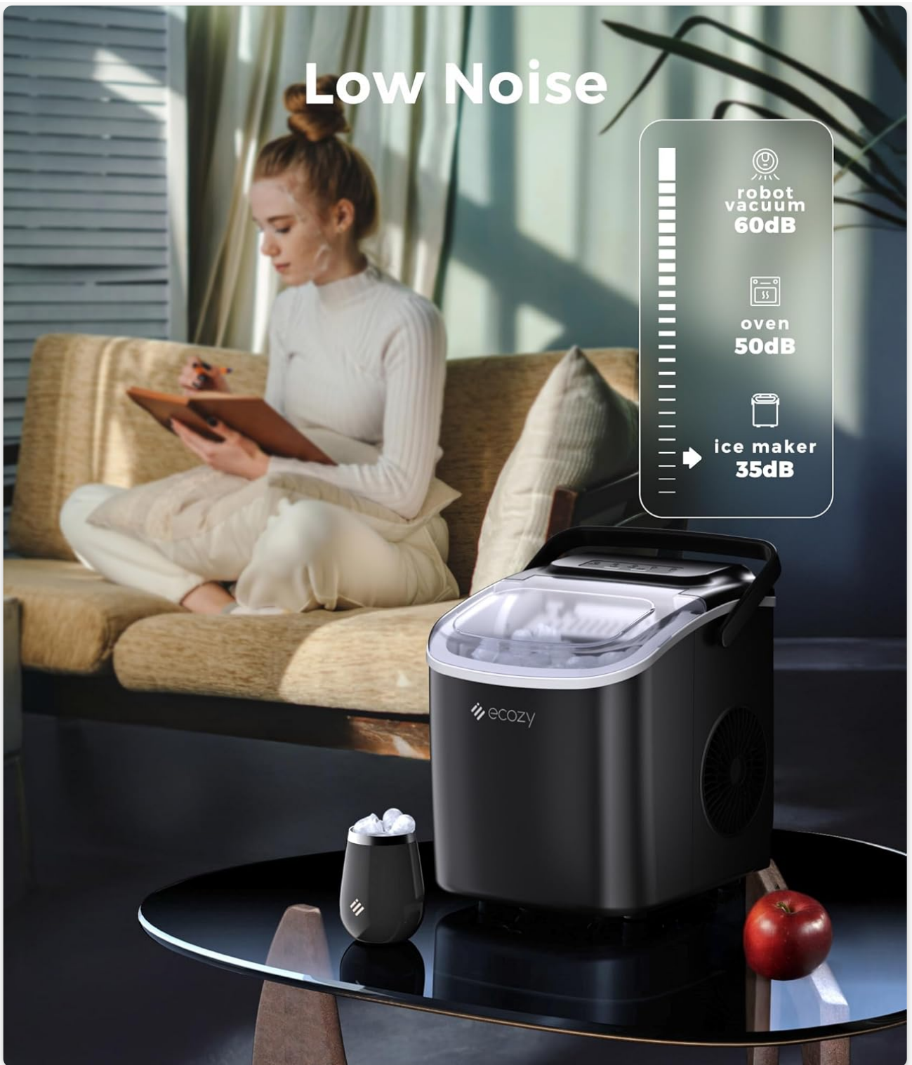
Image 4.3: The ice maker's low noise operation, suitable for various environments.