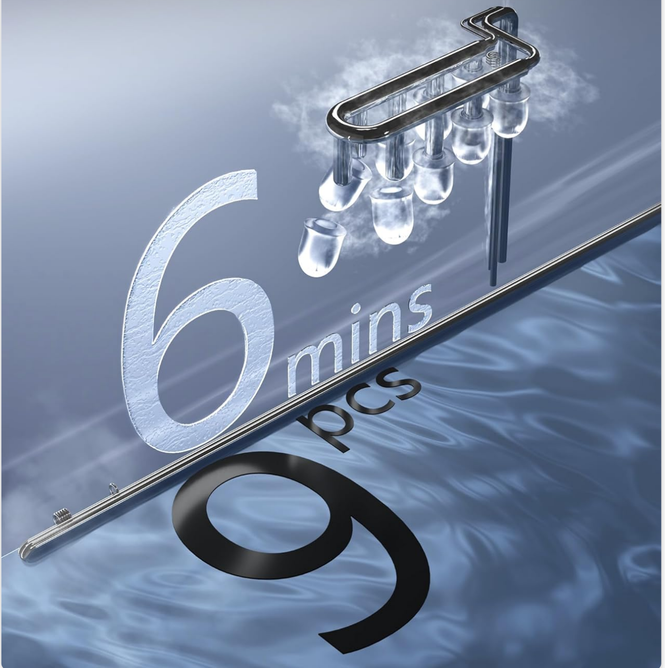
Image 4.2: The ice maker produces 9 ice cubes in approximately 6 minutes.