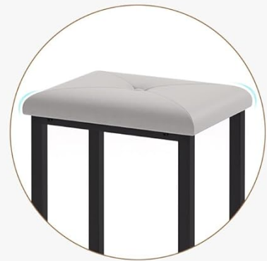
Ergonomic Design Stool