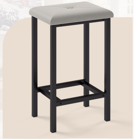
Image 5.2: Stools can be stored under the table for efficient space utilization.