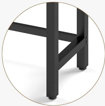
High Quality Thickened Metal Frame