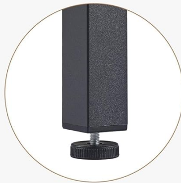
Non-slip Table Feet