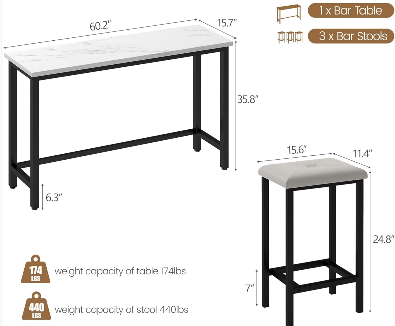
Image 3.1: Visual representation of the included components and their general dimensions.