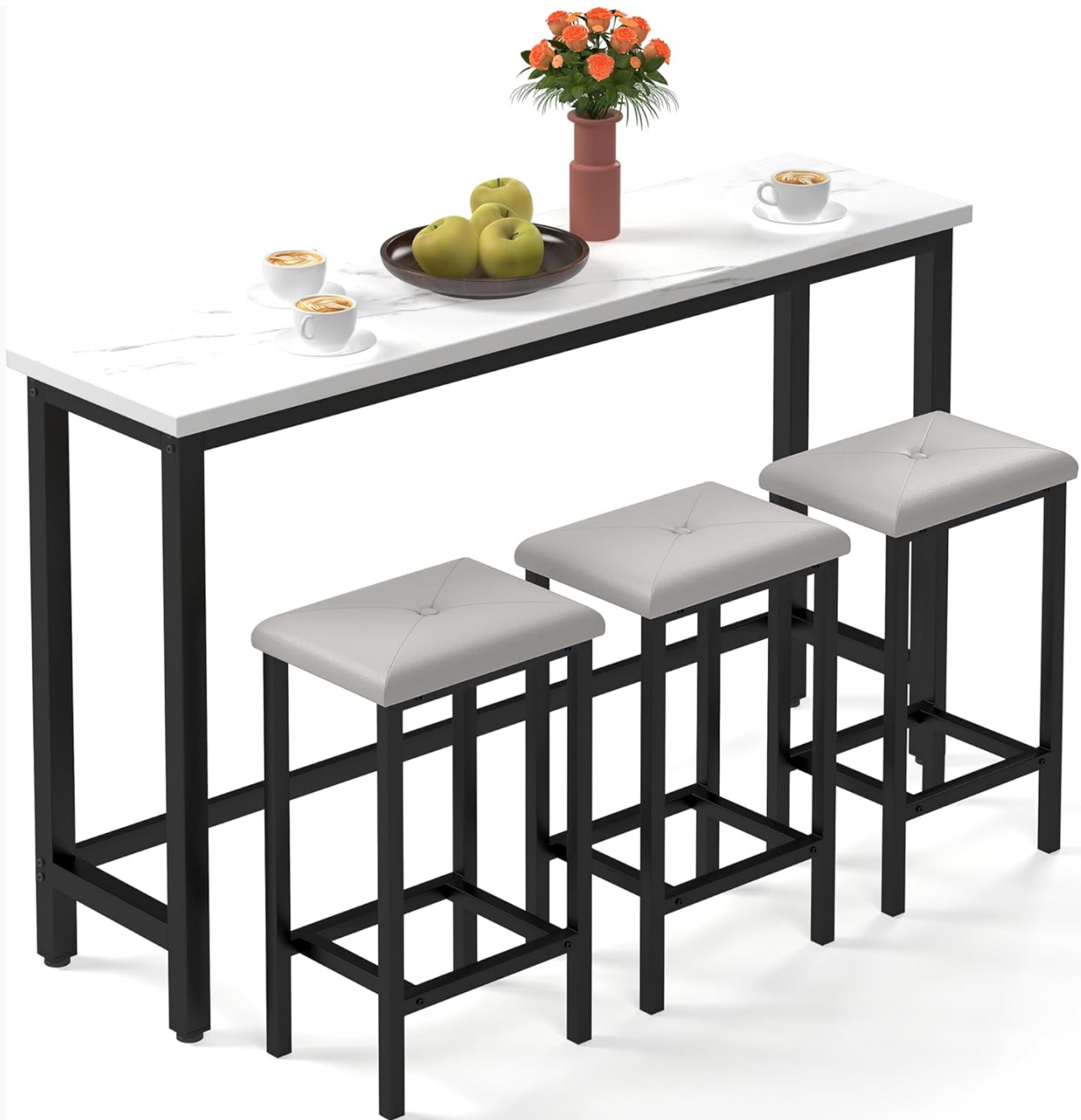
Image 1.1: The uhomepro 4-Piece Kitchen Bar Table Set, featuring one table and three stools.