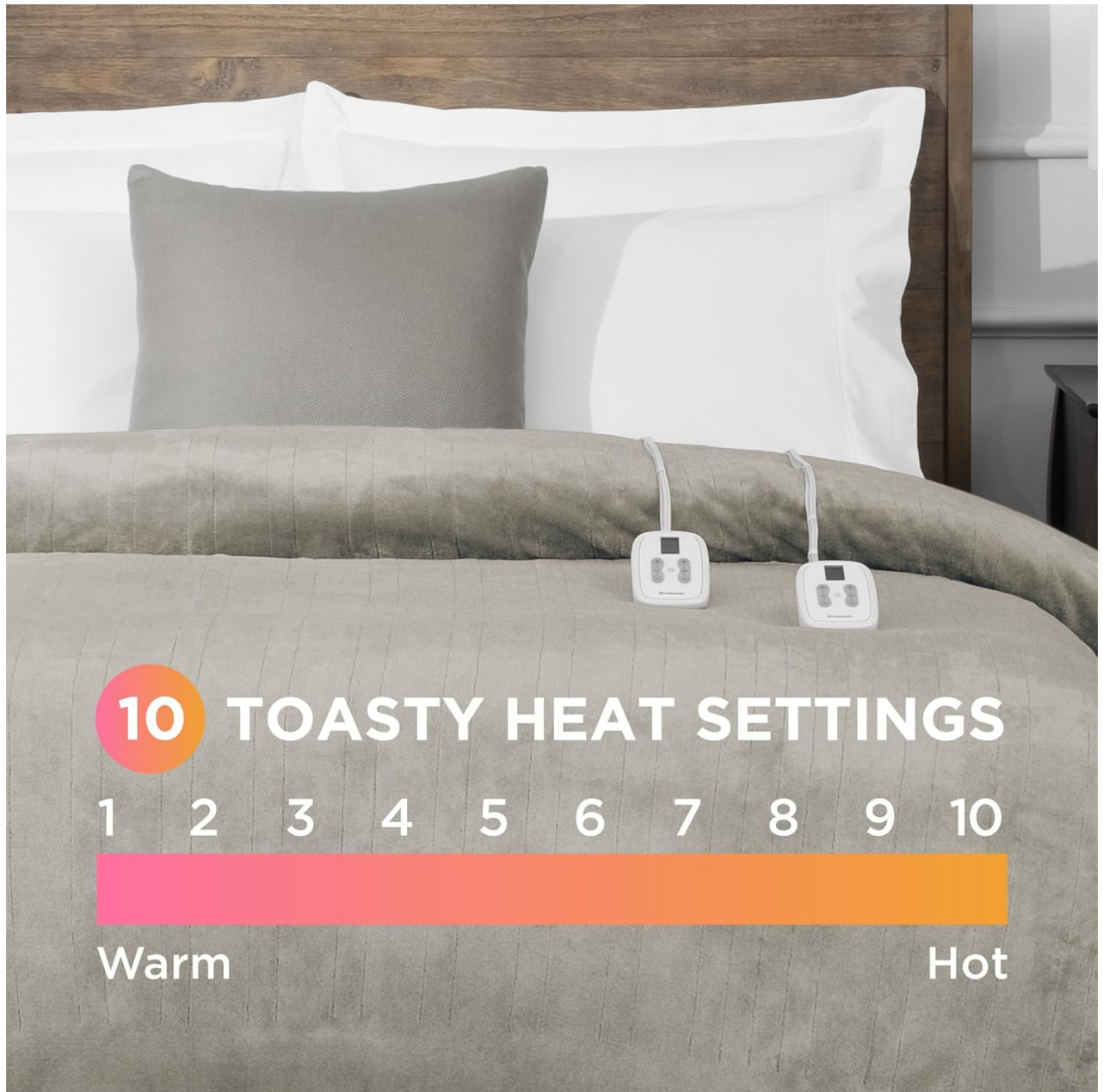
Image: The blanket offers 10 customizable heat settings for optimal comfort.