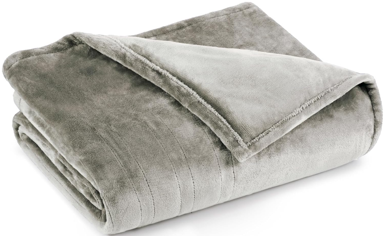
Image: The King size blanket measures 100 inches by 90 inches.