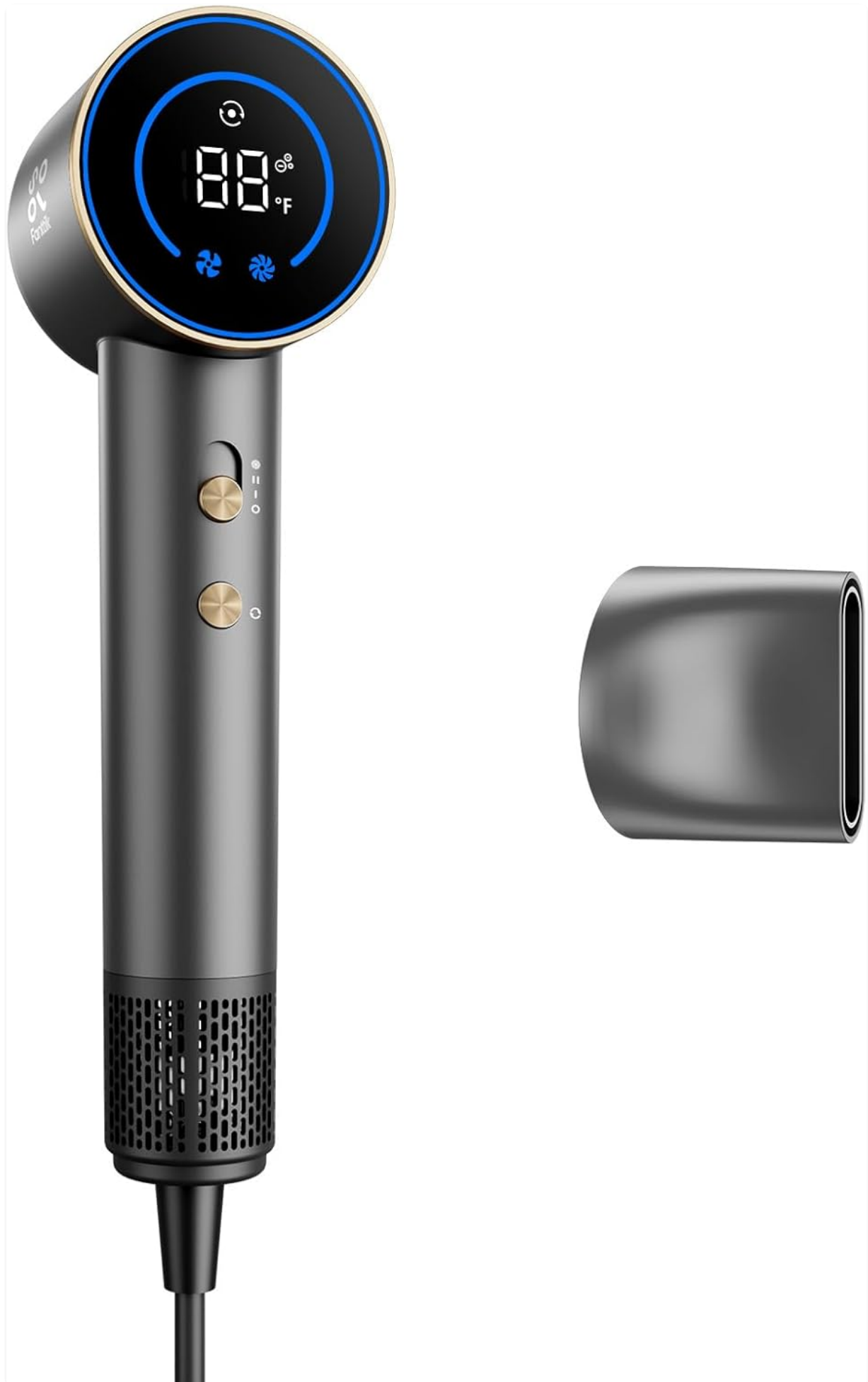
Image: The Fanttik Solo SonicDry H10 APEX Hair Dryer in grey, featuring its sleek design and the magnetic concentrator nozzle.