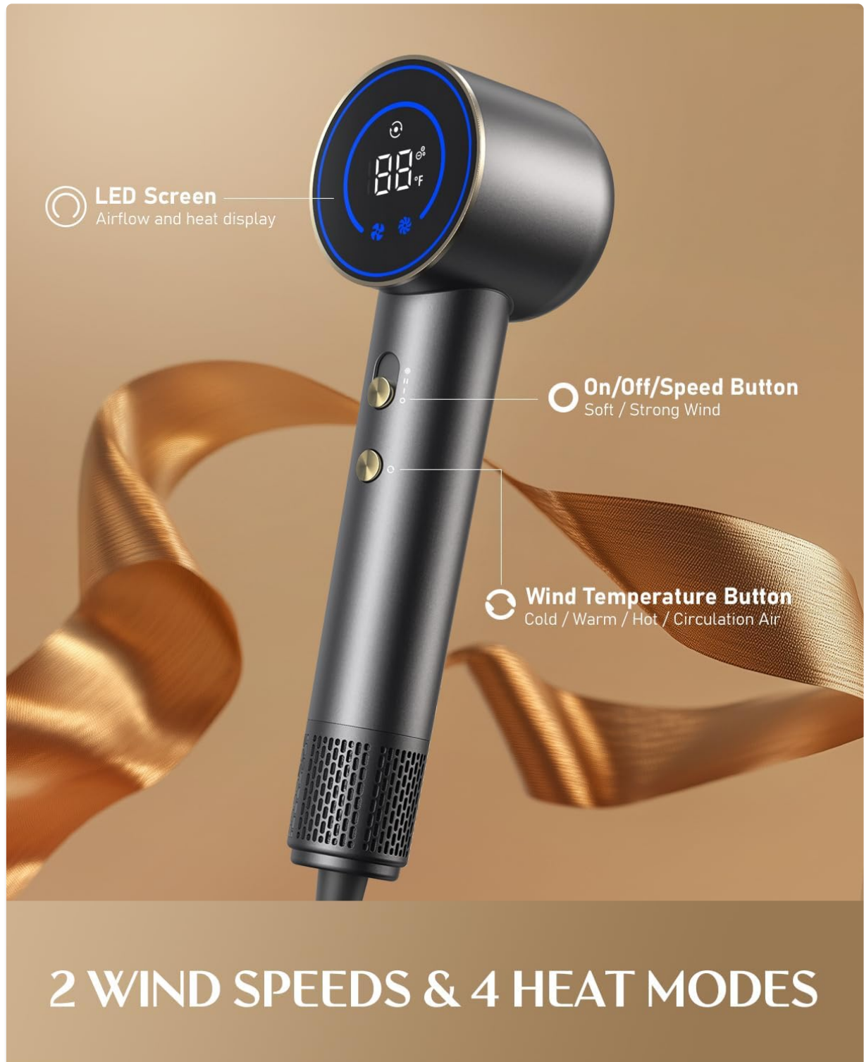
Image: A detailed view of the hair dryer's handle, showing the LED screen displaying airflow and heat, the On/Off/Speed button, and the Wind Temperature button.

Familiarize yourself with the controls for optimal styling: