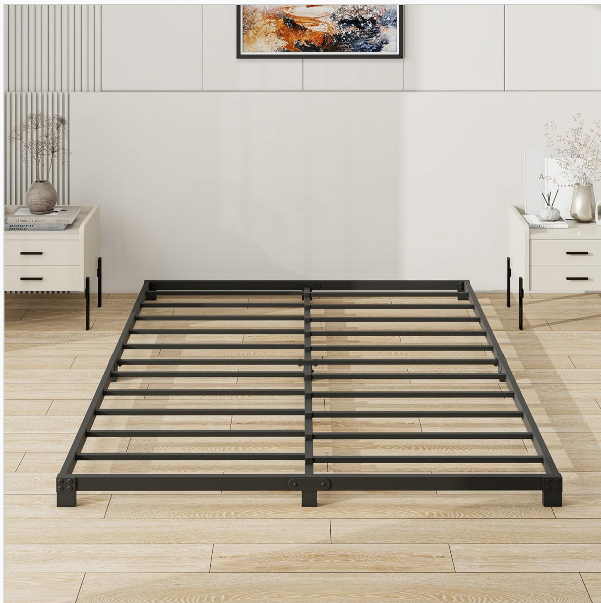
Image: The fully assembled VERFARM bed frame, showcasing its low-profile design and metal slat support system, ready for a mattress.