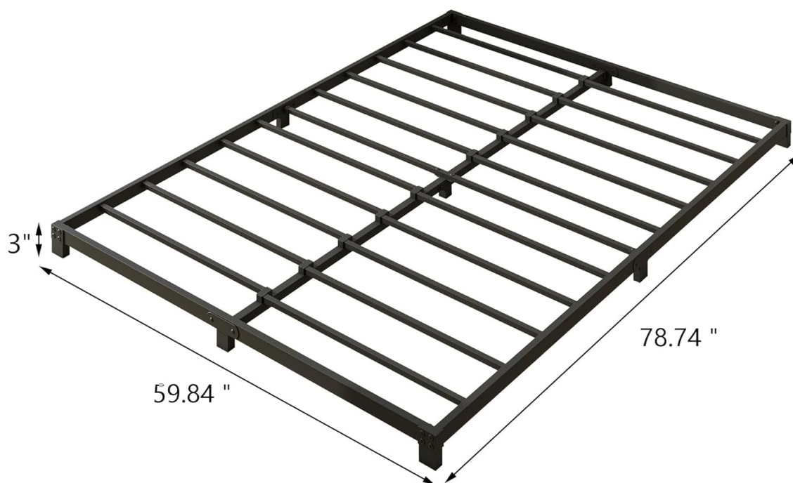
Image: A diagram illustrating the length, width, and height of the bed frame, confirming its 3-inch low profile.