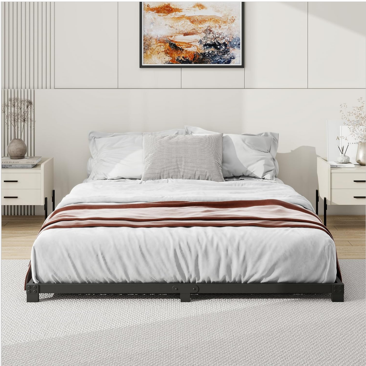
Image: The VERFARM bed frame with a mattress and bedding, illustrating its low-profile appearance in a bedroom setting.