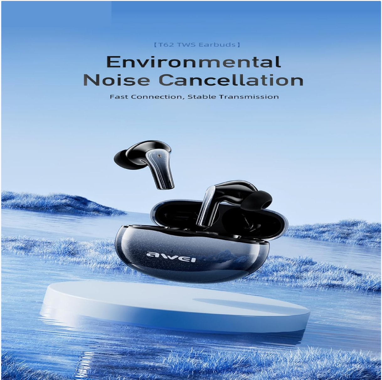
Image: The AWEI T62 TWS earbuds are featured in a dark color, highlighting their Environmental Noise Cancellation (ENC) capability. The background suggests a serene, watery environment, implying clear sound even in noisy settings.