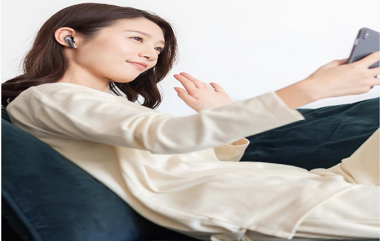
Image: A person is shown smiling and holding a smartphone, seemingly engaged in a video call or conversation, while wearing the AWEI T62 earbuds. The image emphasizes the ENC Voice Call feature for high-definition speaking and listening.

Pick up voice and reduce ambient noise accurately through new ENC algorithm