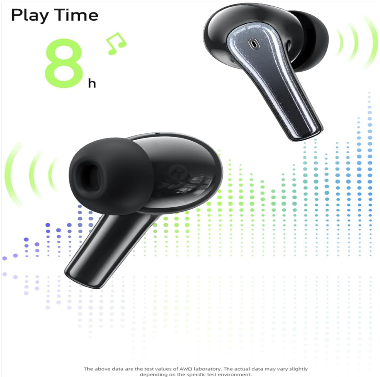
Image: Two AWEI T62 earbuds are depicted, illustrating their individual use and indicating a playtime of 8 hours per earbud. Sound waves emanate from the earbuds, suggesting audio playback.