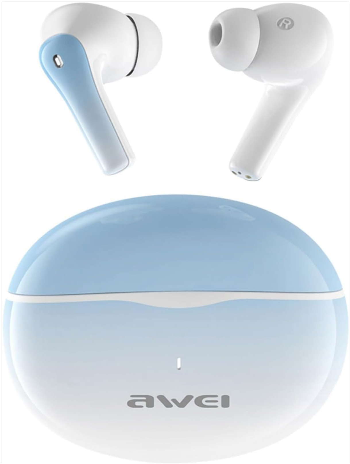
Image: The AWEI T62 wireless earbuds, one left and one right, are shown above their oval-shaped charging case. The earbuds are white with light blue accents, and the charging case is predominantly light blue with a white base, featuring the AWEI logo and an indicator light.