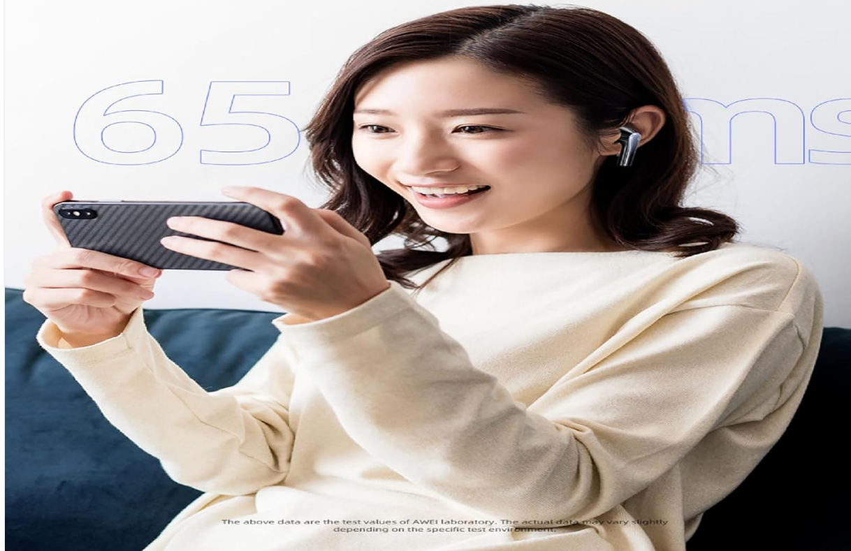
Image: A person is shown happily using the AWEI T62 earbuds while looking at a smartphone, with a graphic indicating "0.065S Insensible Delay" for audio and video synchronization, suggesting a low-latency experience ideal for gaming or video playback.

Professional e-sports surround stereo and audio & video synchronization without noise, which greatly improve the e-sports experience