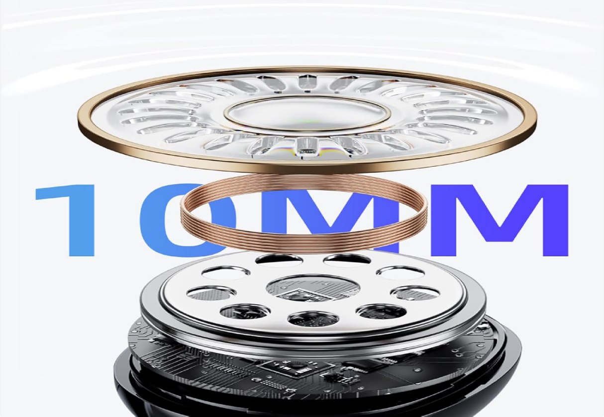
Image: A detailed cutaway view of an AWEI T62 earbud's internal components, specifically highlighting the 10mm dynamic driver. This illustrates the HiFi and energetic lossless stereo sound capabilities.

Fast & accurate dynamic / transient response breathtaking stereo field, richer music details with more clear treble, fuller middle, and deeper bass