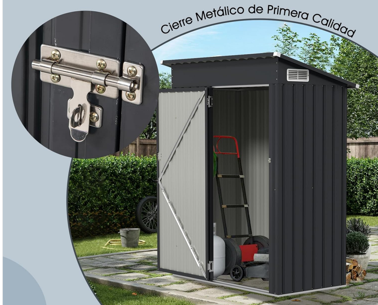
Figure 5: Detail of the convenient door design, showing the metal latch for secure closure.

Facilita la entrada y salida del cobertizo