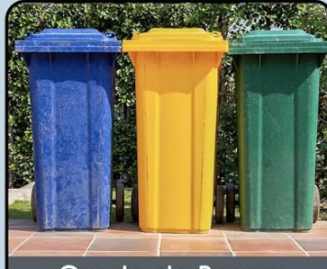
Cuarto de Basura