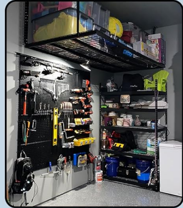
Cuarto de Servicio