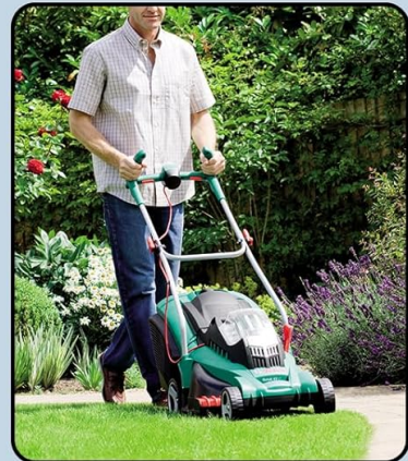
Cuarto de Herramientas