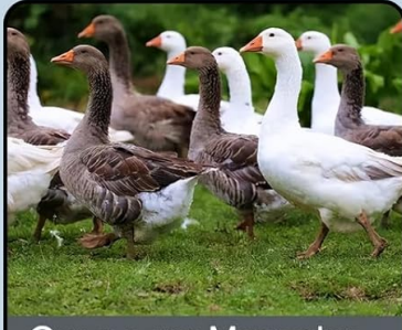
Casa para Mascotas