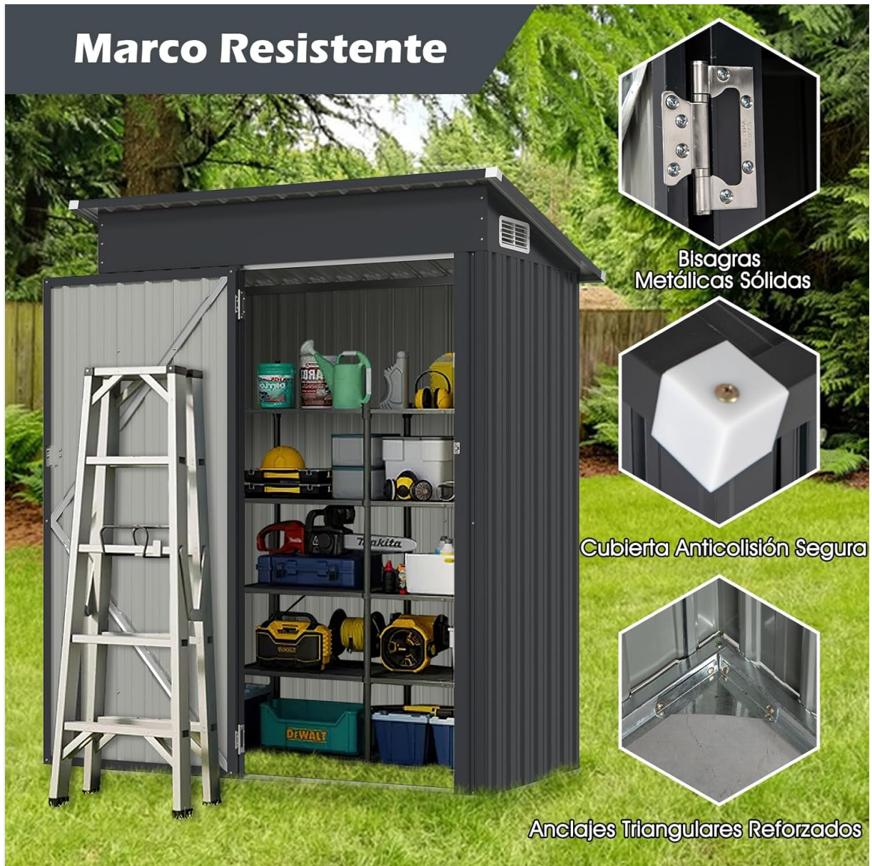
Figure 4: Details of the sturdy frame, highlighting solid metal hinges, anti-collision cover, and reinforced triangular anchors.